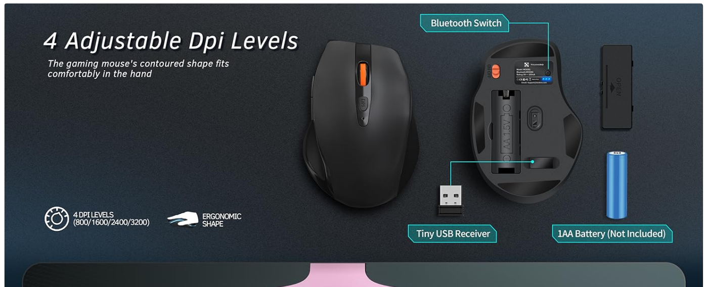
Image: A wireless gaming mouse highlighting its 4 adjustable DPI levels and showing the battery compartment with a tiny USB receiver and space for a 1AA battery.