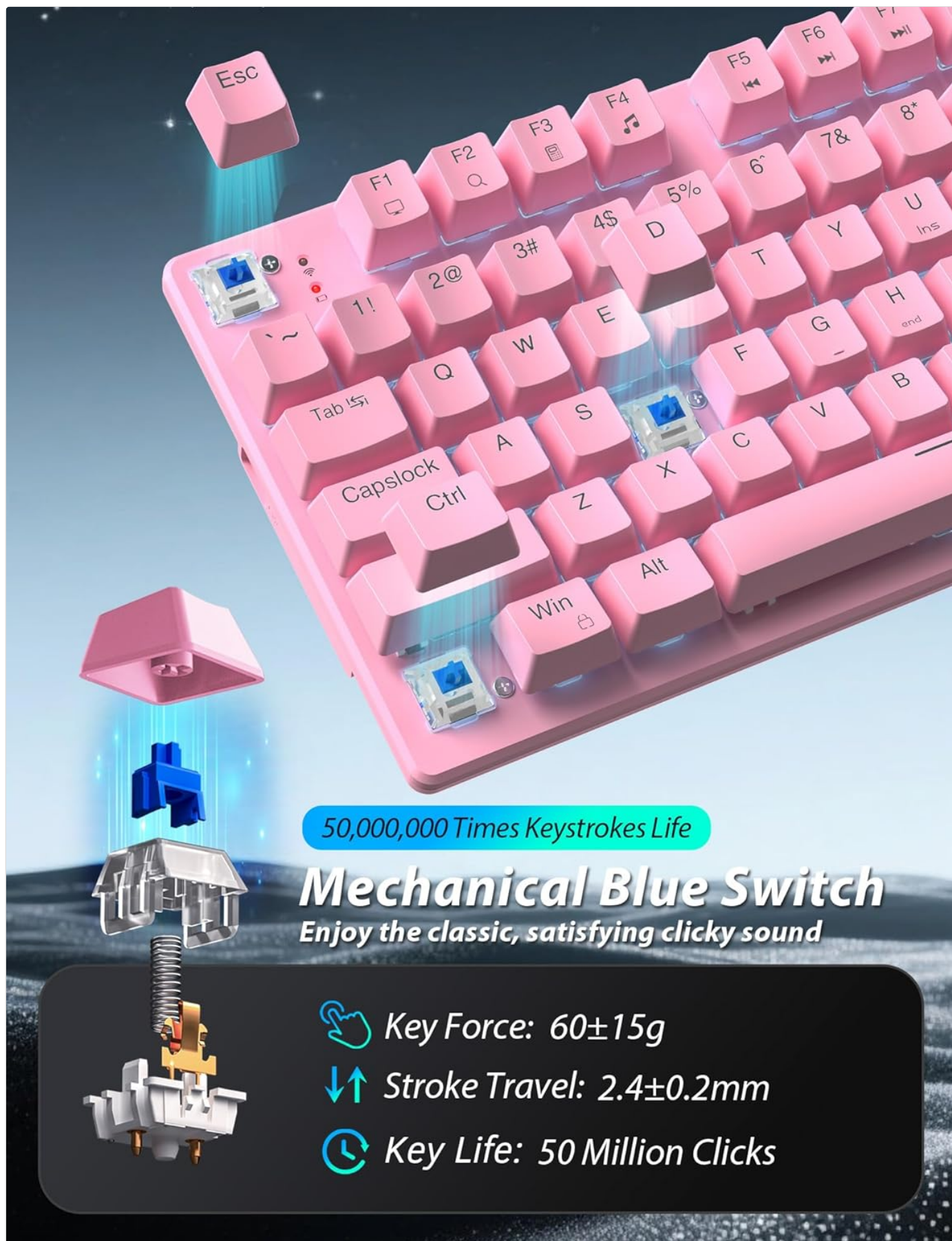
Image: A close-up view of the mechanical blue switches on the keyboard, showing the keycap removed and the switch mechanism, along with specifications like 50,000,000 keystrokes life, key force, and stroke travel.