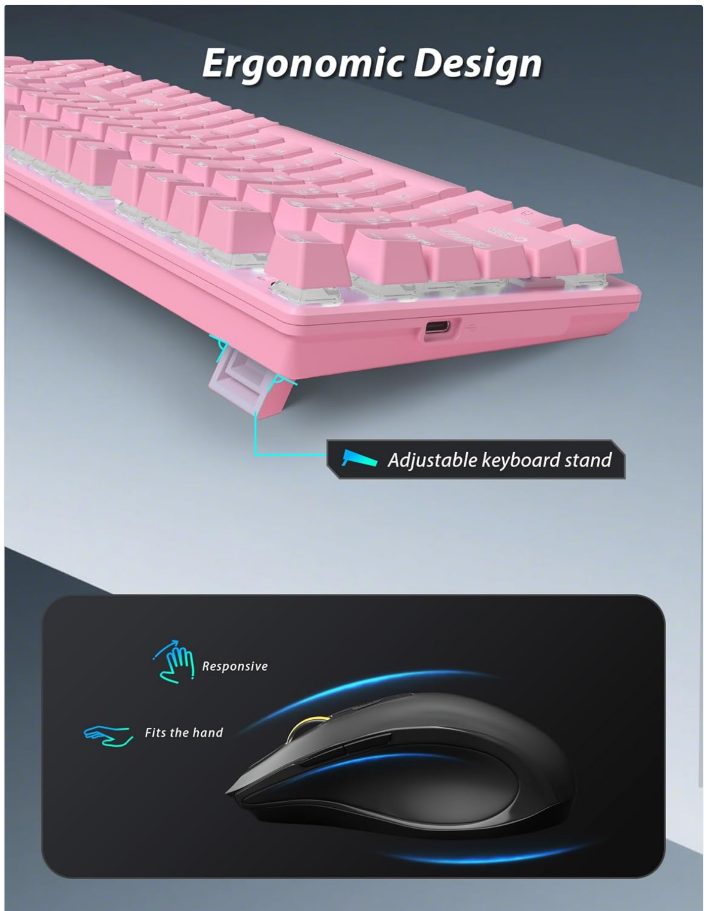
Image: A close-up view of the side of the pink mechanical keyboard, showing its ergonomic sloped design and the adjustable feet extended for comfortable typing. The accompanying mouse is also shown on a mousepad.