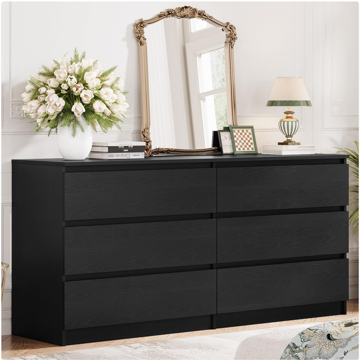
Image 1: The Angel Sar 59-inch Modern 6-Drawer Dresser, black finish, shown in a bedroom with a mirror and decorative items.