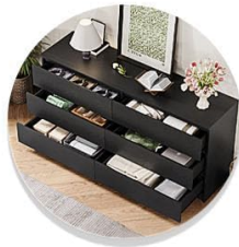
6 Large Drawers