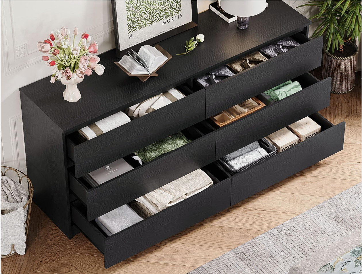
Image 3: The dresser with multiple drawers open, demonstrating its large storage capacity for various clothing items.