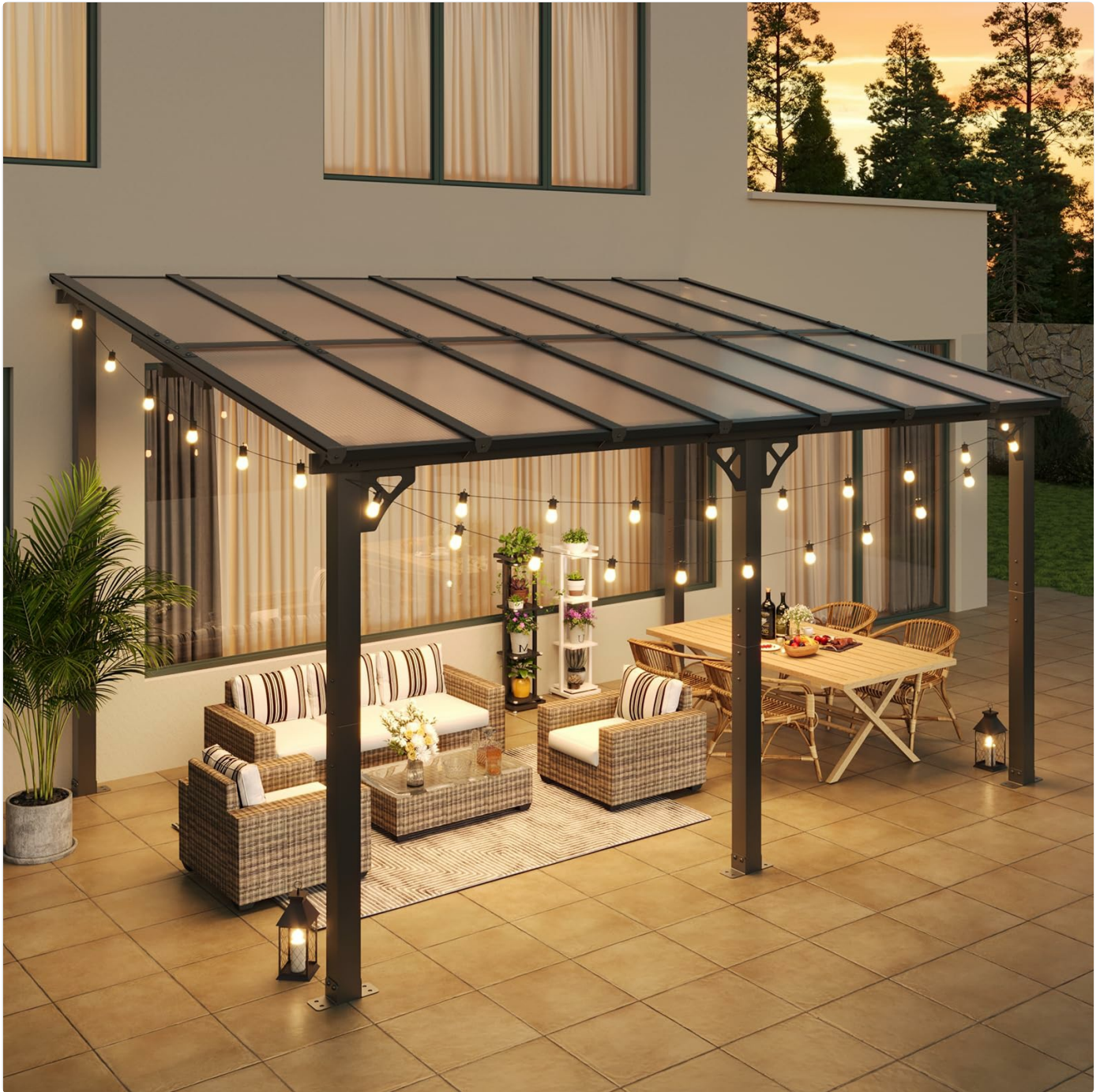
Figure 4: The Aoxun Gazebo with LED lights, enhancing evening ambiance.

The included LED lights are designed for outdoor use and are waterproof. They are typically solar-powered or battery-operated, providing illumination for extended periods. Refer to the specific light instructions for details on charging, activation, and usage modes.