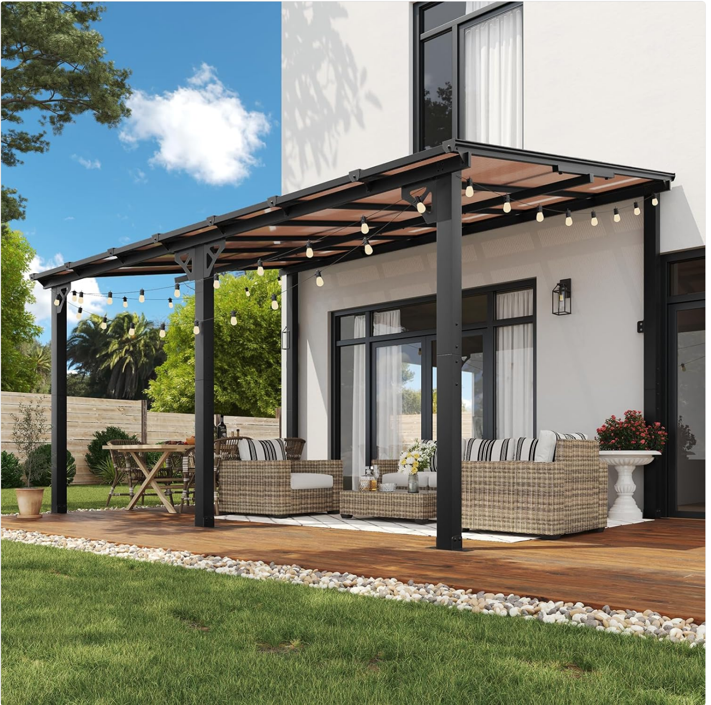
Figure 1: Gazebo designed for various weather conditions, offering UV protection, waterproofing, and rust resistance.