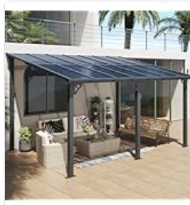
Figure 3: Close-up of critical assembly points and structural components.