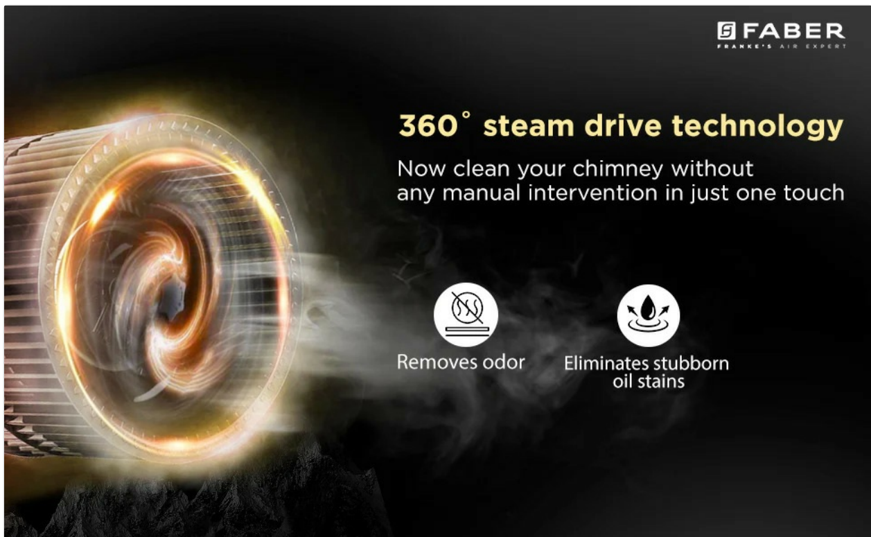
Image: Visual representation of the 360° steam drive technology, showing how steam cleans the internal components to remove odors and oil stains.

The 360° Steam Drive Technology allows for effortless cleaning of the chimney's interior with just one touch. High-temperature steam removes odor and eliminates stubborn oil stains.