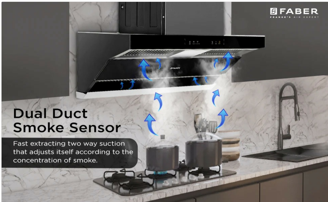
Image: Overview of the Faber Thunderstorm BLDC Steam Clean Chimney, showcasing its versatile and user-friendly design with features like built-in hood, twin suction, steam cleaning, double-stage oil tray, low noise, and smoke sensor.