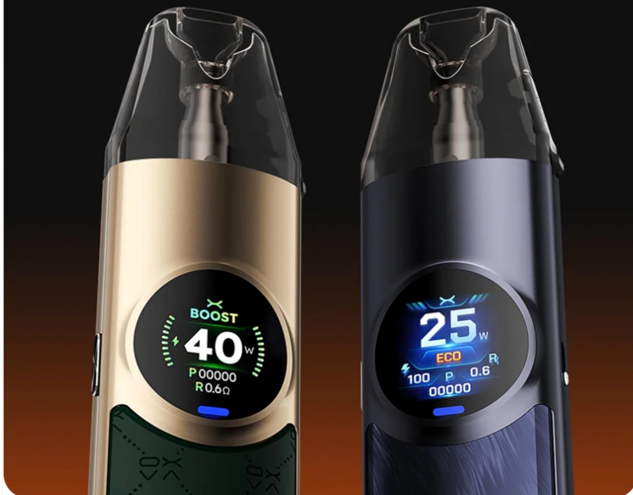
Image: Close-up of the Oxva NeXLIM device display showing Boost and Eco modes.