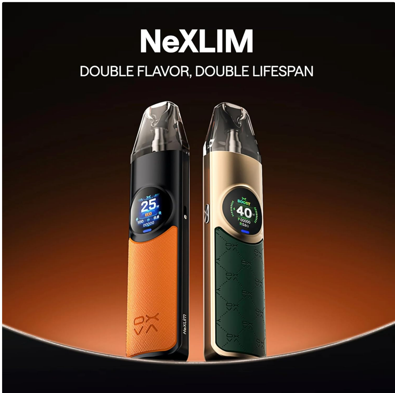
Image: Two Oxva NeXLIM Vape Kits, showcasing different color options and the sleek design.