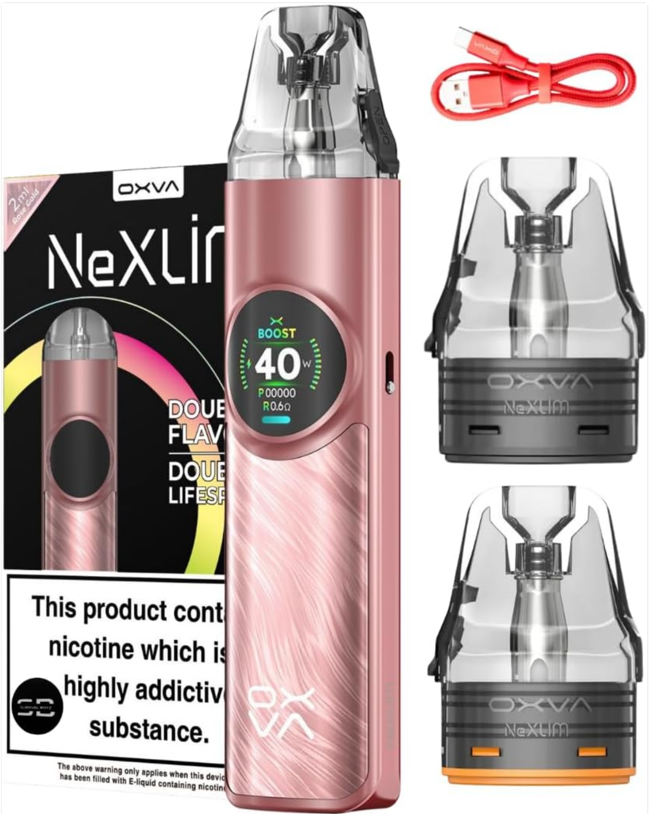
Image: Oxva NeXLIM Vape Kit with included accessories: device, two pods, and USB-C charging cable.