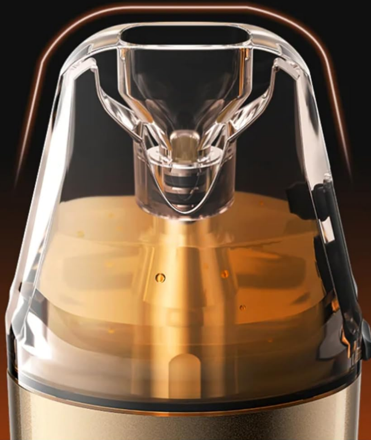
Image: Illustration of the 2ml large capacity pod for the Oxva NeXLIM Vape Kit.