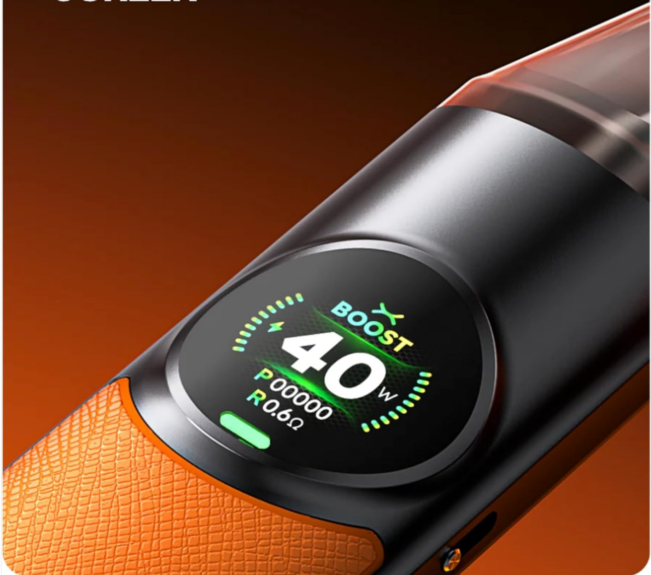
Image: Detailed view of the 0.85-inch color screen on the Oxva NeXLIM device.