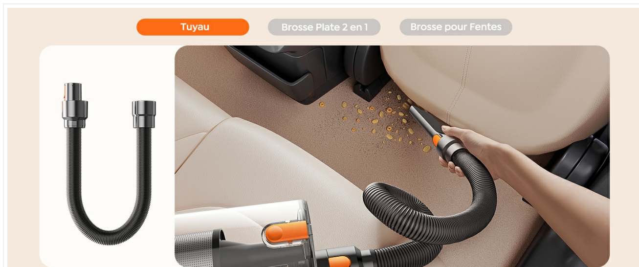
Image: All components included with the Fiety V9 Cordless Vacuum Cleaner.