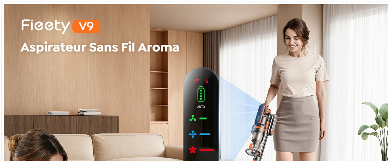
Image: The Fiety V9 in action, showcasing its 50kPa suction power on various debris.

Switch between modes using the intuitive LED touchscreen on the main unit.