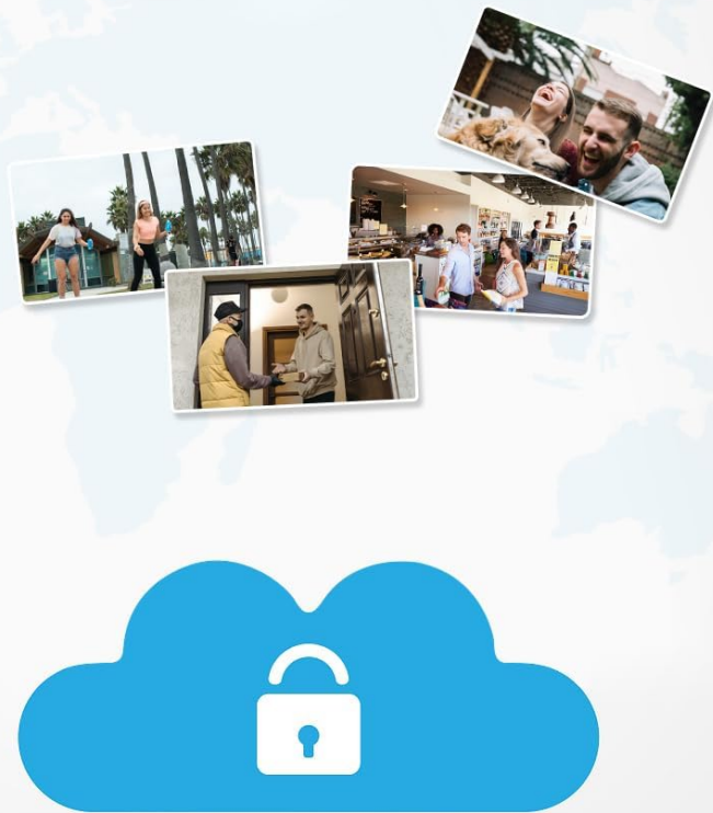
Image: An illustration depicting the cloud storage feature, showing the doorbell connecting to a cloud icon and a smartphone accessing stored videos.