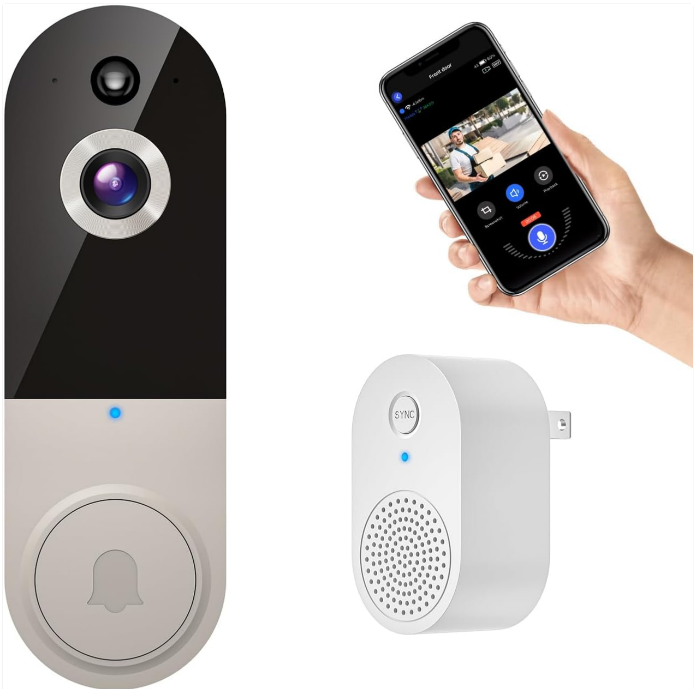
Image: HopeFlex T50 Video Doorbell and its accompanying receiver.