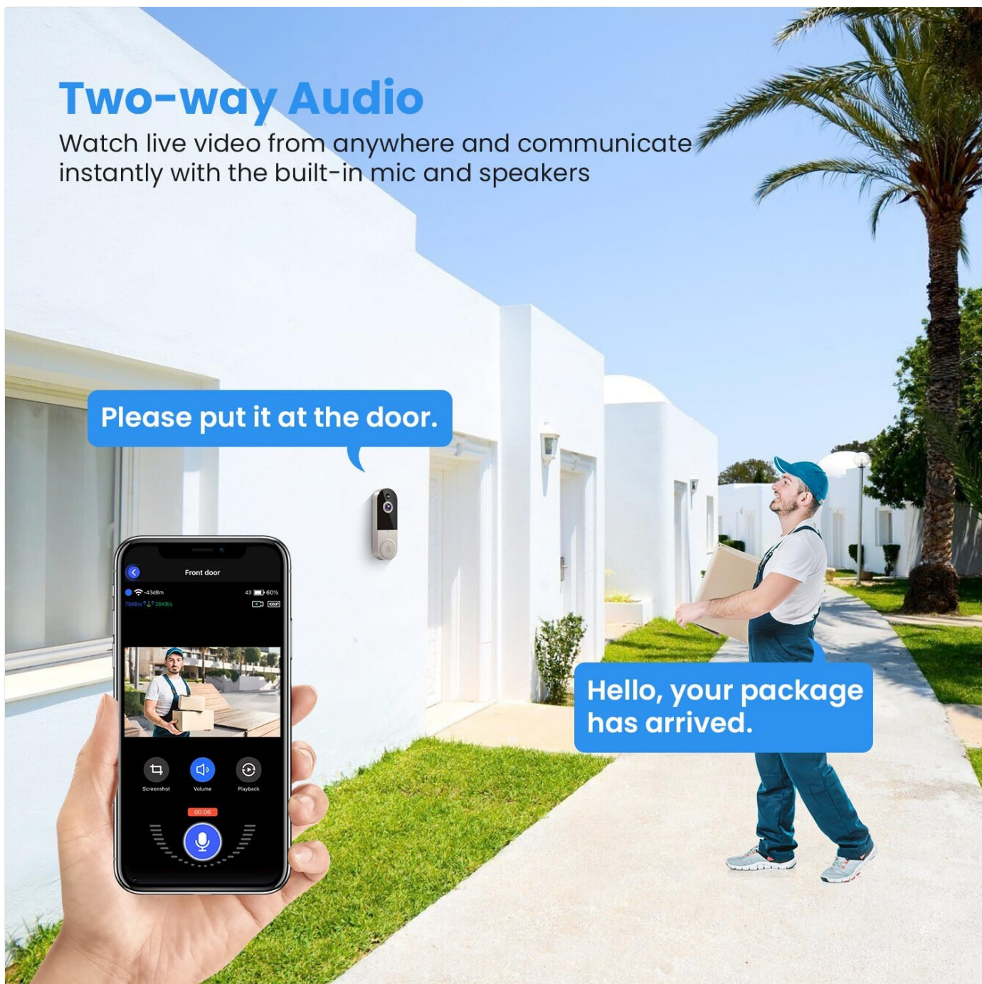
Image: A user communicating with a delivery driver via the doorbell's two-way audio feature, displayed on a smartphone.

Watch live video from anywhere and communicate instantly with the built-in mic and speakers