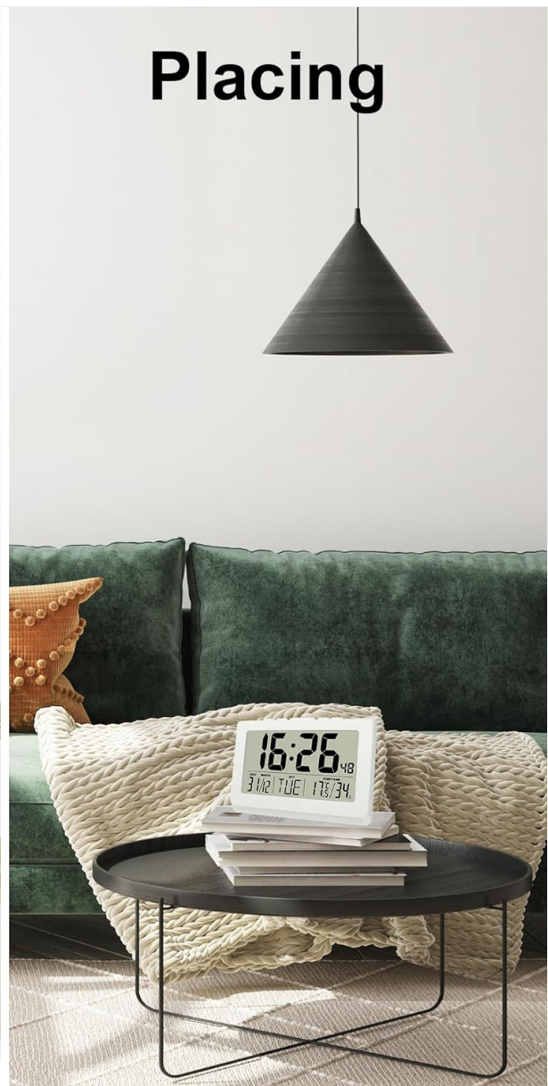
Image: Demonstrates the clock's versatility, showing it both hanging on a wall and placed on a table.