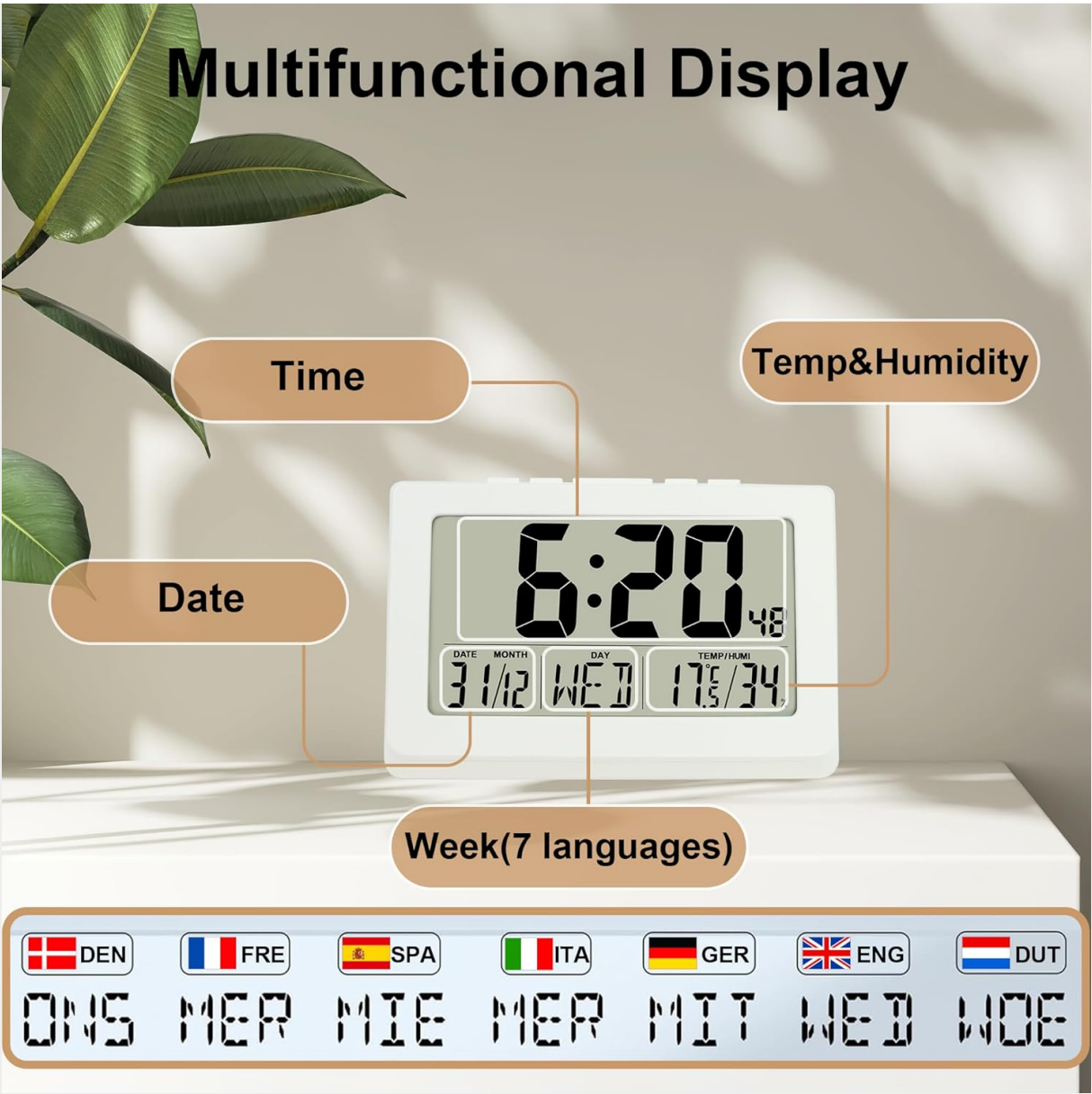
Image: A visual guide to the clock's multifunctional display, showing how time, temperature, humidity, date, and the day of the week (in multiple languages) are presented.