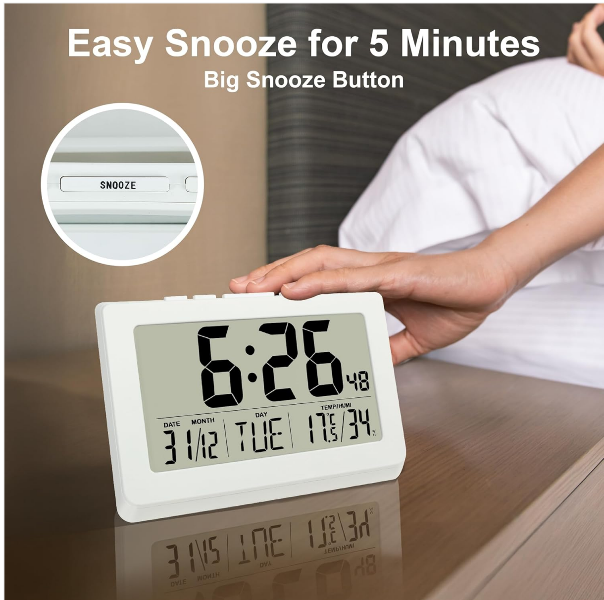
Image: A hand interacting with the large 'Snooze' button on the clock's top, illustrating the snooze function.

To stop the alarm completely, press any other button on the top of the clock (e.g., SET , ALARM , UP , or DOWN ).