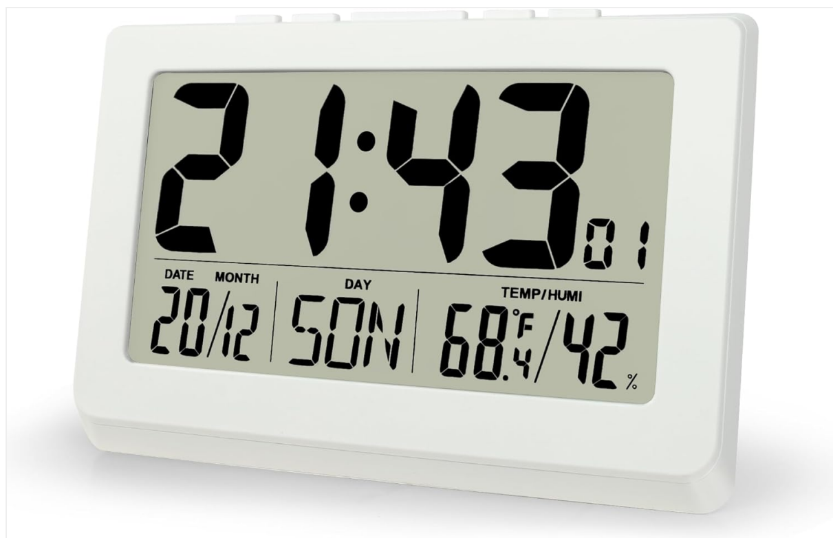
Image: Front view of the Lafocuse 10-inch LCD Digital Clock, showing its clear display with time, date, day of the week, temperature, and humidity.

This manual provides comprehensive instructions for the Lafocuse 10-inch LCD Digital Wall and Table Clock, model ZH0152B. It covers essential information regarding setup, operation, maintenance, and troubleshooting. Please read this manual thoroughly to ensure proper use and longevity of your device.