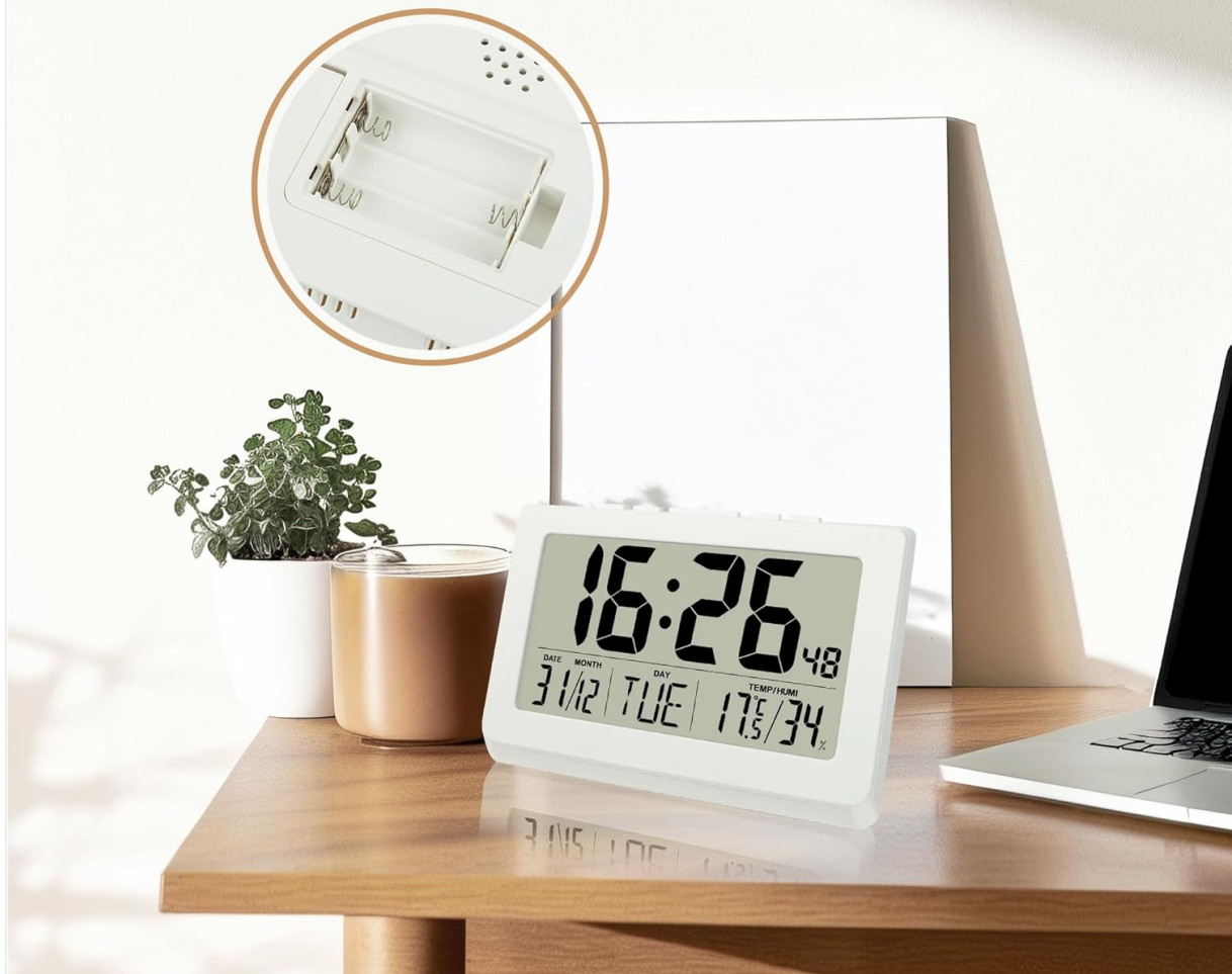
Image: Illustration of battery installation, showing the open battery compartment for 3 AAA batteries.