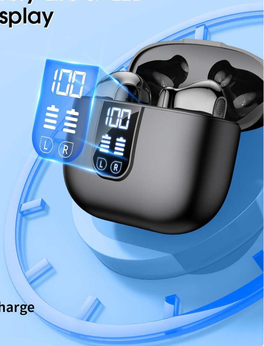
Image: The EXZHIG J11 charging case connected via USB-C, displaying battery levels for the case and individual earbuds (L/R) on its LED screen, indicating charging status and total battery life.