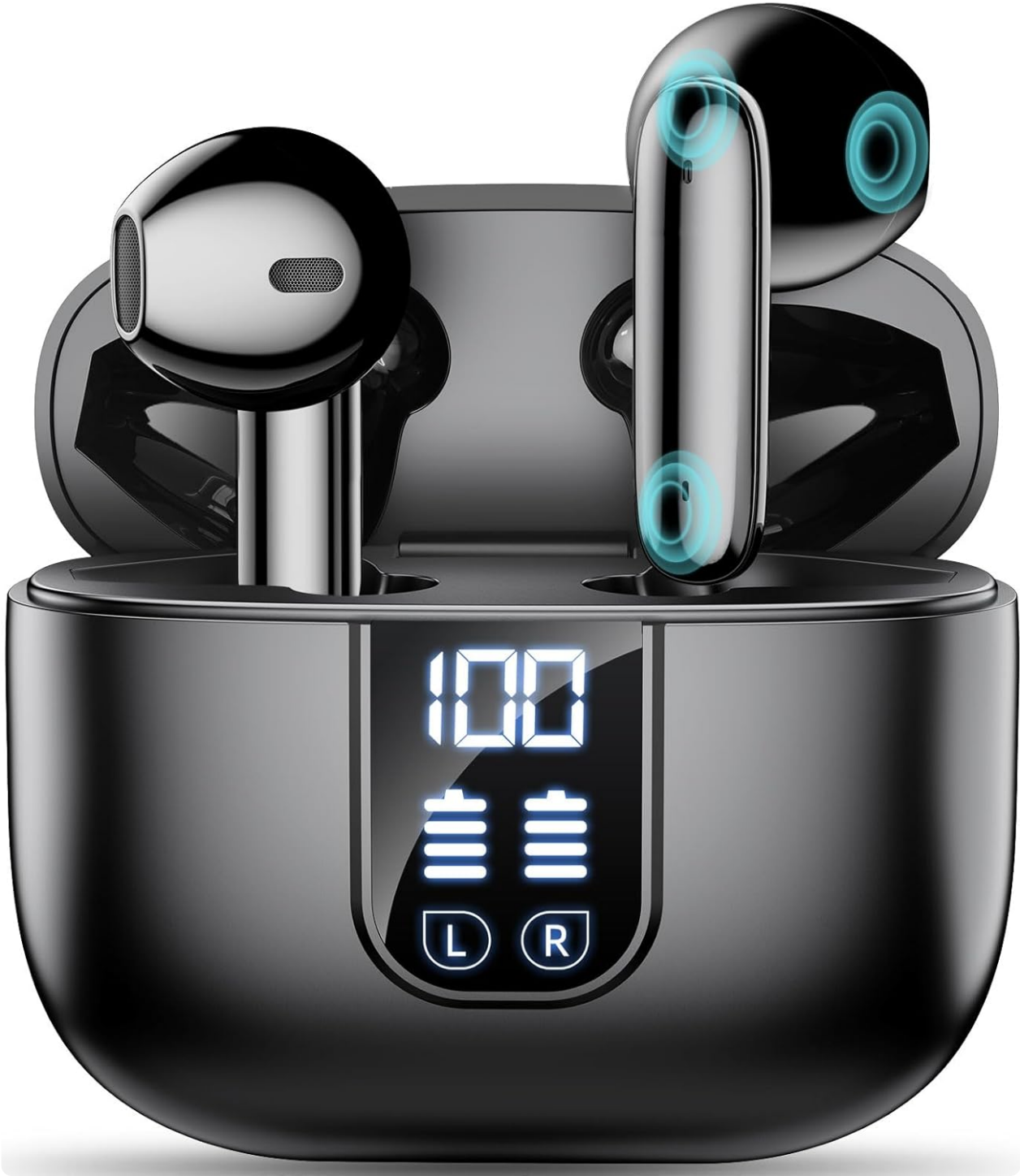
Image: The EXZHIG J11 Wireless Earbuds resting in their charging case, which features a digital LED display indicating battery percentage and individual earbud charge status.

The EXZHIG J11 Wireless Earbuds are designed for comfort and high-quality audio. The charging case features an LED display to show battery levels.