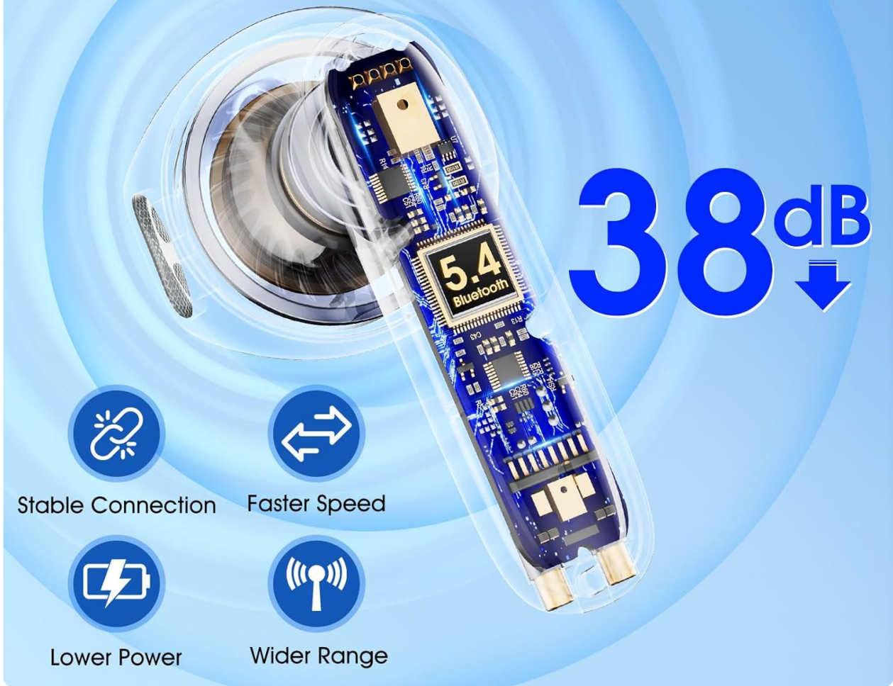
Image: Diagram illustrating the advanced Bluetooth 5.4 chip within the earbud, emphasizing stable connection, faster speed, lower power consumption, and wider range for seamless connectivity.

Provide a strong and stable connection with wide compatibility. (iOS or Android)