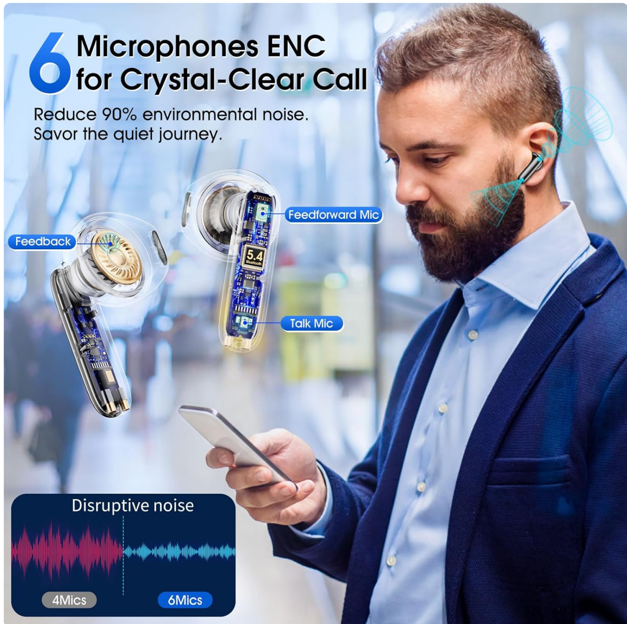
Image: Diagram illustrating the 6-microphone ENC technology in the EXZHIG J11 earbuds, showing how it reduces environmental noise by 90% for crystal-clear calls, with feedback, feedforward, and talk mics.

The earbuds feature 6 microphones and Environmental Noise Cancellation (ENC) for clear communication.