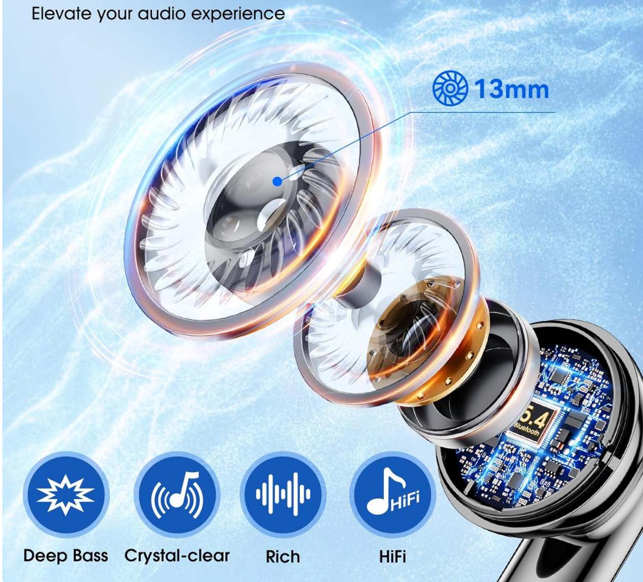
Image: Close-up diagram of the 13mm dynamic speaker within the EXZHIG J11 earbud, highlighting its components and the resulting deep bass, crystal-clear, rich, and HiFi stereo sound quality.