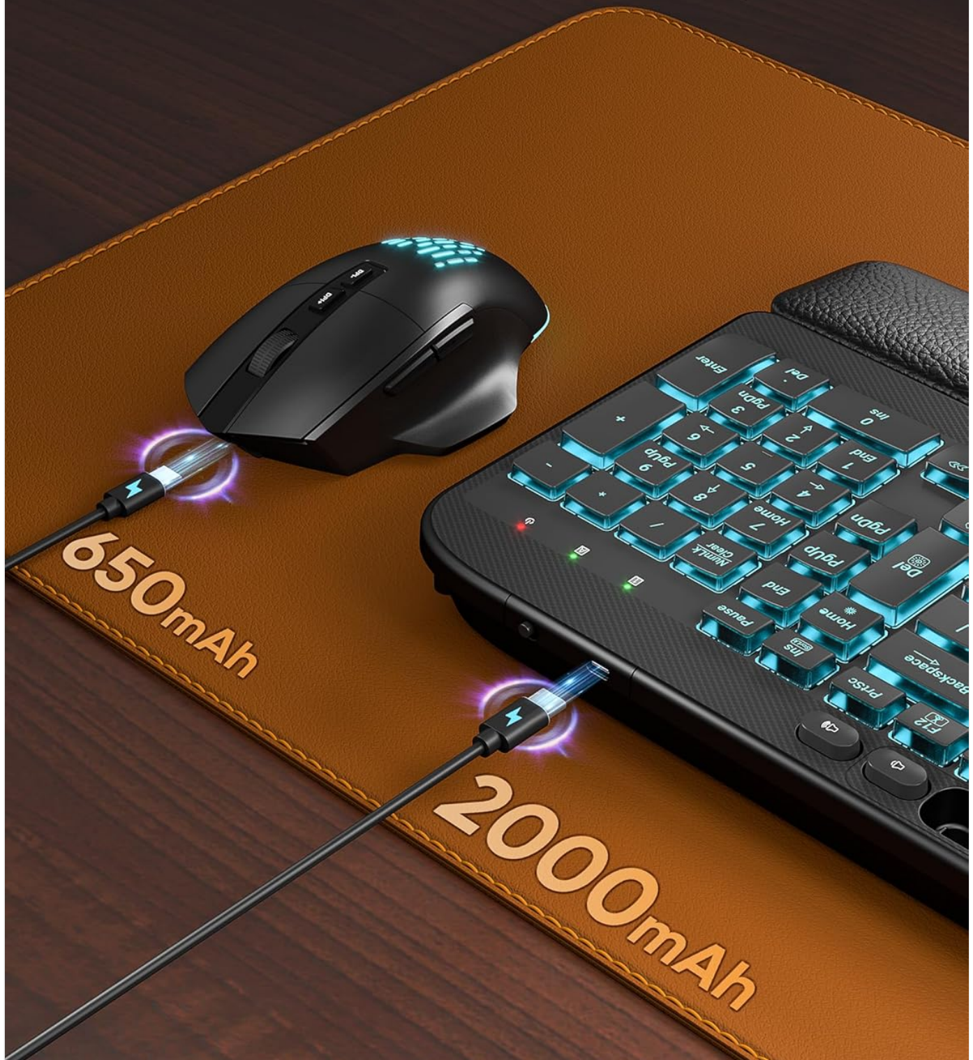
Image: The keyboard and mouse connected for USB-C charging, illustrating their respective battery capacities (2000mAh for keyboard, 650mAh for mouse) and charging indicators.