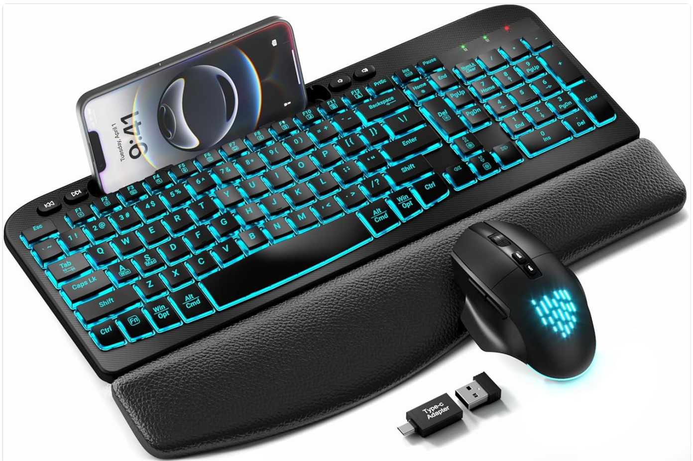
Image: The SABLUTE Wireless Keyboard and Mouse Combo, showcasing the ergonomic design, integrated phone holder, and included USB receiver and Type-C adapter.

Thank you for choosing the SABLUTE Wireless Keyboard and Mouse Combo. This full-size ergonomic set is designed to enhance your productivity and comfort across Windows and Mac systems. Featuring a wave-shaped keyboard with a soft leather wrist rest, a phone holder, and vibrant backlighting, this combo provides a seamless and efficient user experience.