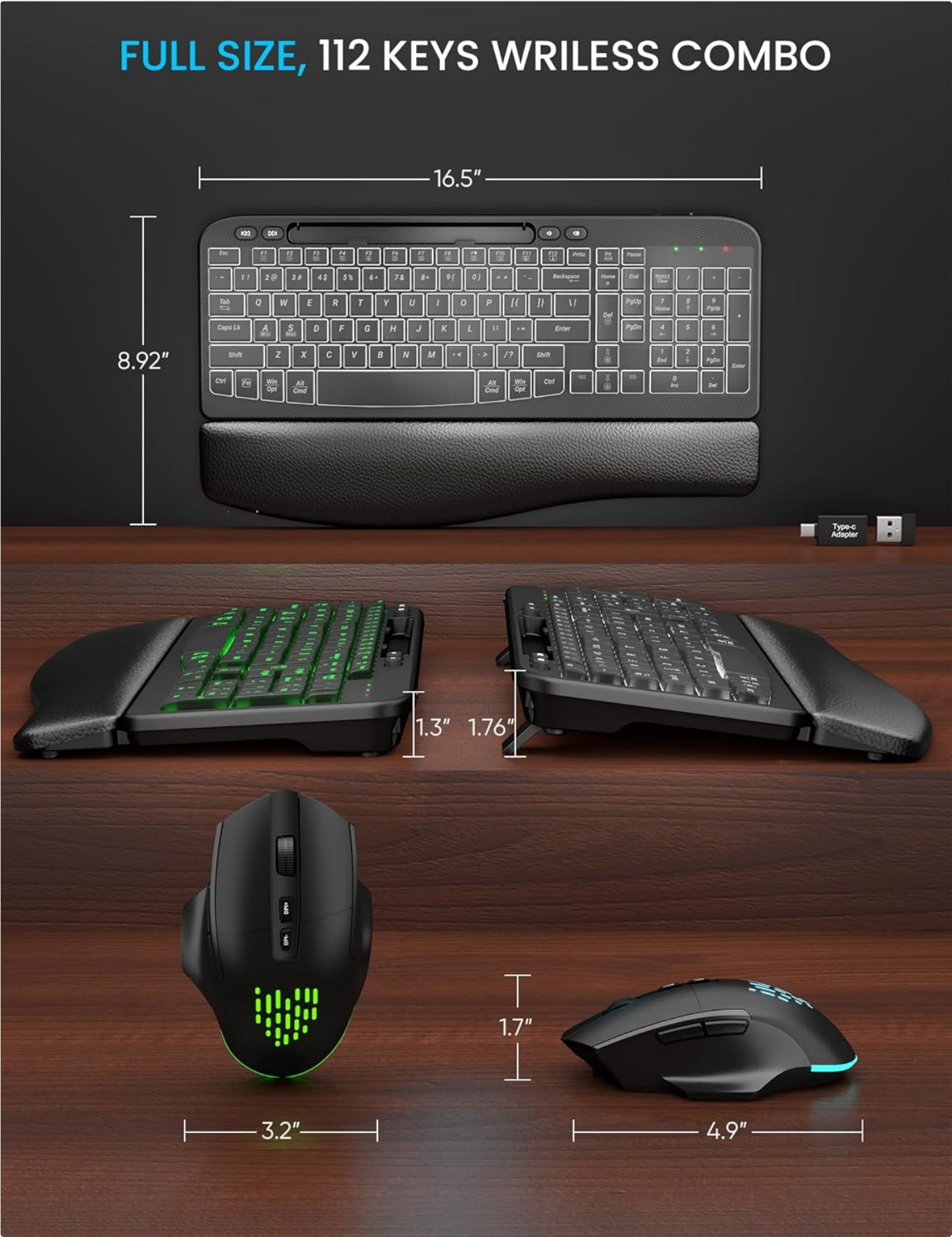
Image: Detailed dimensions of the full-size keyboard and mouse, including length, width, and height measurements.