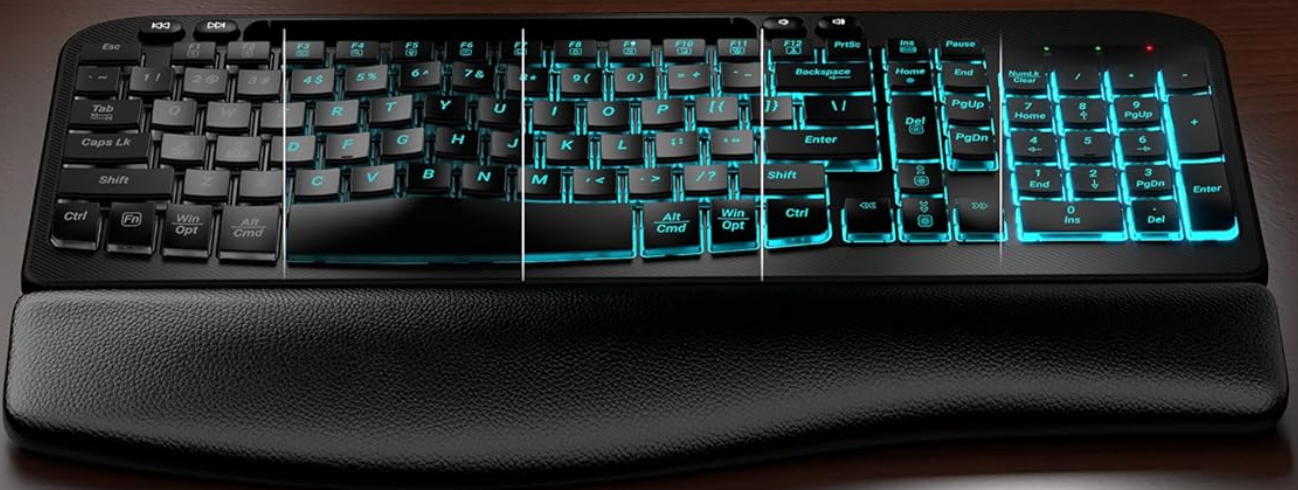
Image: Illustration of the keyboard's 7-color backlight options and controls for turning on/off, switching colors, and adjusting brightness.

Fn+↑/↓ Adjust Brightness+/- (5 Light Levels)