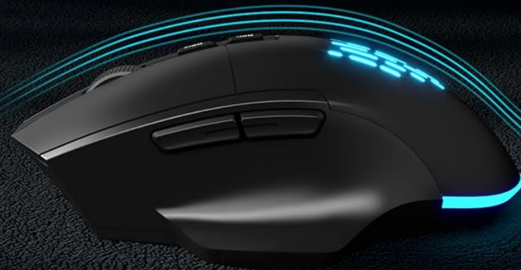
Image: The RGB backlit mouse, detailing its 7 backlight effects, adjustable DPI settings (800, 1200, 1600, 2000), and ergonomic palm grip.