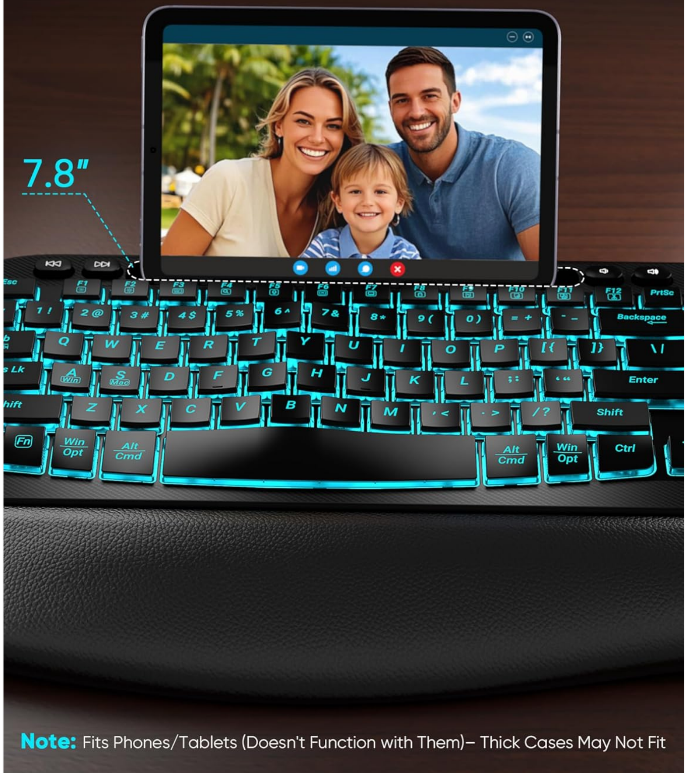
Image: The keyboard's integrated phone/tablet holder, demonstrating a tablet securely placed in the 7.8-inch slot.