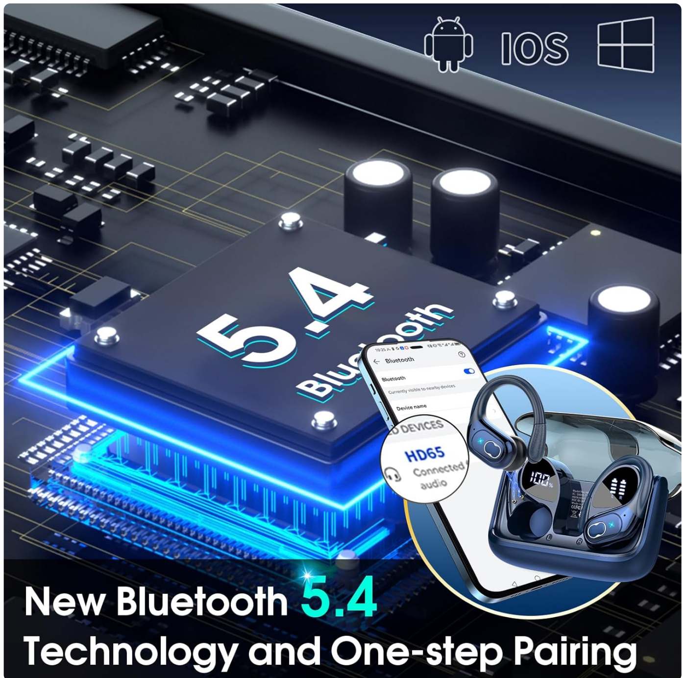
Image: Visual representation of Bluetooth 5.4 technology and the one-step pairing process with a mobile device.