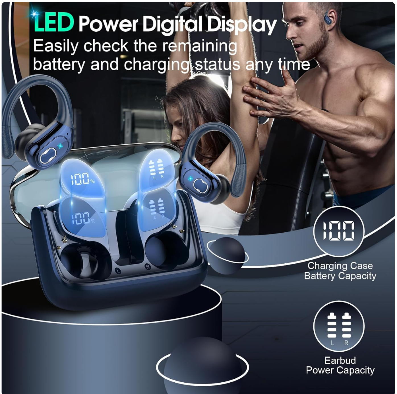
Image: The charging case displaying the battery percentage of the case and the power capacity of the left and right earbuds.