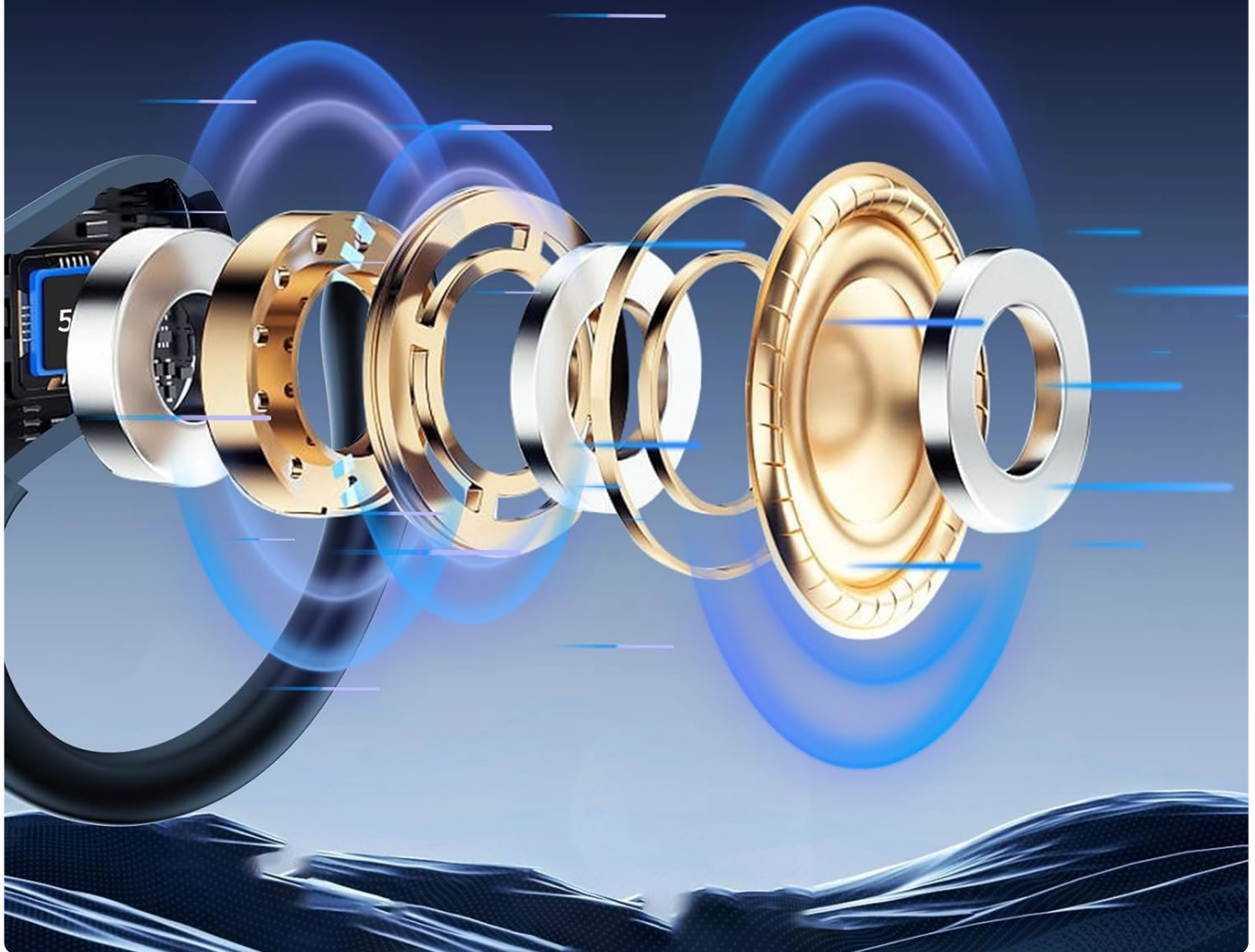
Image: Exploded view of the 14.2mm dynamic speaker driver, illustrating its components for high-fidelity audio reproduction.