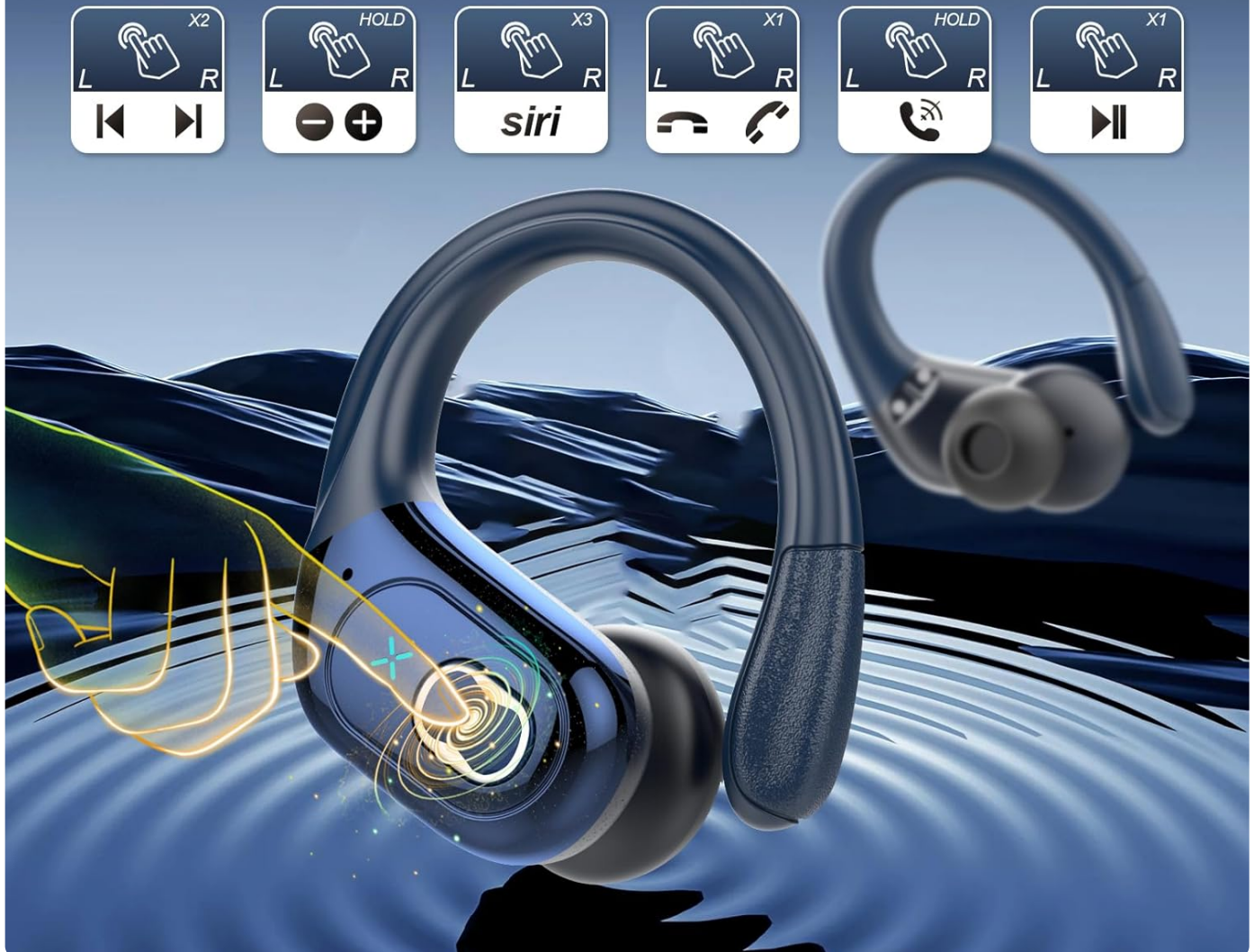
Image: Illustration of the earbud's physical button controls and their corresponding functions for music, calls, and voice assistant.

Music incoming calls can be controlled at any time