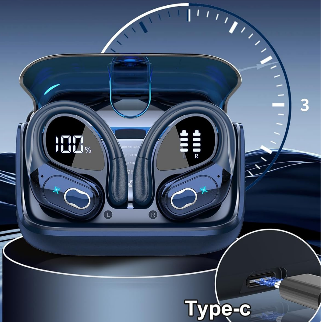
Image: The earbuds in their charging case, highlighting the battery life features and the USB-C charging port.