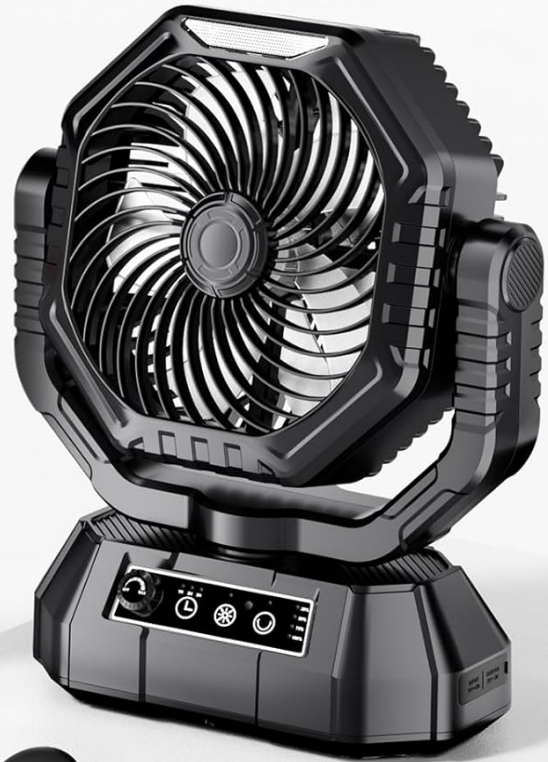
Image: Contents of the HAWANA Portable Fan package, including the fan, remote, charging cable, and manual.