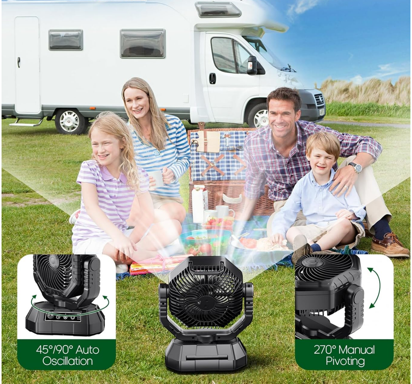
Image: The fan's wide-angle oscillation and manual pivot features, ensuring broad airflow coverage for multiple users.