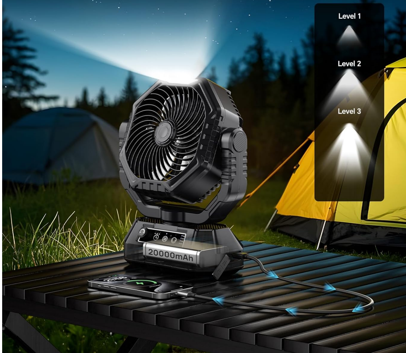
Image: The fan's integrated LED light providing illumination in a dark environment, with an illustration of its three brightness levels.

20000mah battery power & 3 levels brightness