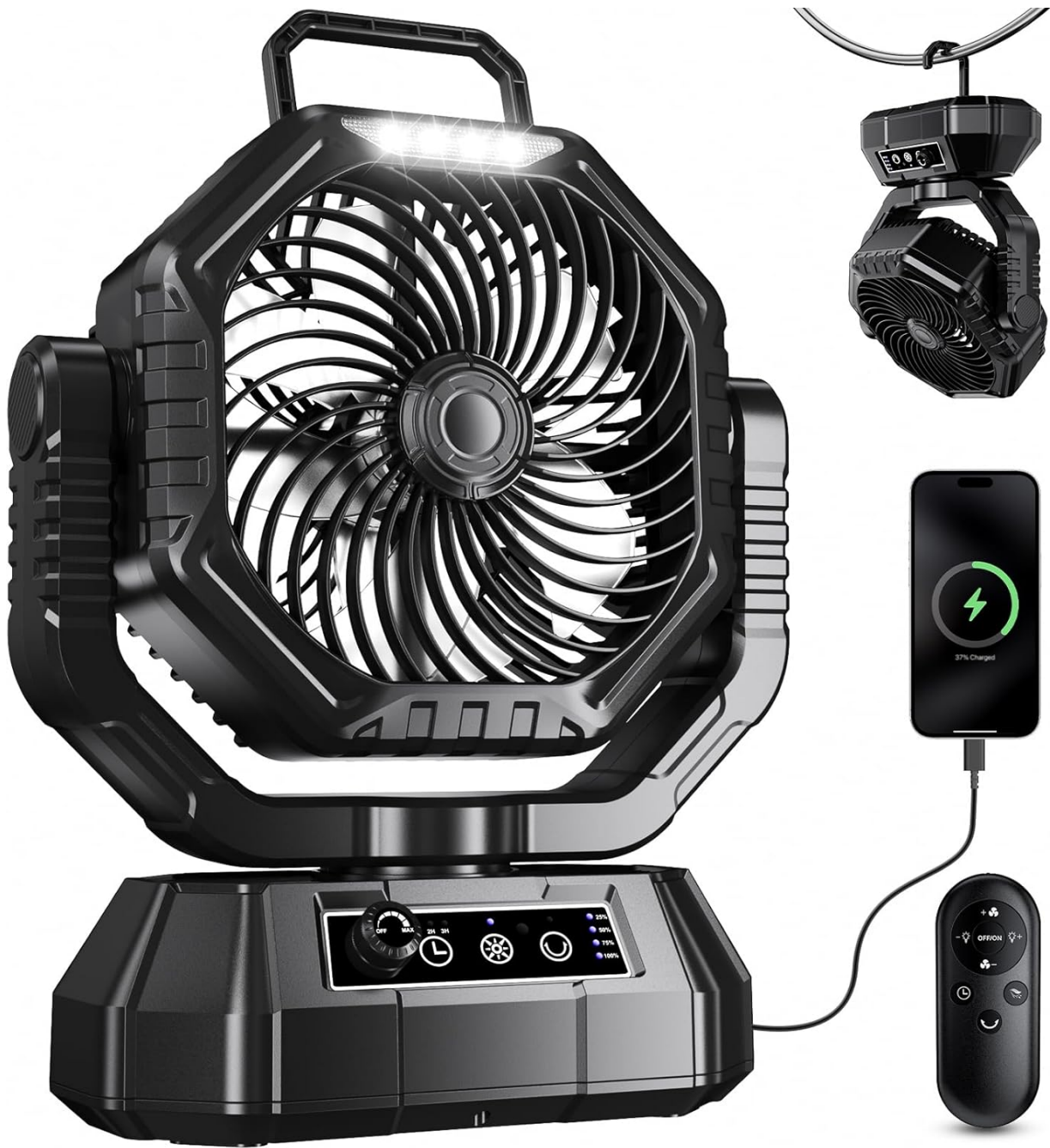
Image: The HAWANA Portable Fan showcasing its versatile design, usable as a freestanding unit or hung from its integrated hook, alongside its remote control and power bank function.