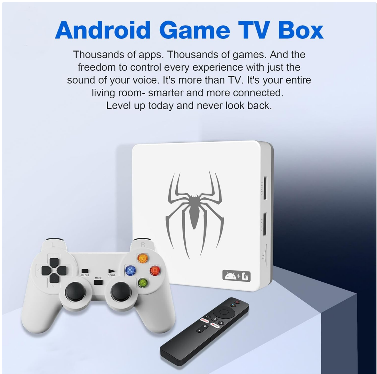
Figure 5.1: The G7 Game Box displaying the Android TV interface, with a wireless gamepad and remote control.

Use the included remote control or a connected gamepad to navigate the Android TV interface. The directional pad (D-pad) on the remote/gamepad allows you to move between icons, and the "OK" or "A" button confirms selections. The "Back" button returns to the previous screen.