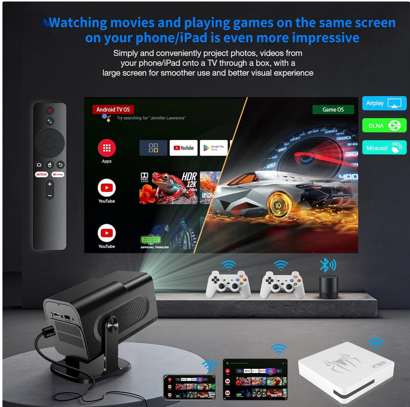
Figure 5.2: The G7 Game Box demonstrating screen mirroring capabilities from a phone/iPad to a TV, alongside media playback and gaming options.

Beyond gaming, the G7 Game Box functions as an Android TV device, allowing you to stream movies, TV shows, and music through various applications. It also supports screen mirroring technologies like Airplay, DLNA, and Miracast, enabling you to project content from your phone or tablet to your TV.