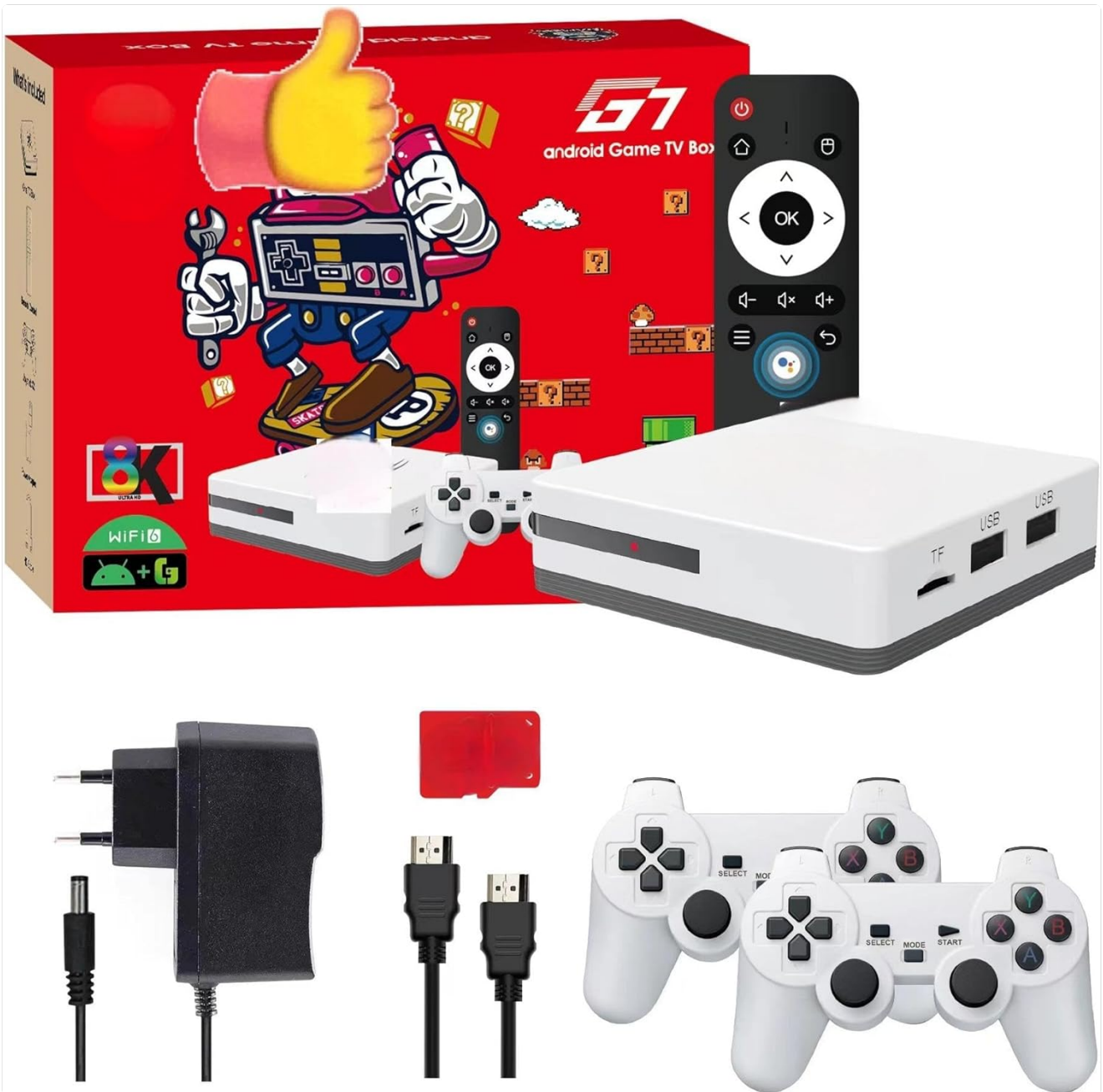
Figure 2.1: The ZWXYVUT G7 Game Box console, two wireless gamepads, power adapter, HDMI cable, and Micro USB charging cable.