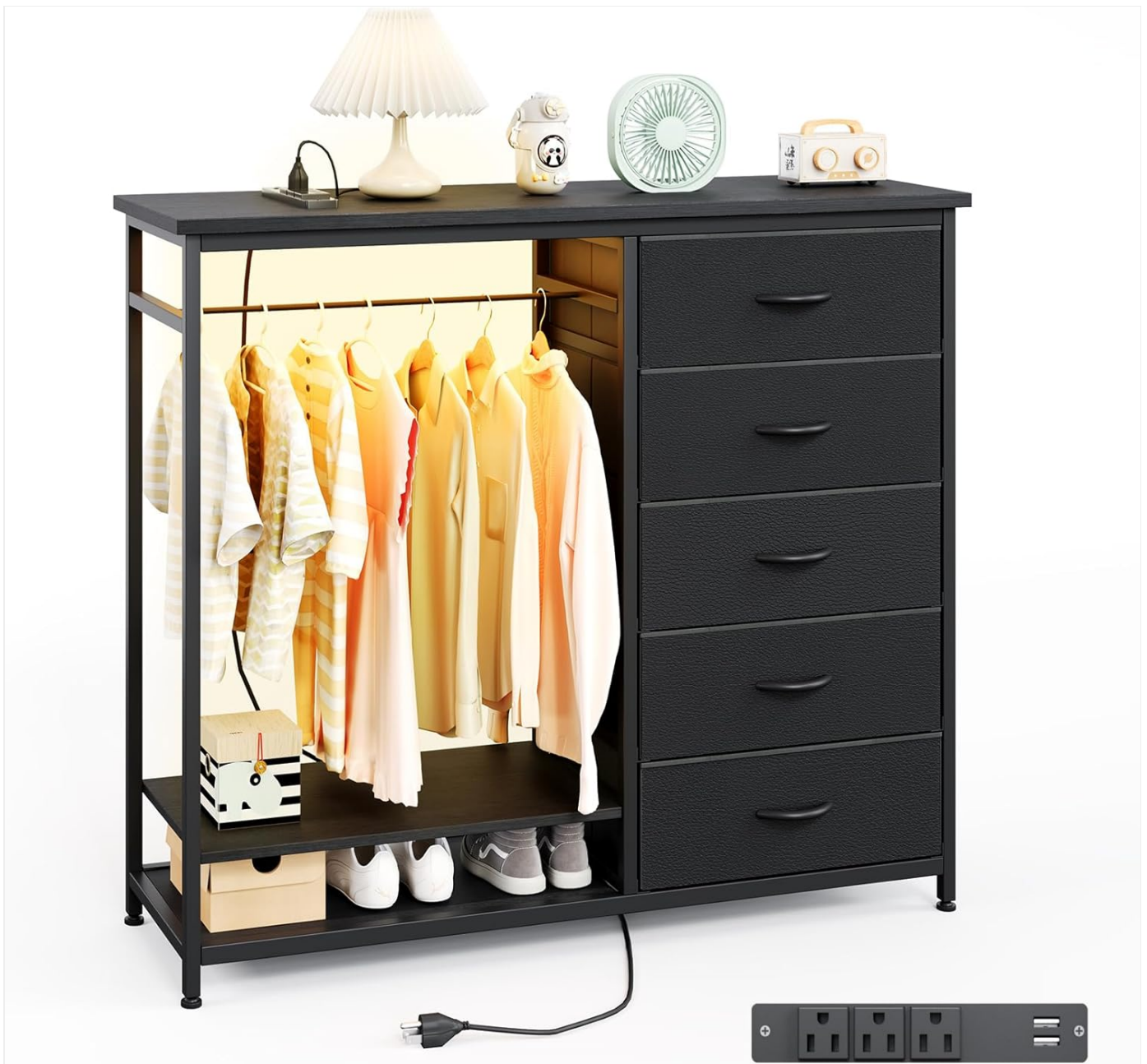
Image 1.1: Fully assembled VERMESS 5CYMJ-BK dresser in a bedroom setting.