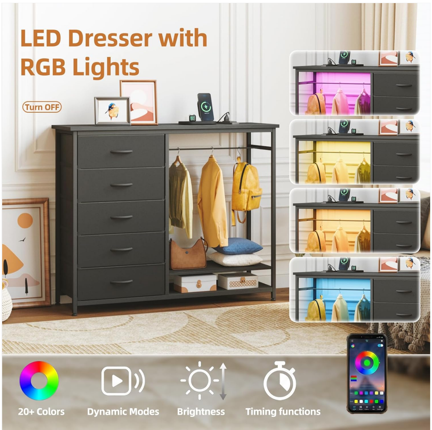
Image 5.2: LED lights in operation, demonstrating color and mode options.