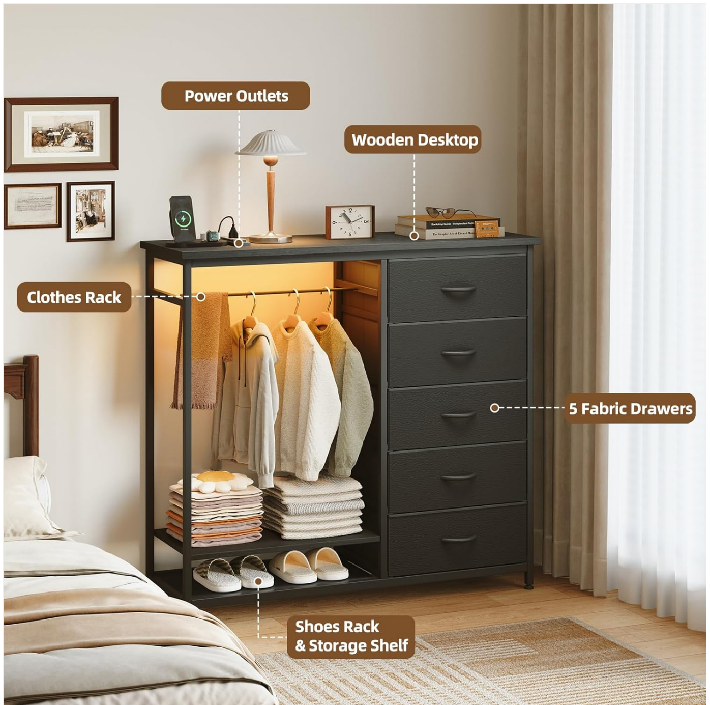
Image 4.2: Overview of the assembled dresser with key features highlighted.