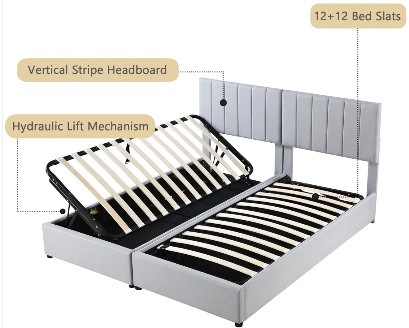
Figure 1: Exploded view showing the main components of the King Size Upholstered Platform Bed, including the vertical stripe headboard, hydraulic lift mechanism, and bed slats.