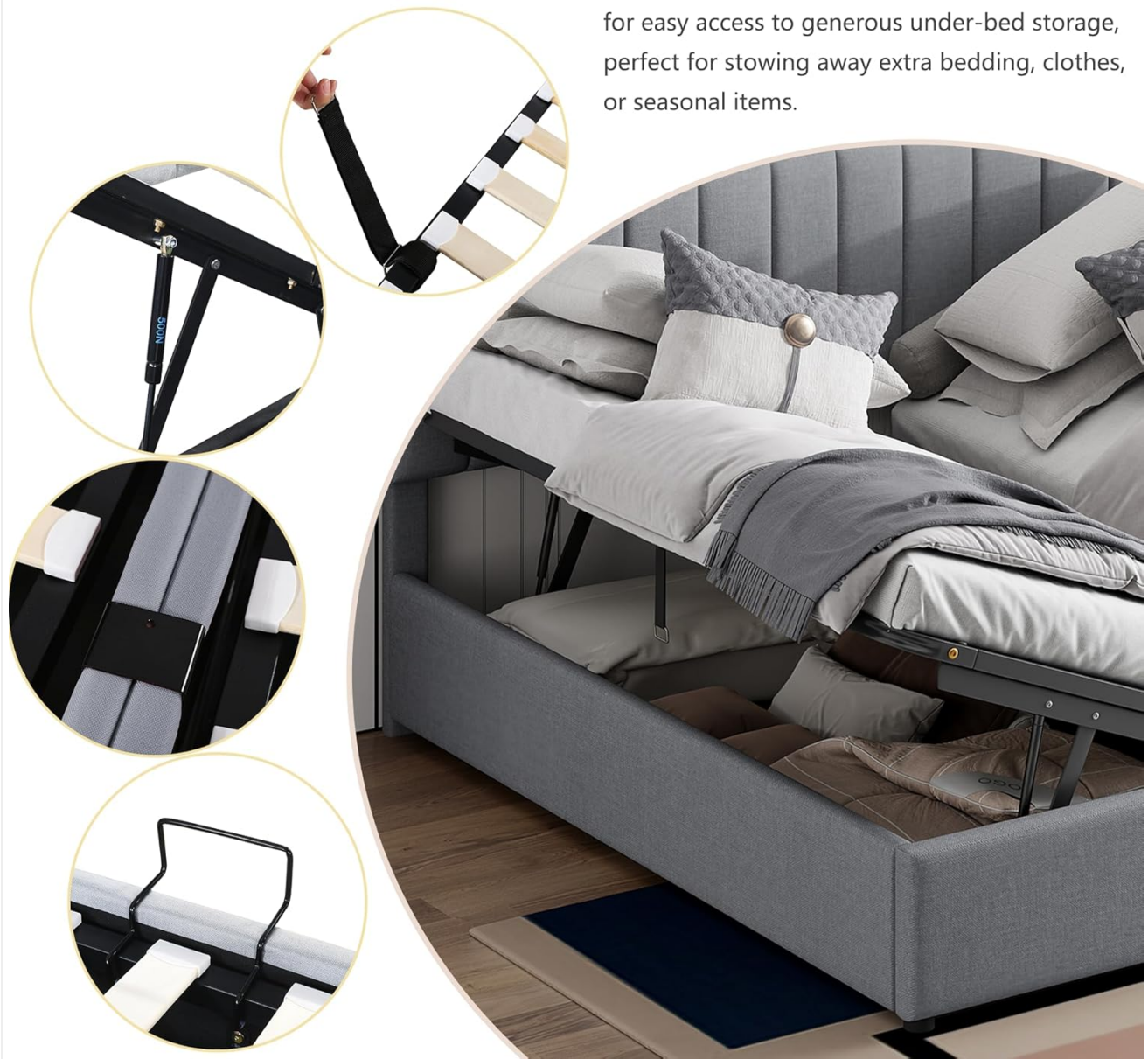
Figure 3: The innovative hydraulic lift system provides easy access to generous under-bed storage, ideal for stowing bedding, clothes, or seasonal items.

The innovative hydraulic lift system allows for easy access to generous under-bed storage, perfect for stowing away extra bedding, clothes, or seasonal items.