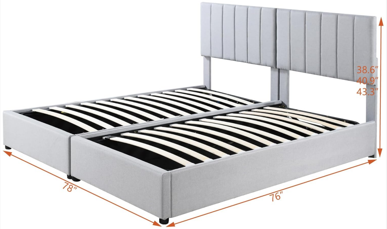
Figure 5: Overall product dimensions for the King Size bed.