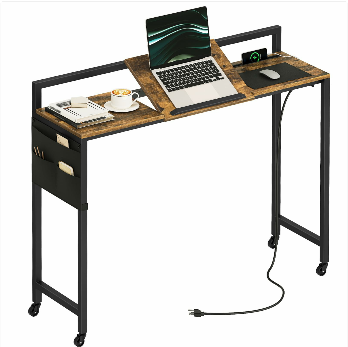
Image 1.1: The YATINEY SF03UBR Overbed Table in a living room setting, showcasing its design and functionality.