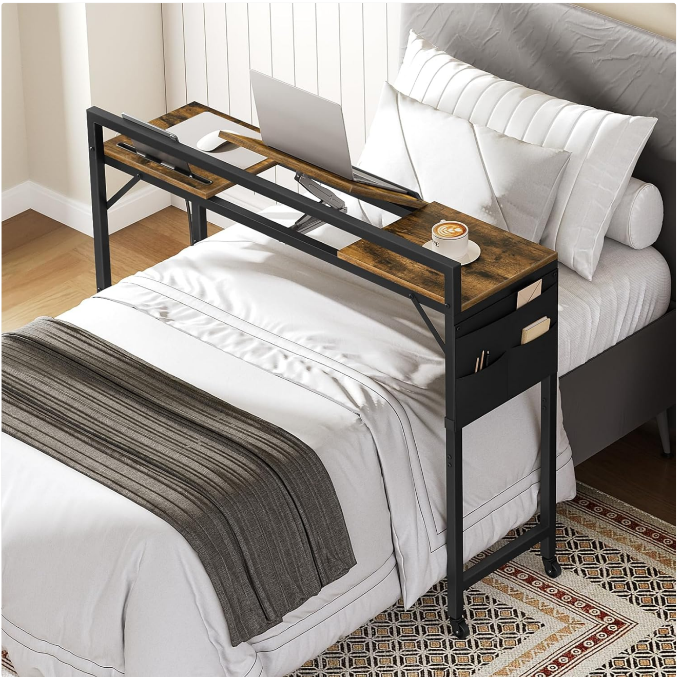
Image 5.3: The 360-degree smooth-rolling wheels allow for effortless repositioning, with two lockable wheels for stability.