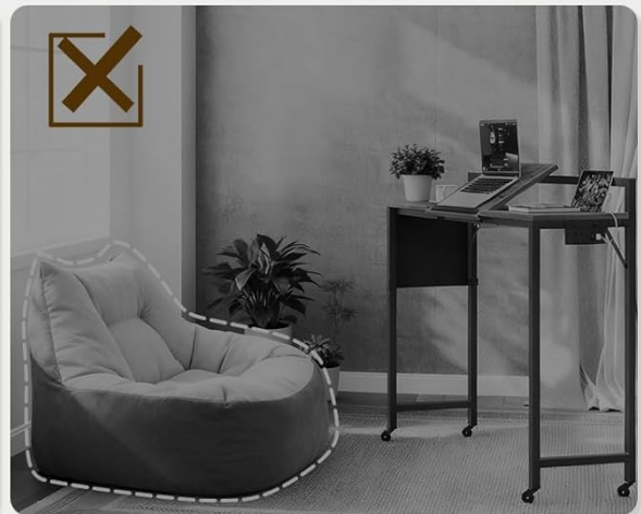
Image 4.1: Product dimensions: 43.3" (length) × 12.6" (width) × 35.4" (height). The adjustable panel measures 15.7" and tilts from 0-60 degrees.