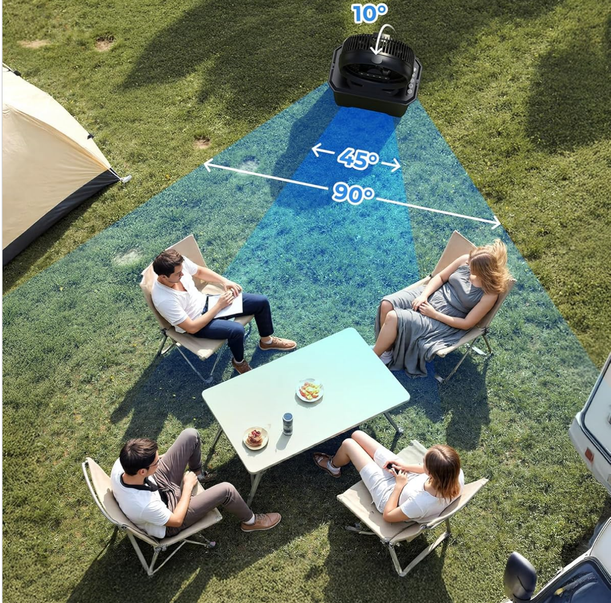
Image: An aerial view showing the fan's adjustable oscillation angles (45° and 90°) and 10° manual tilt feature, covering a wide area.