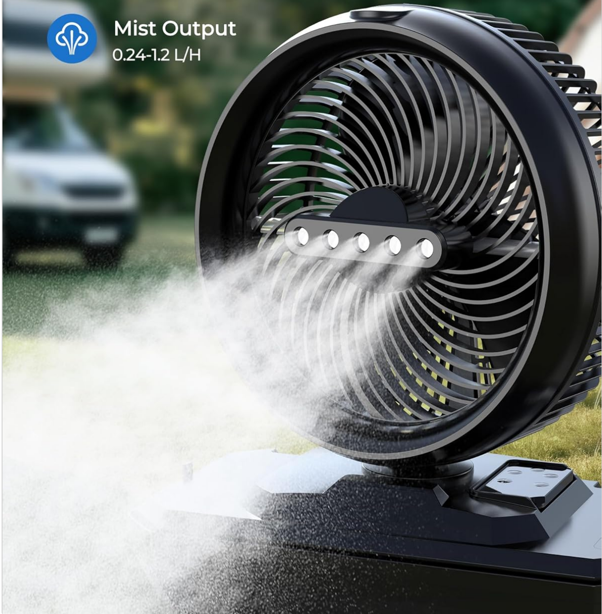
Image: The fan operating with all five misting nozzles active, producing a visible spray.