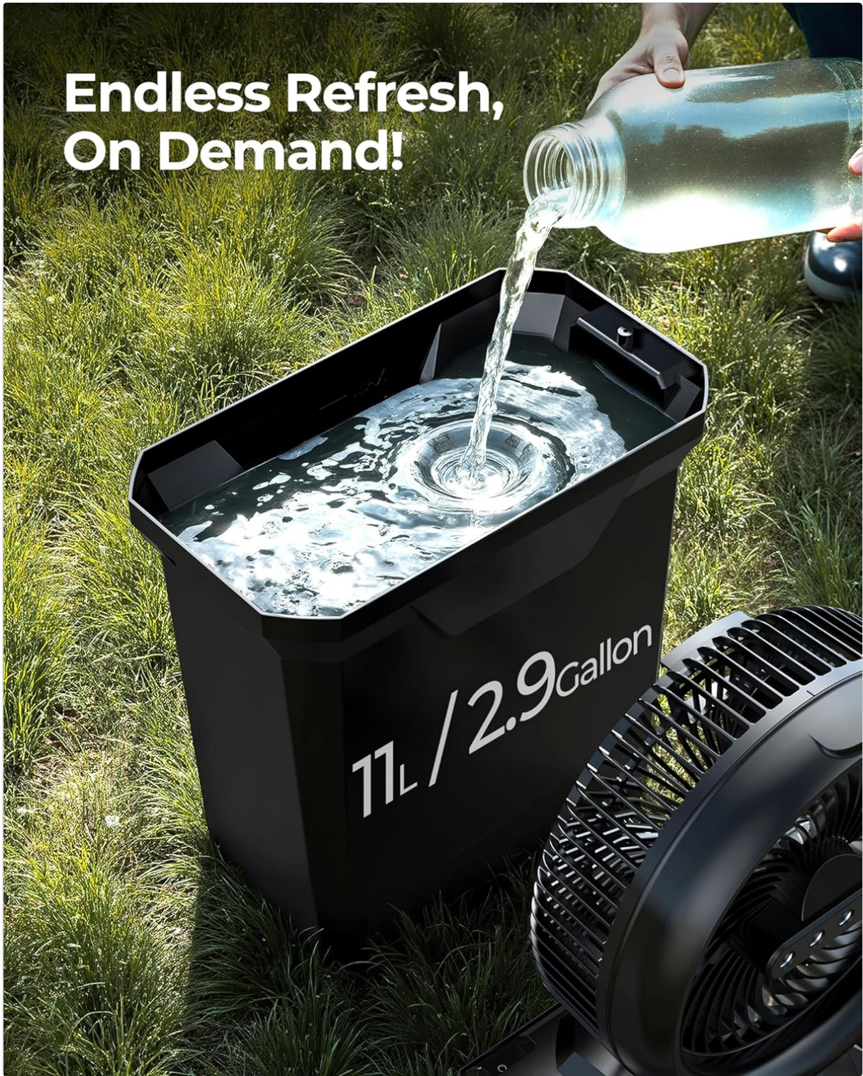
Image: A person pouring water into the 11L water tank of the misting fan.