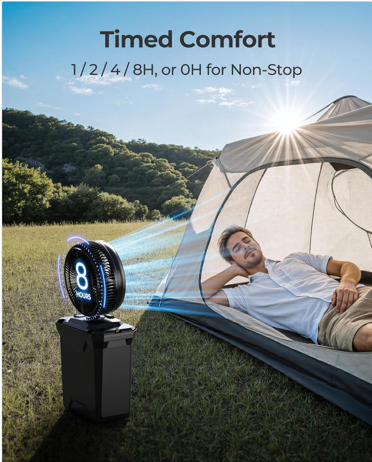
Image: The fan displaying battery percentage and indicating long work times on a full charge.