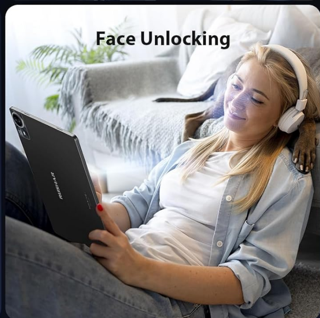
Image: Visuals demonstrating the tablet's 4 speakers, 3.5mm headset interface, 4-mode satellite positioning (GPS), dual mics with AI noise cancellation, and Face Unlocking feature.