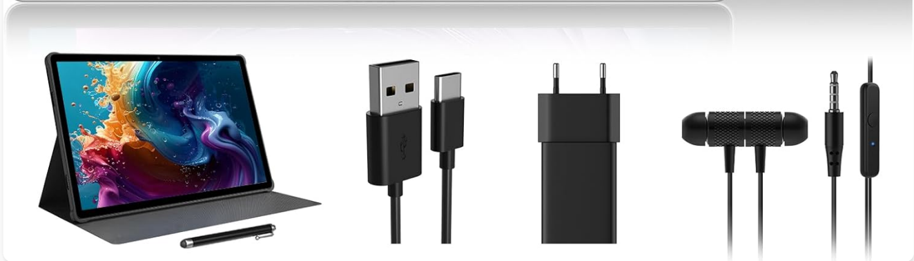
Image: The RUSHAR A140 tablet displayed with its various accessories, including a protective case, stylus, charger, USB cables, and headphones.