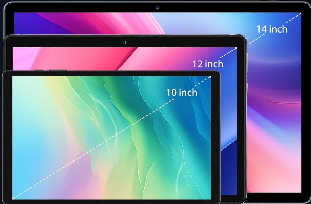
Image: A visual representation highlighting the 14-inch 2.5K HD display with 2240x1400 resolution and a 93% screen-to-body ratio.