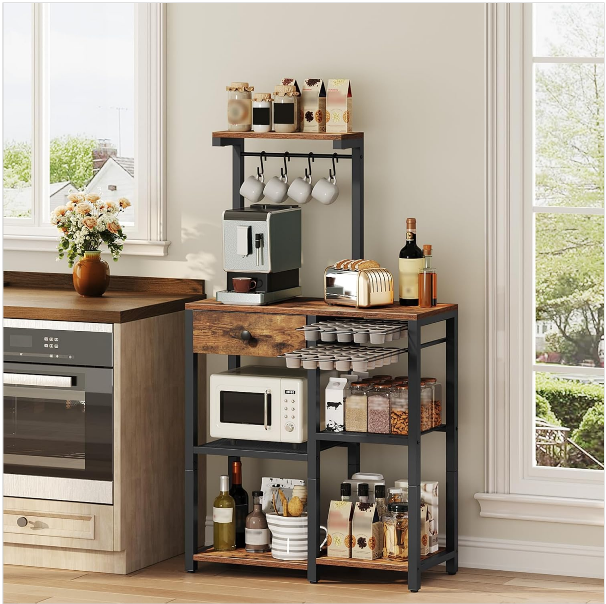
Image: The coffee bar station integrated into a kitchen, showcasing its functional design.