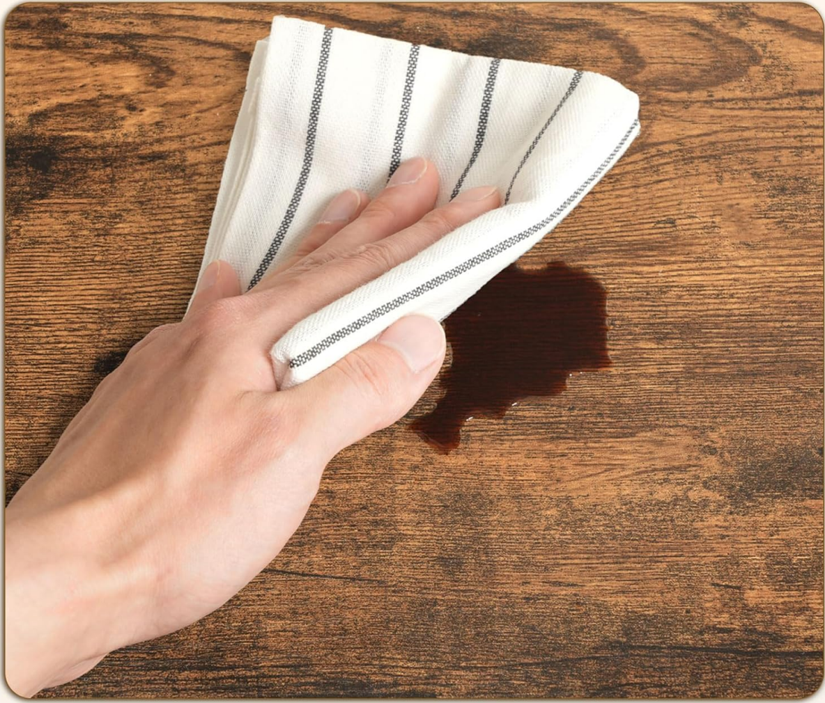
Image: Cleaning the large appliance surface.

Provides ample room for wide kitchen items.