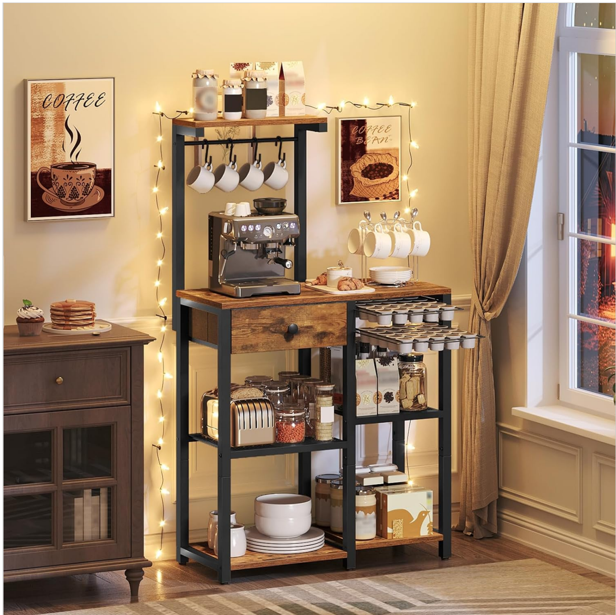
Image: The YATINEY 5-Tier Coffee Bar Station, fully assembled and organized with coffee-making equipment and other kitchen items.