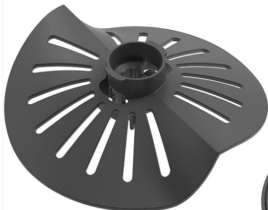
TOKIT Blade Cover