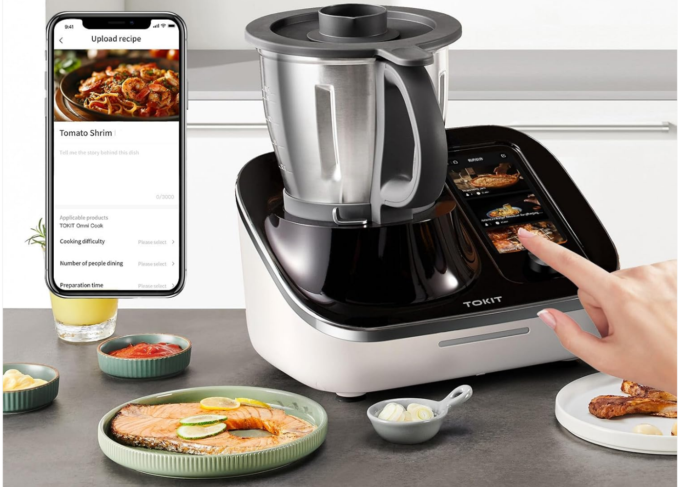
The TOKIT Omni Cook C2 alongside a smartphone displaying the interface for uploading and managing custom recipes, enabling users to personalize their culinary creations.

With TOKIT Omni Cook, you can easily create, import, and modify your culinary masterpieces. Enjoy a personalized cooking experience tailored to your taste.