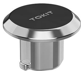
TOKIT Slow Cook Plug