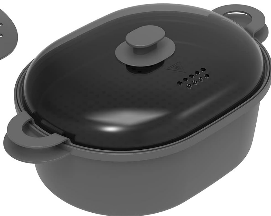
TOKIT Steamer Set

Key accessories for the TOKIT Omni Cook C2, including the blade cover, steamer set, and slow cook plug, designed to expand the machine's cooking capabilities.