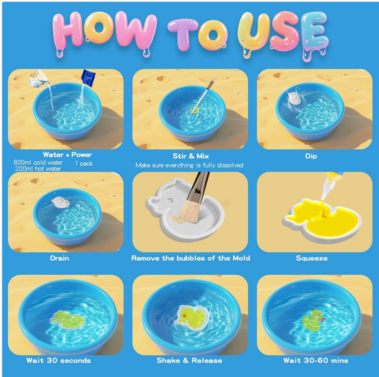
Image: A visual guide demonstrating the process of mixing the solution, preparing the molds, and filling them with colored gels.

Your browser does not support the video tag.