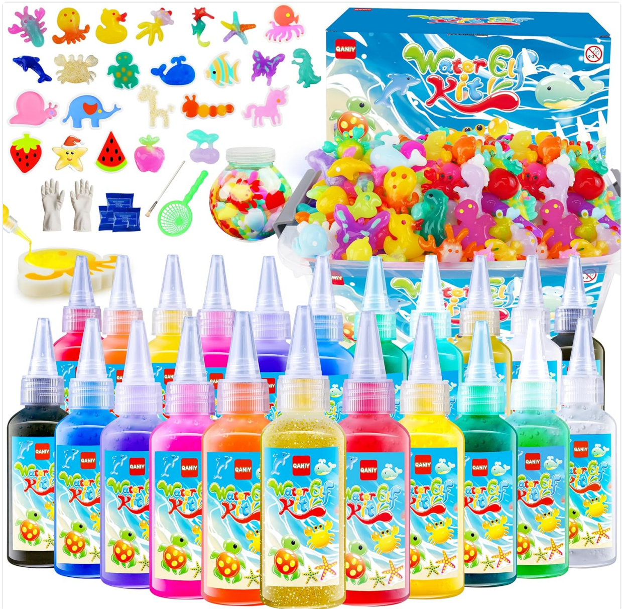
Image: A vibrant assortment of finished Magic Water Elves, showcasing different colors and shapes, ready for play.

Your browser does not support the video tag.