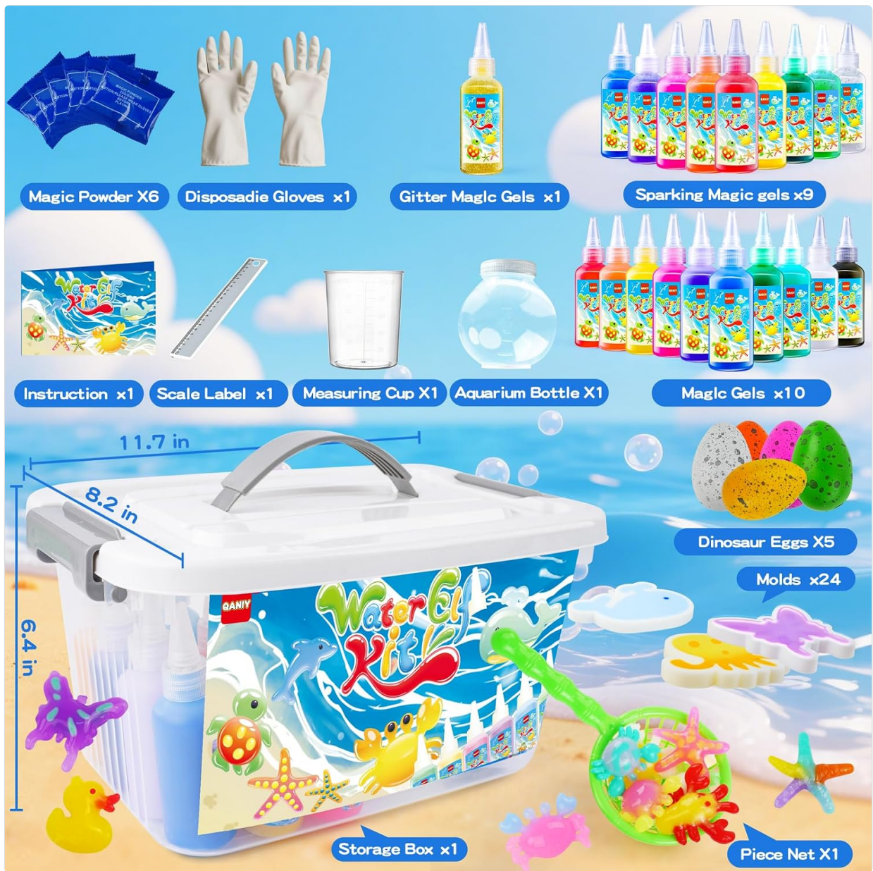
Image: All components of the QANIY Magic Water Elf Toy Kit, including gels, molds, powders, and accessories, organized within the clear storage box.