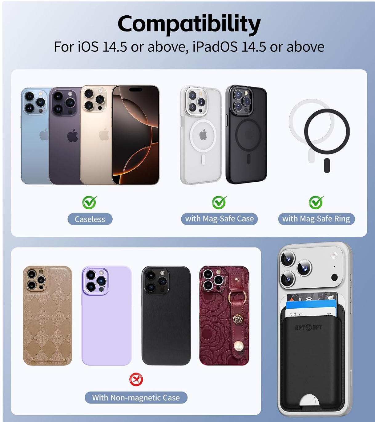
Image: Compatibility guide for iPhone models and case types.