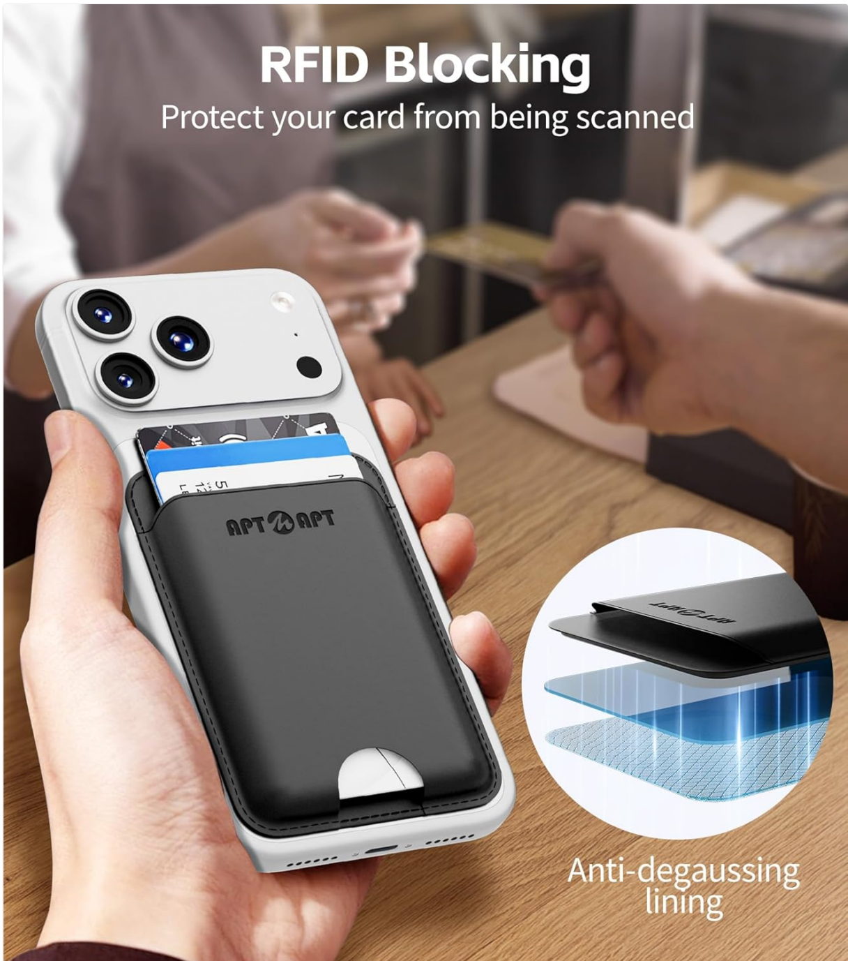
Image: Cross-section view highlighting the anti-degaussing lining for RFID protection.