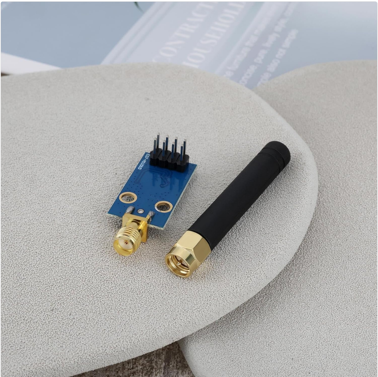
Image 4.1: Bottom view of the CC1101 module, illustrating the 8-pin header for connection to a microcontroller. Pin labels are typically printed on the PCB.

Common pin assignments (refer to module's specific markings for confirmation):