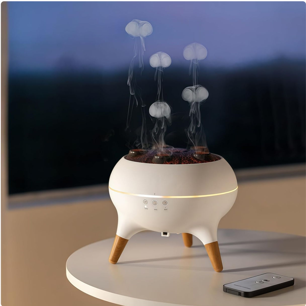
Image 1.1: The SUPNOVA Dynamic Jellyfish Air Humidifier and Essential Oil Diffuser in operation, showcasing its distinctive jellyfish-shaped mist and ambient lighting.