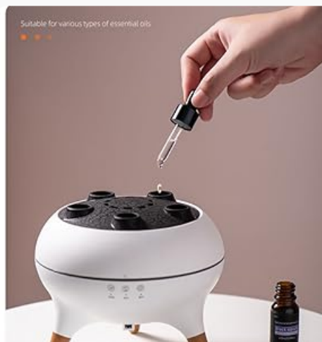
Image 5.2: Illustration of adding essential oil to the water tank.