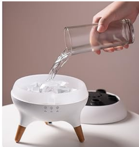
Image 5.1: Illustration of filling the water tank with clean water.