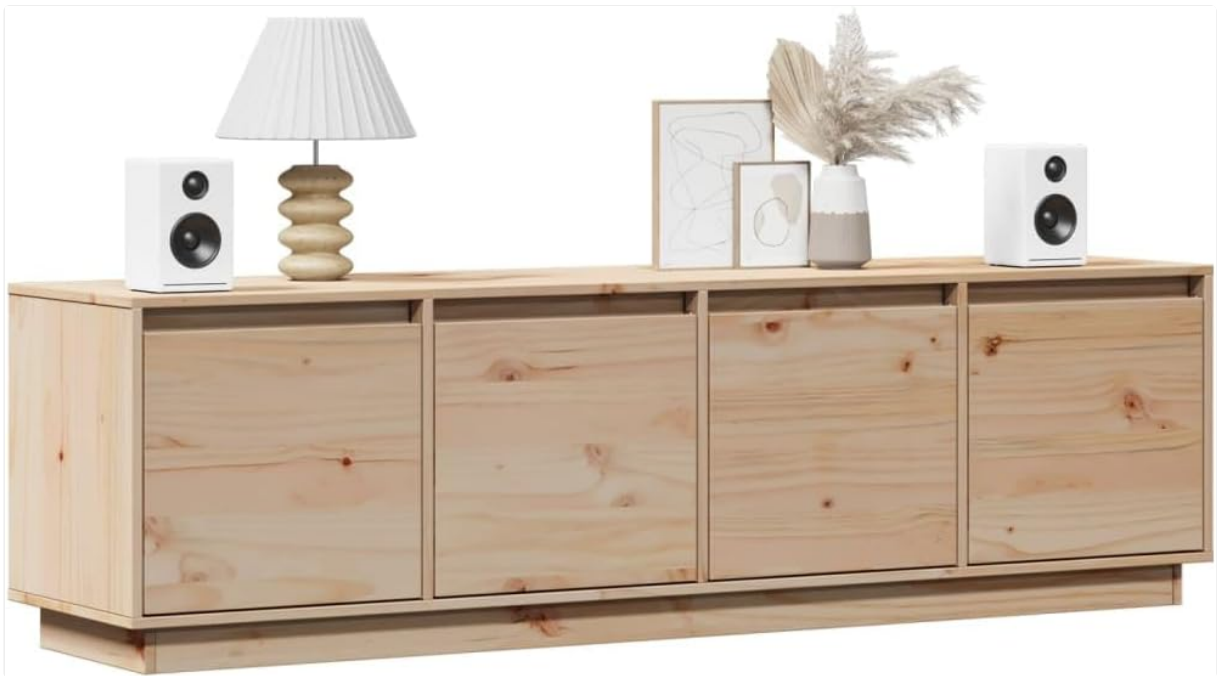
Image 4.1: The top surface of the TV cabinet, demonstrating its capacity to hold decorative items and small electronic devices.