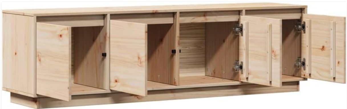
Image 3.1: The TV cabinet with its four doors open, illustrating the internal storage capacity and construction.