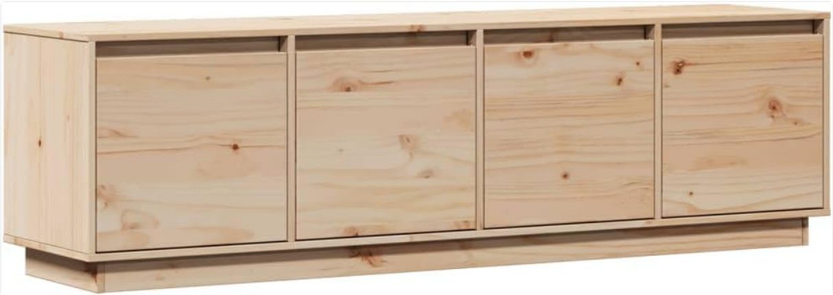
Image 7.1: Front view of the TV cabinet, highlighting its dimensions and design.