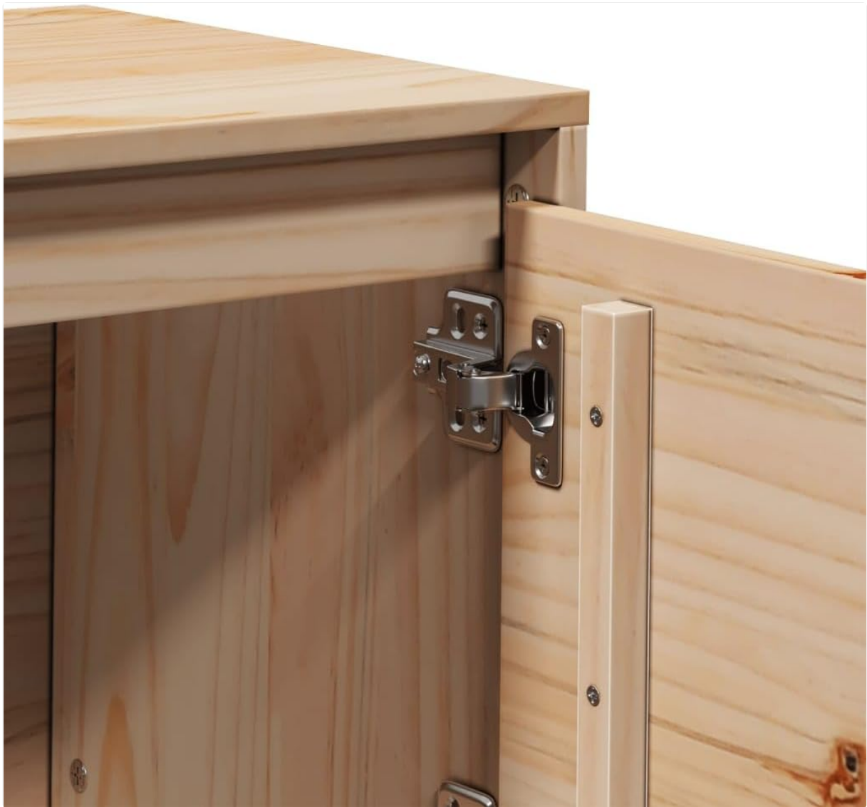
Image 3.3: A detailed view of the door hinge mechanism, crucial for proper door function and alignment.