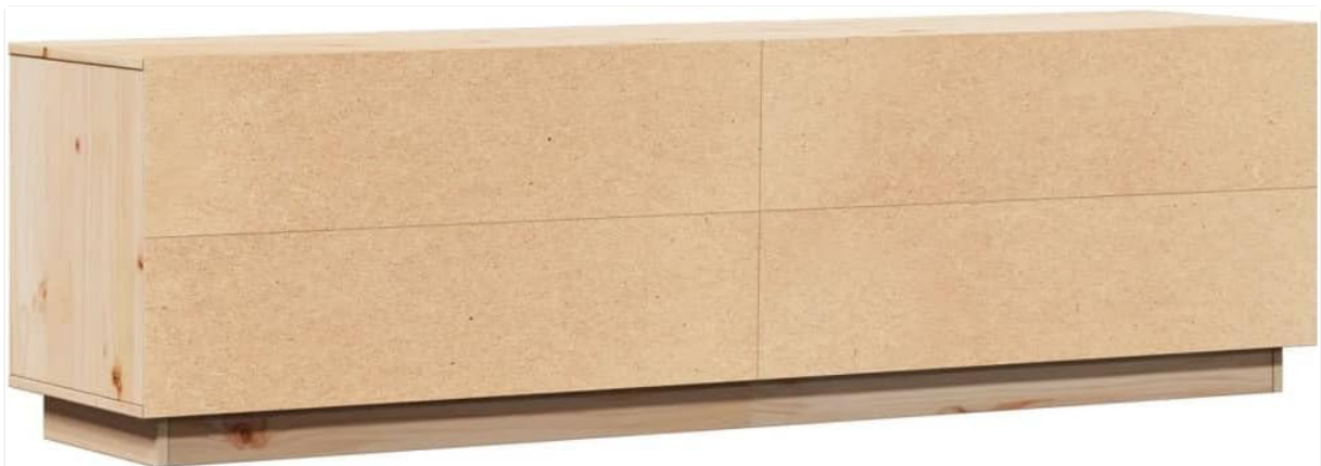
Image 3.2: The rear view of the TV cabinet, showing the MDF back panel which provides structural integrity.