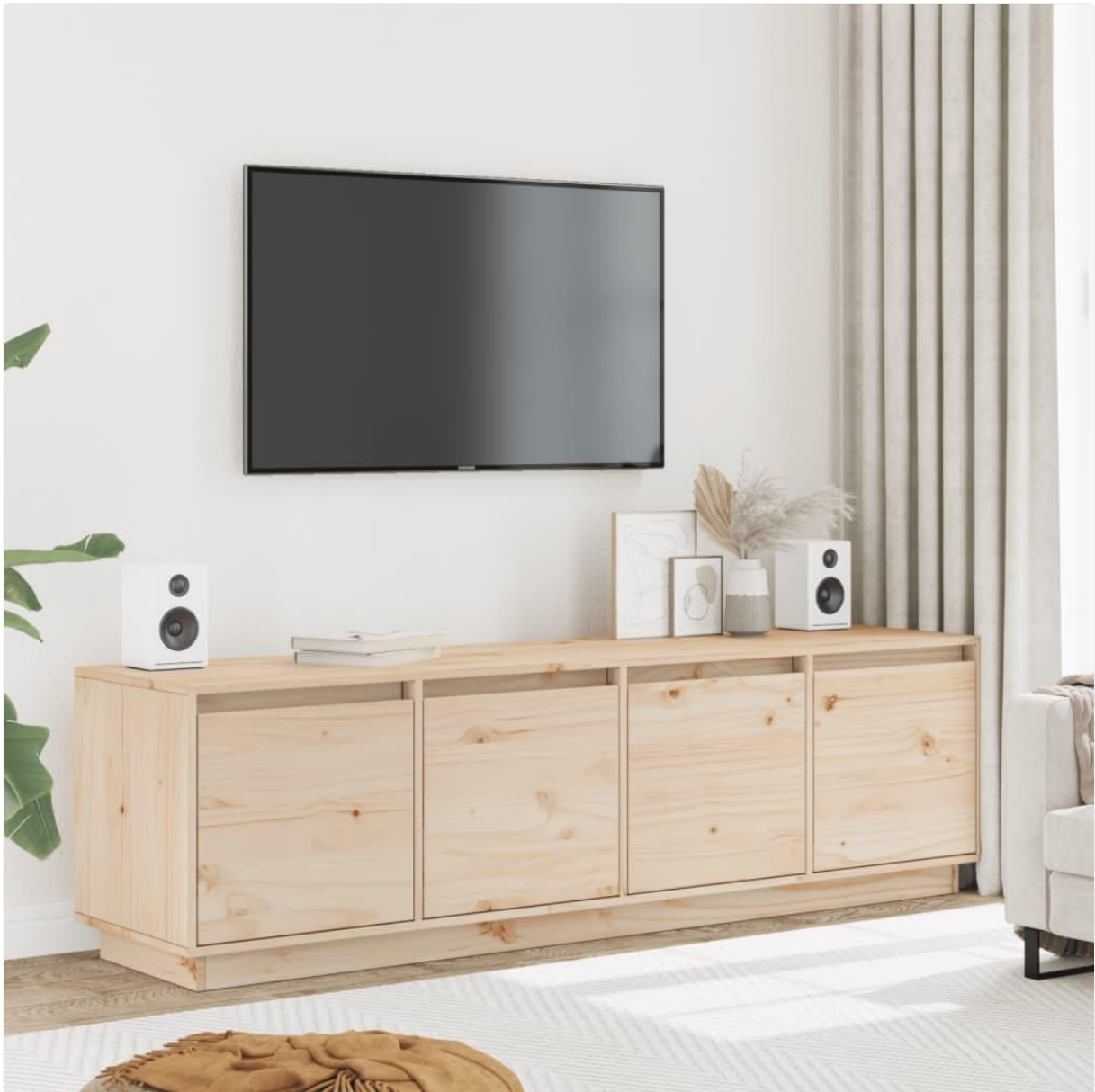
Image 1.1: The Genérico Solid Pine Wood TV Cabinet integrated into a modern living room, showcasing its functional design beneath a wall-mounted television.