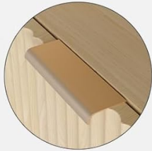
Wide Metal Handles