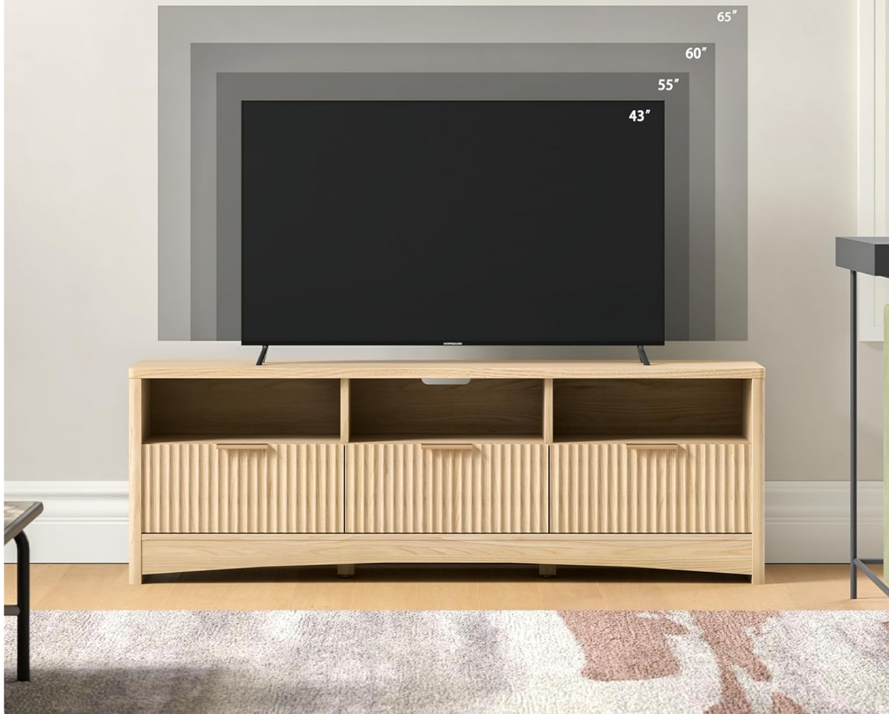
Image 5.1: The TV stand is designed to accommodate TVs up to 65 inches.