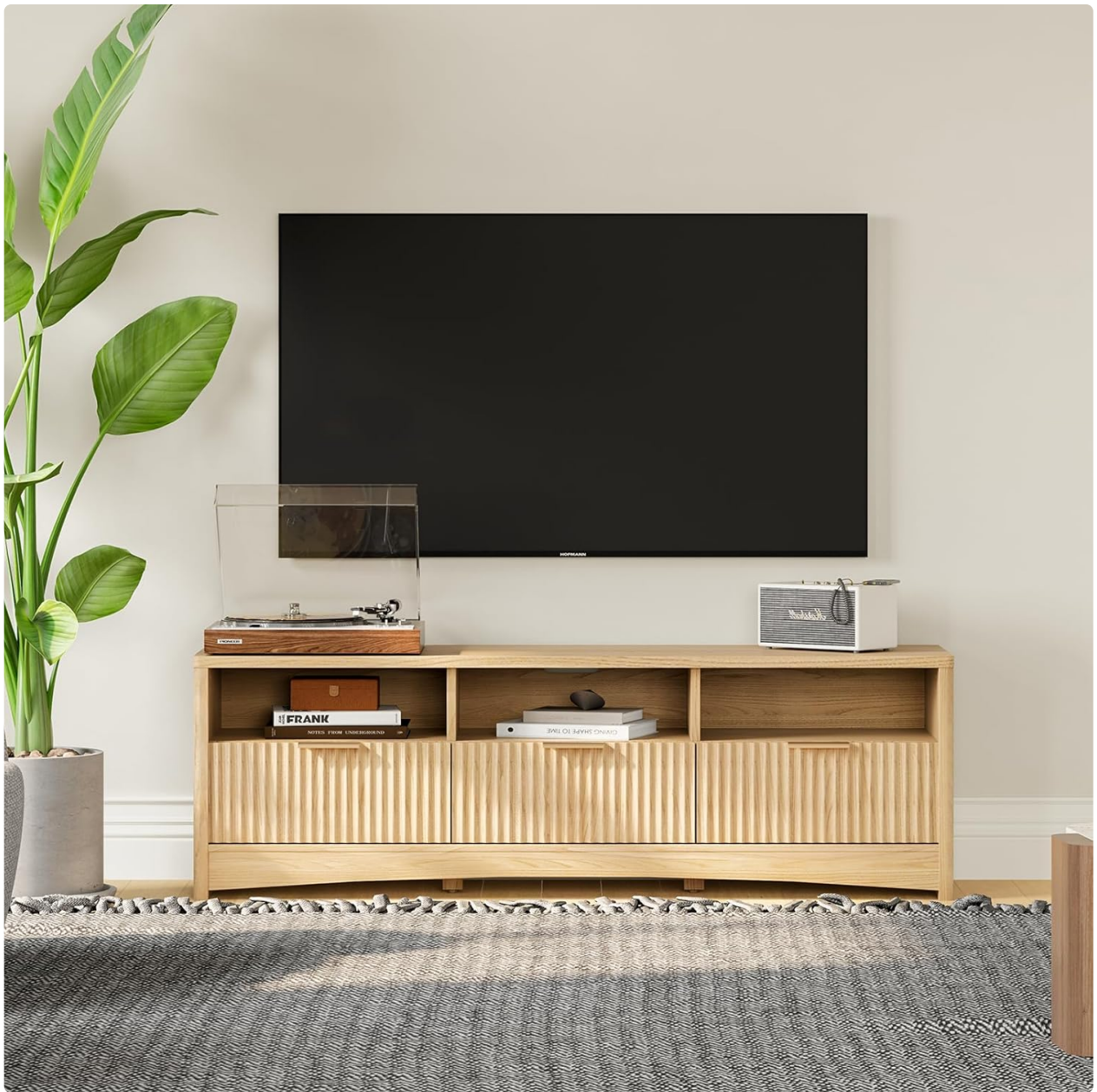
Image 1.1: The Pipishell Fluted TV Stand in a modern living room setup.