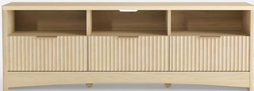
Image 4.1: Thoughtful design features for ease of use and assembly.