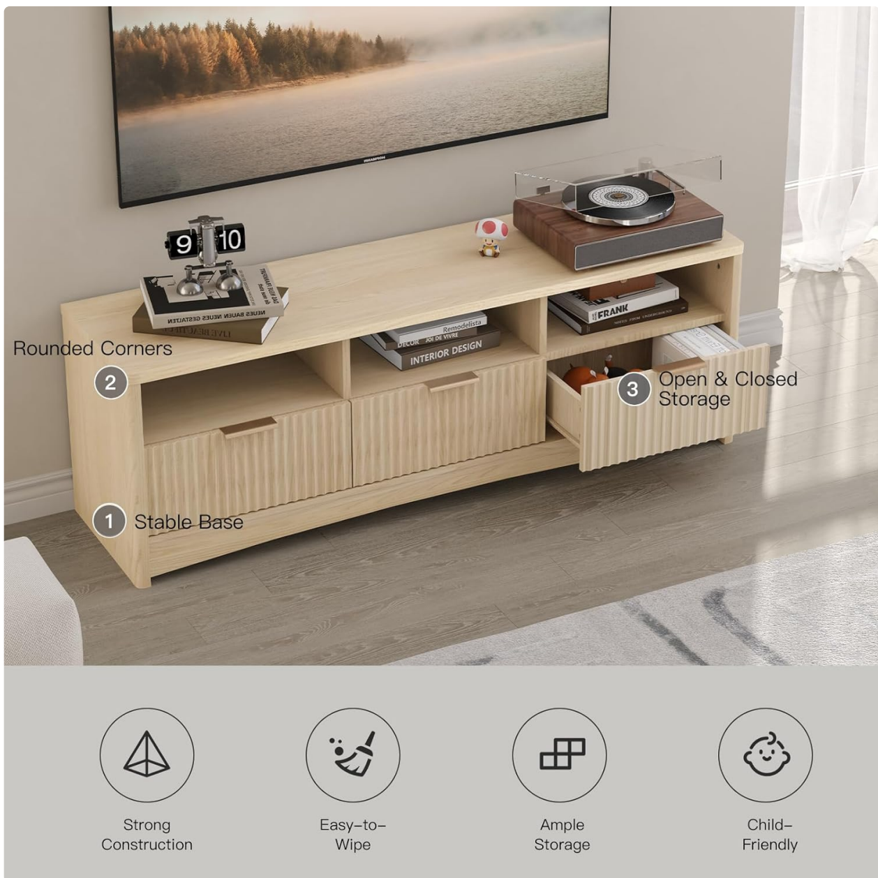
Image 2.1: Key safety and design features including the stable base and rounded corners.