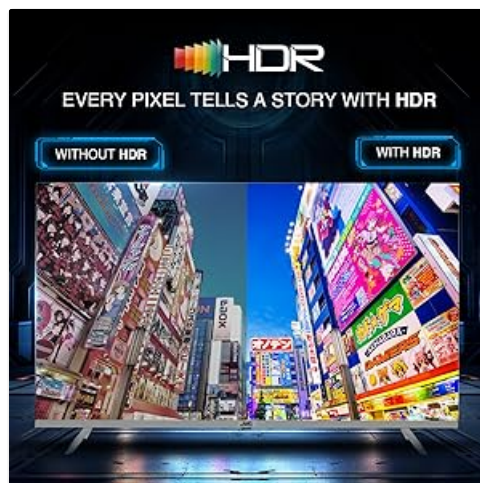
Figure 7: HDR Picture Enhancement. This image visually compares a scene displayed without HDR and with HDR, illustrating how HDR technology improves detail, contrast, and color vibrancy.