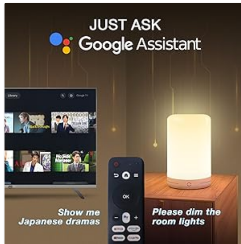
Figure 6: Google Assistant Integration. This image illustrates how to use Google Assistant with the JVC TV remote for tasks such as finding content or controlling smart home devices.