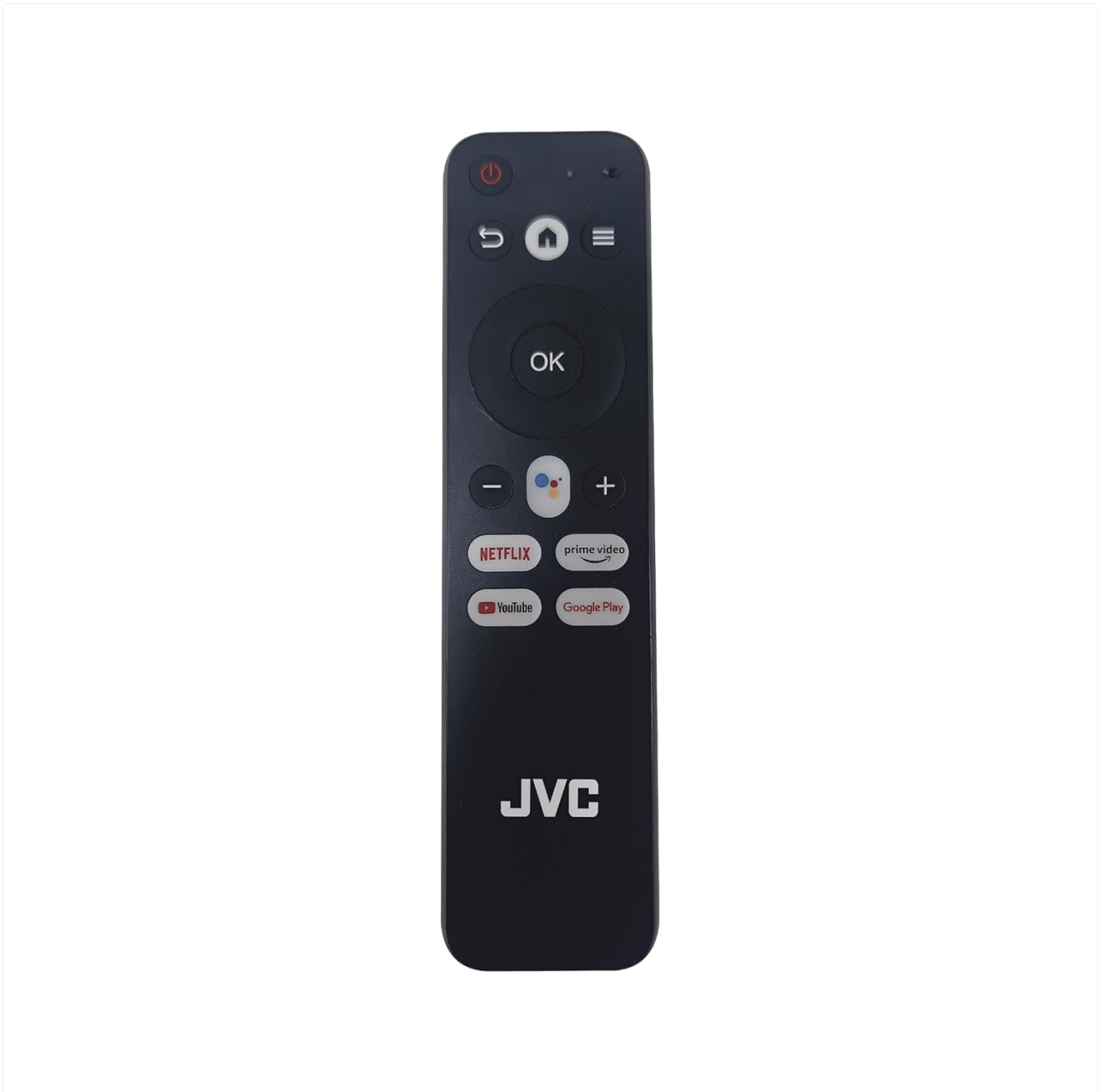
Figure 5: Accessing Apps and Games. This image demonstrates the wide range of streaming applications and games available on the JVC Google TV, accessible through the Google Play Store.