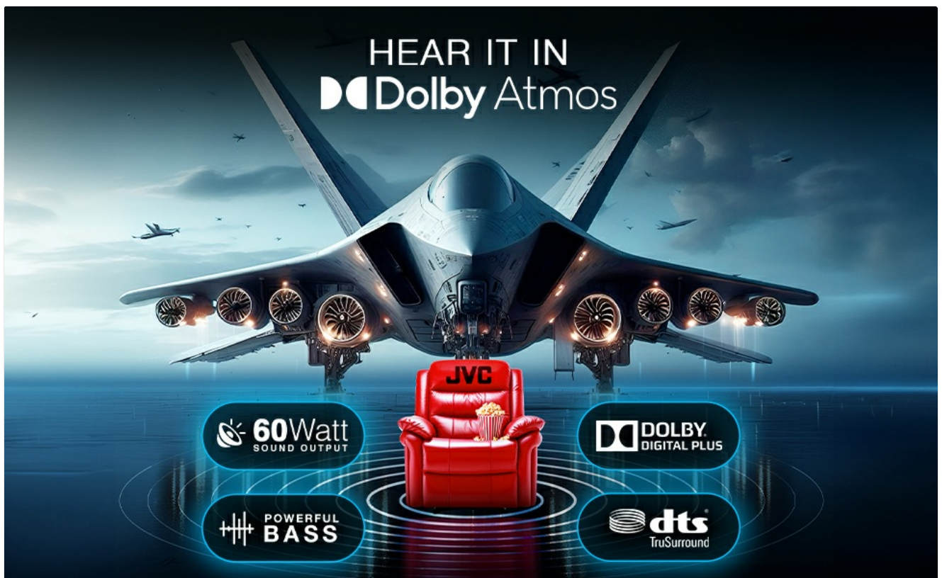
Figure 9: Immersive Audio with Dolby Atmos. This image visually represents the powerful audio capabilities of the JVC TV, featuring 60W sound output, Dolby Atmos, Dolby Digital Plus, and DTS TruSurround for a rich sound experience.