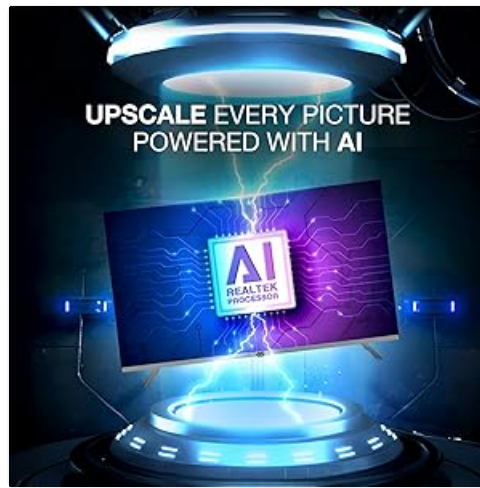
Figure 8: AI-Powered Upscaling. This image highlights the AI Realtek Processor's capability to upscale content, improving the visual quality of non-4K sources on the QLED display.