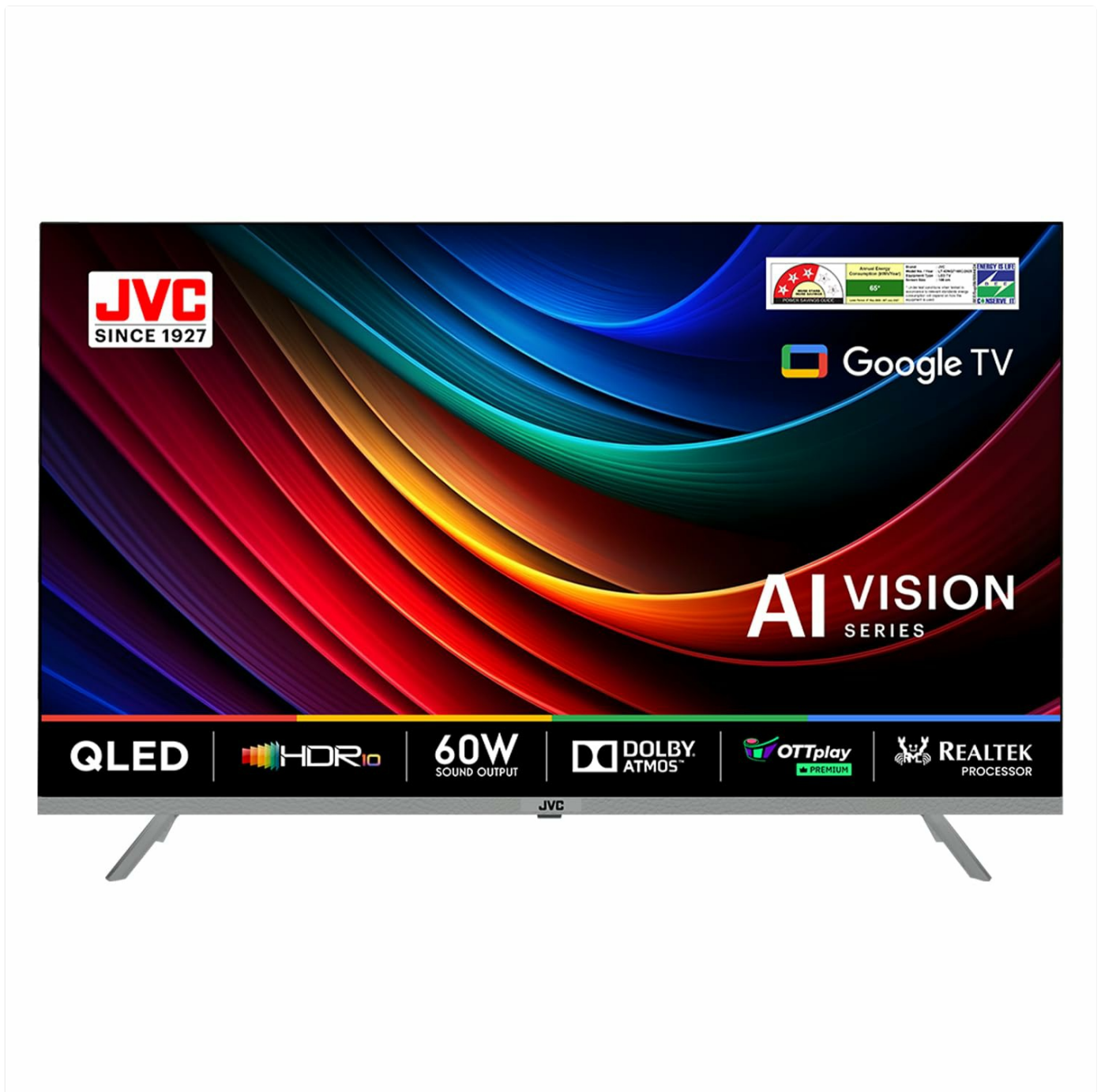
Figure 2: JVC 43-inch QLED Google TV with Base Stands. This image shows the television unit with its two base stands securely attached, ready for table-top placement.