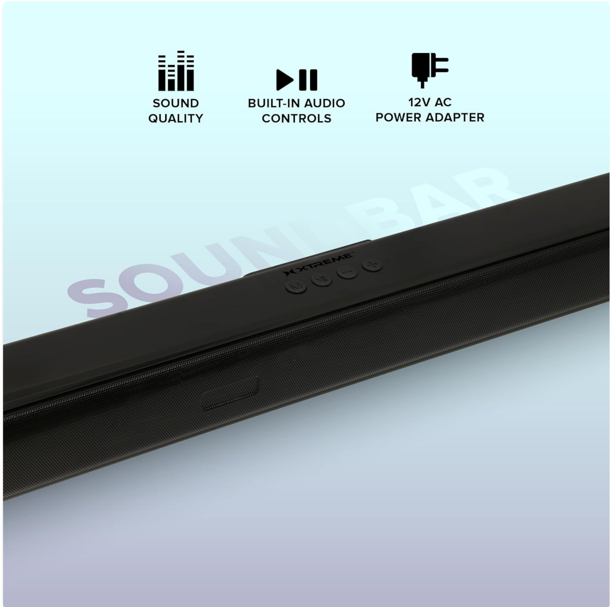
Image: A detailed view of the soundbar's top panel, highlighting the built-in controls and icons representing sound quality and power adapter.