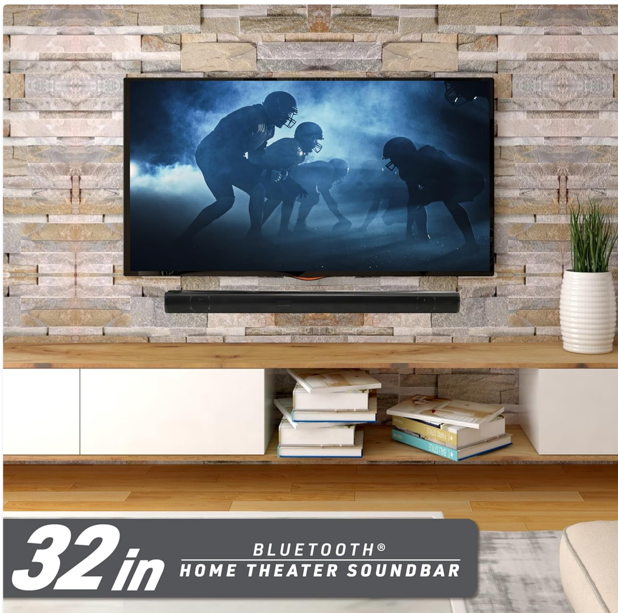
Image: The Xtreme 32-inch Soundbar positioned neatly under a television, demonstrating a typical home theater setup.