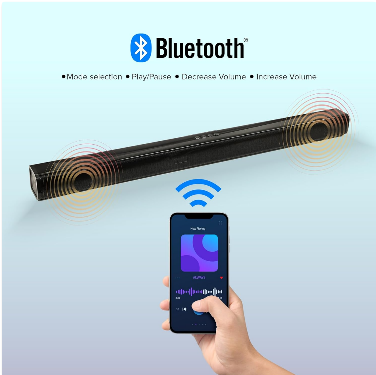
Image: A smartphone displaying a music app, with sound waves indicating a Bluetooth connection to the soundbar.