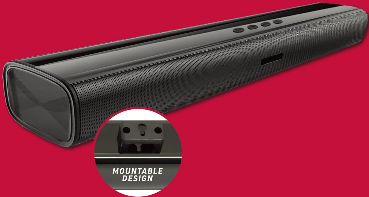
Image: The Xtreme Soundbar with an inset highlighting its mountable design for easy installation.