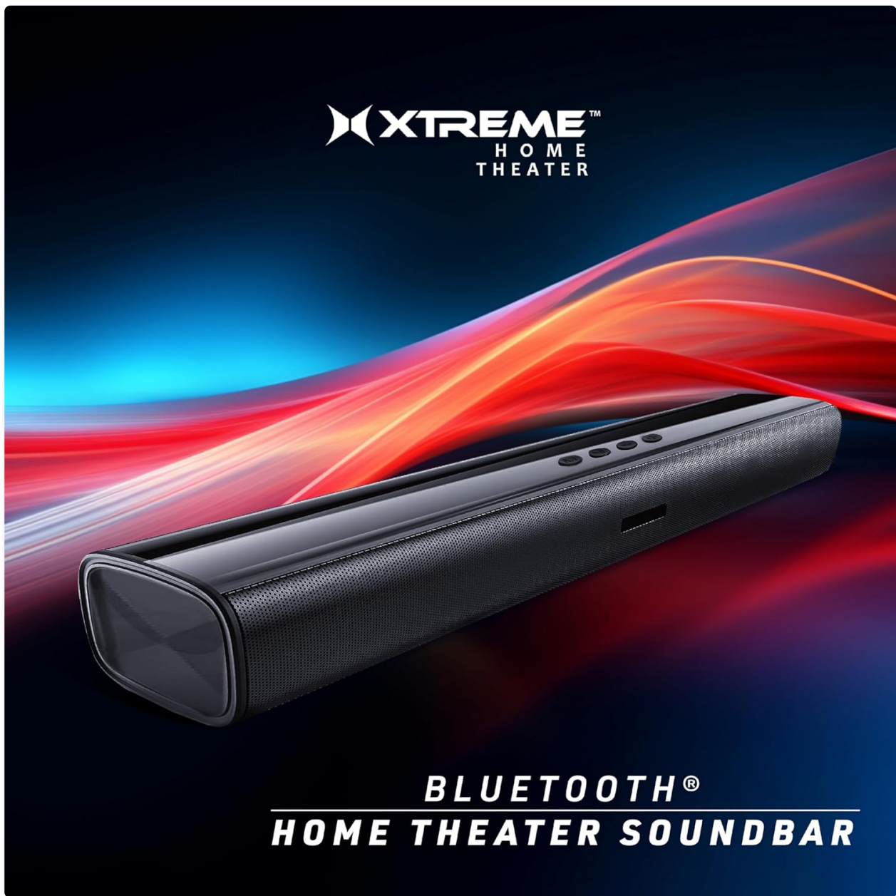
Image: The Xtreme 32-inch Bluetooth Soundbar, showcasing its sleek design and the Xtreme Home Theater branding.