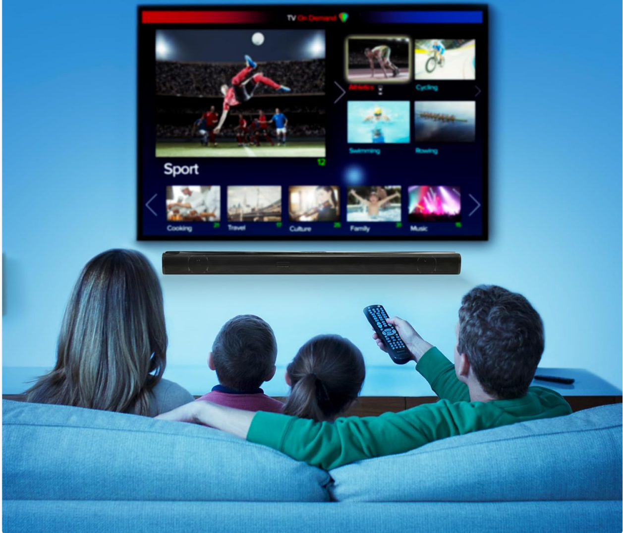
Image: A family enjoying entertainment with the Xtreme Soundbar, demonstrating the use of the remote control for convenient operation.