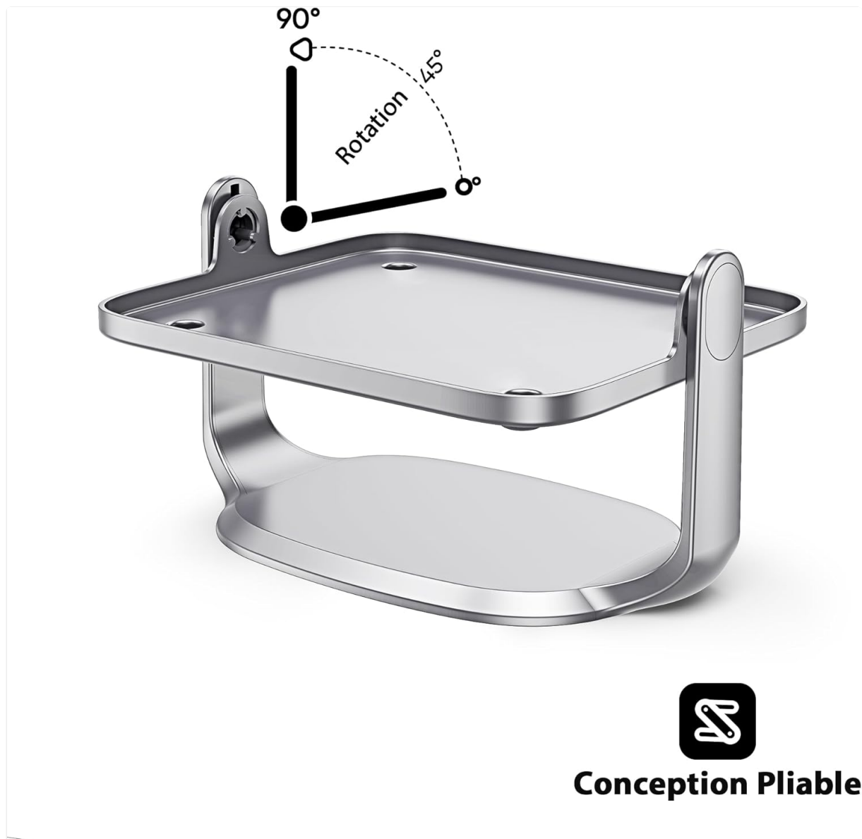
Image: The HORLAT Projector Tripod Stand TP-01, showcasing its sleek design and stable structure.

The HORLAT TP-01 stand is designed for ease of use and stability. It features a sturdy base and a rotatable platform for your projector.