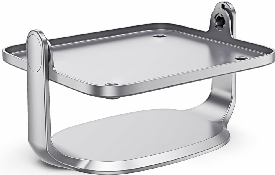
Image: Diagram illustrating the 90-degree and 45-degree rotation capabilities of the projector stand's platform.