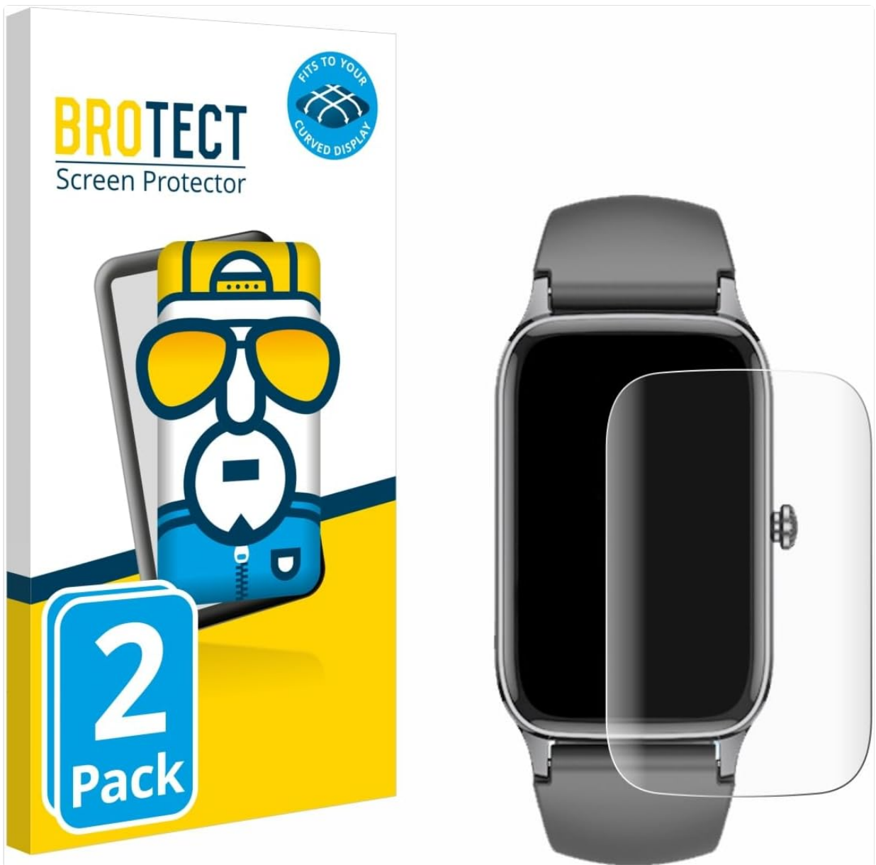
Figure 3.1: Contents of the BROTECT screen protector package.