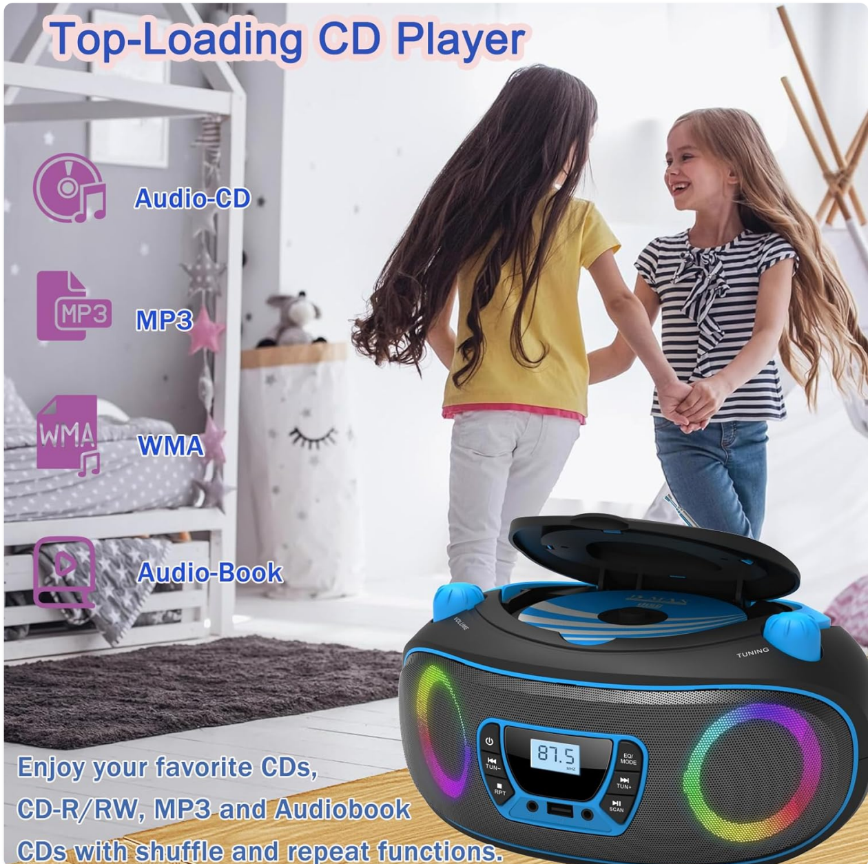
Figure 4: Top-Loading CD Player. This image shows the open CD compartment, ready for disc insertion, highlighting its compatibility with various CD formats.