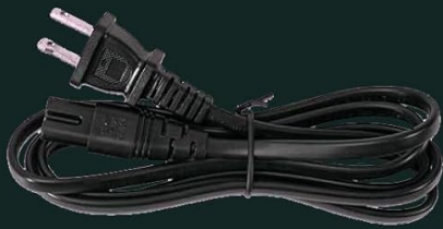
US AC Power Cable