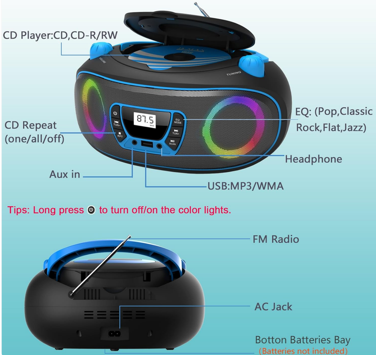
Figure 2: Product Details. This image highlights key features and ports on the boombox, including the CD Player, CD Repeat (one/all/off), Aux in, USB (MP3/WMA), Headphone jack, EQ (Pop, Classic, Rock, Flat, Jazz), FM Radio, AC Jack, and Battery Bay.