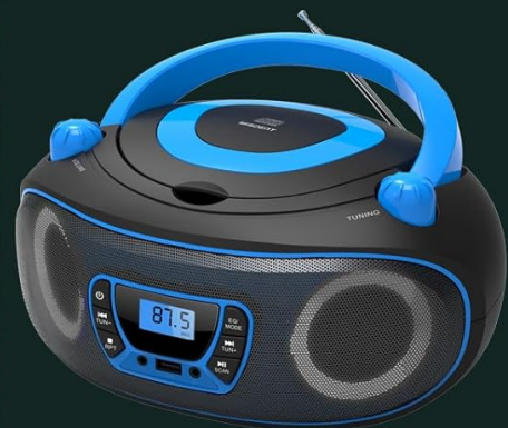
WCD-9949 Portable CD Player (Batteries not included)