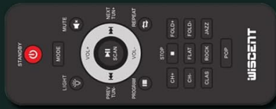
Remote Control (Batteries not included)