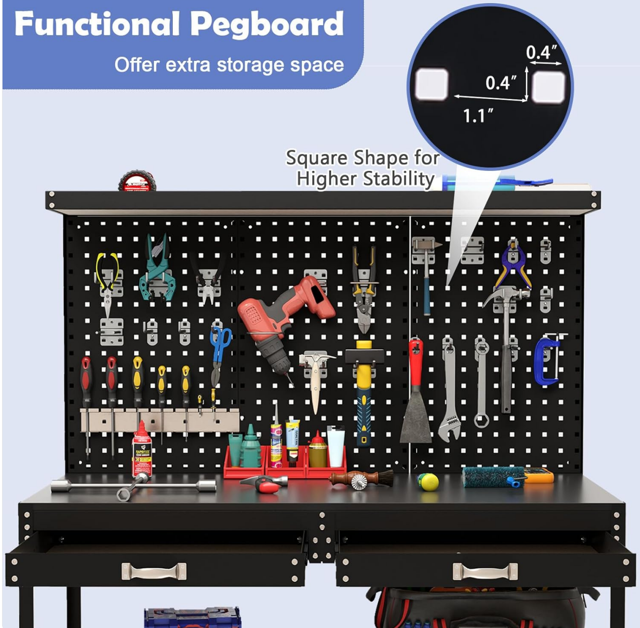
Image: Close-up of the functional pegboard on the Goplus workbench, showing various tools like drills, hammers, and pliers neatly organized using the square-shaped hanging holes.