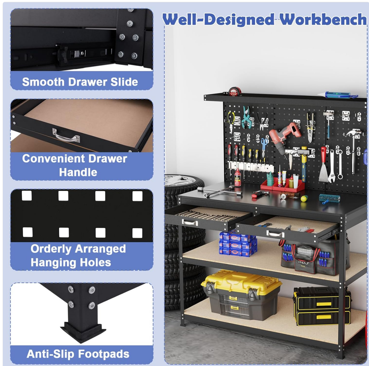
Image: Detailed view of the workbench features, including smooth drawer slides, convenient drawer handles, orderly arranged hanging holes on the pegboard, and anti-slip footpads.

operation of their slides. Finally, attach the three pegboard panels to the rear of the workbench.