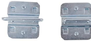
Square hooks x 2