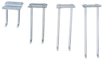
90° double hooks x 4