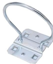
Circular hook x 1