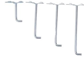
90° single hooks x 4