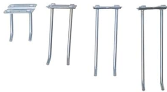
45° double hooks x 4