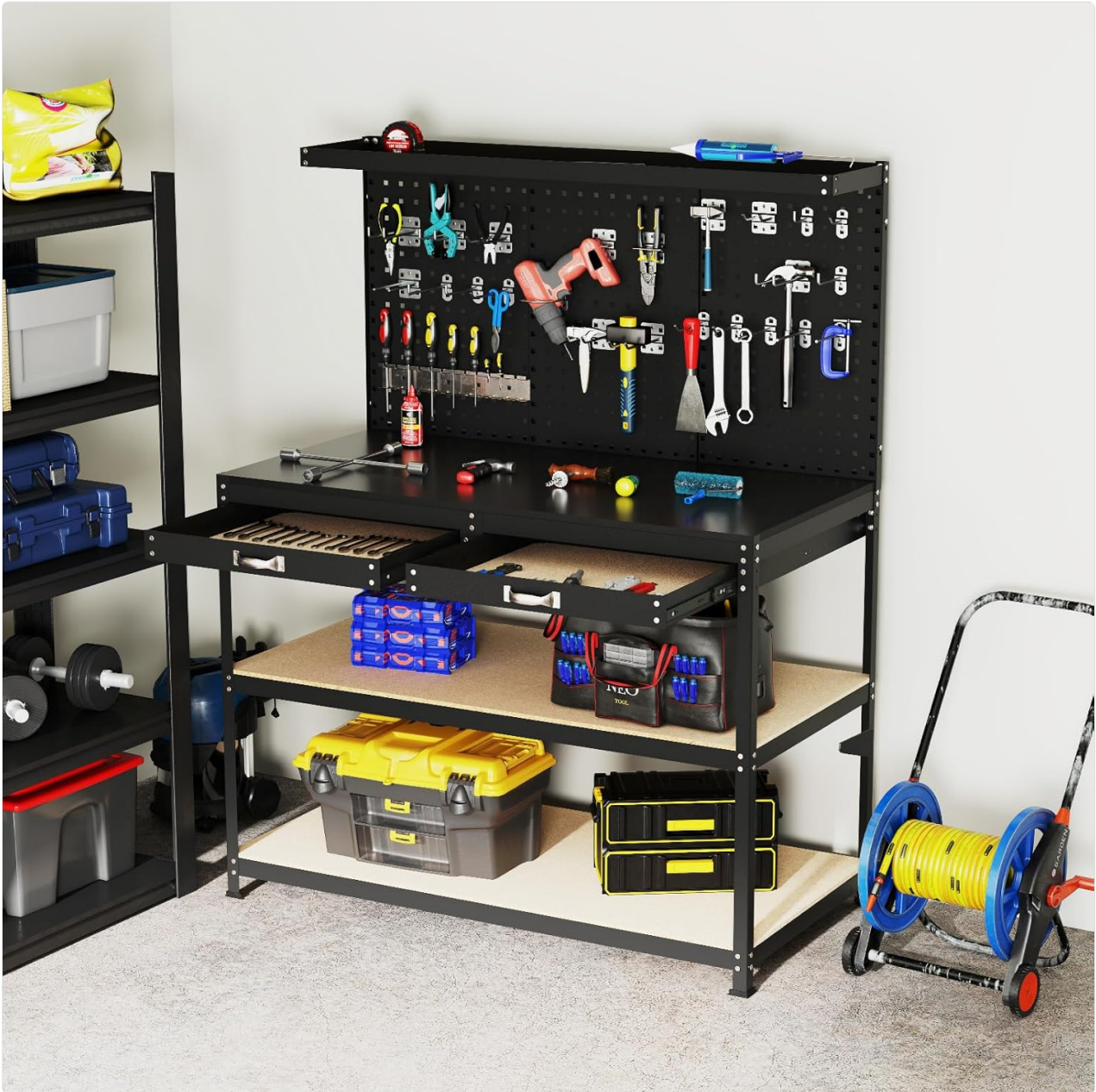
Image: A Goplus workbench fully set up in a garage, displaying various tools and storage bins on its shelves and tabletop.