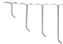
45° single hooks x 4