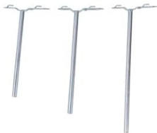
Straight single hook x 3