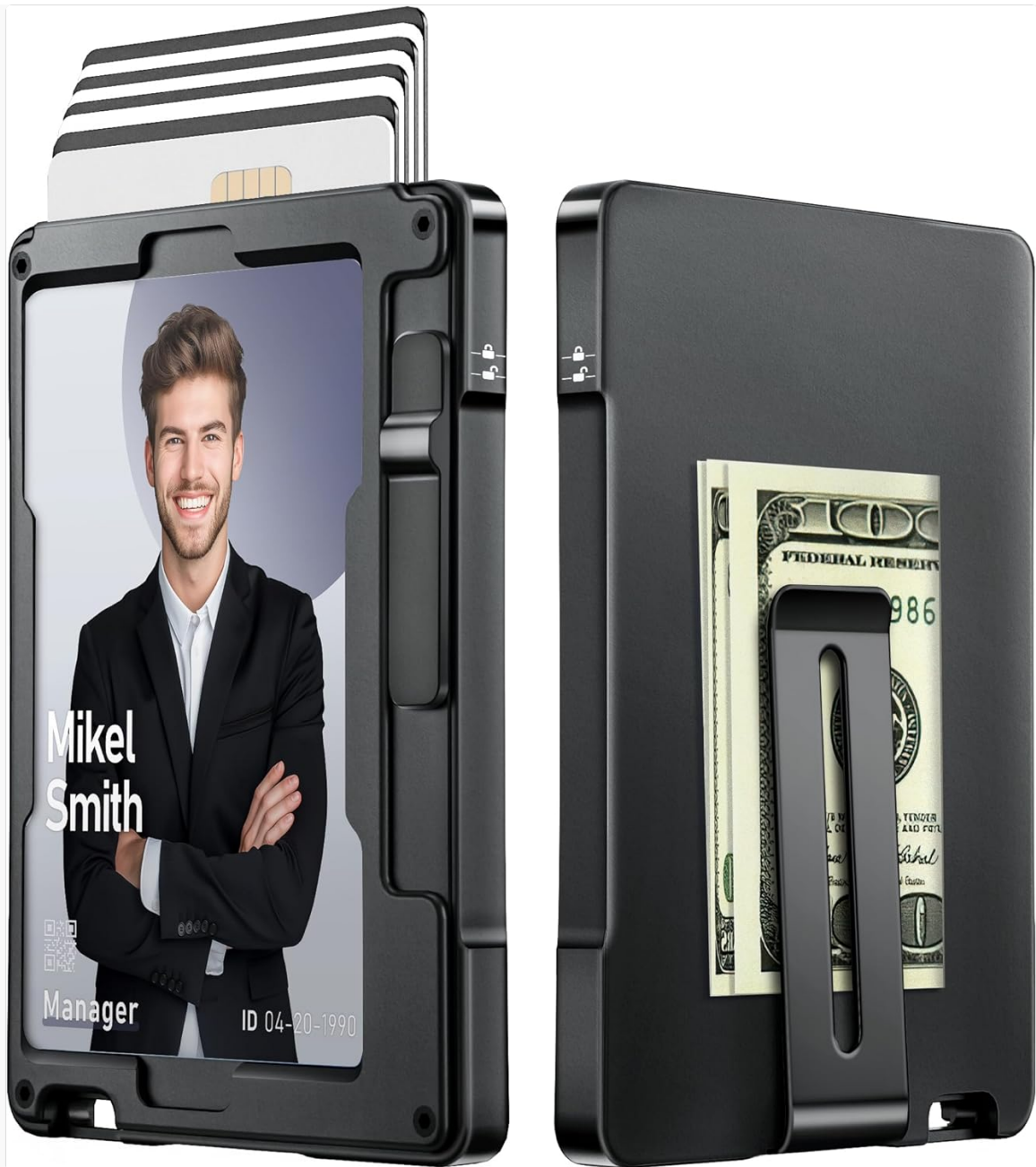
Image: Front and back view of the umoven Minimalist Wallet, showing cards partially ejected from the top and a money clip with cash on the back.