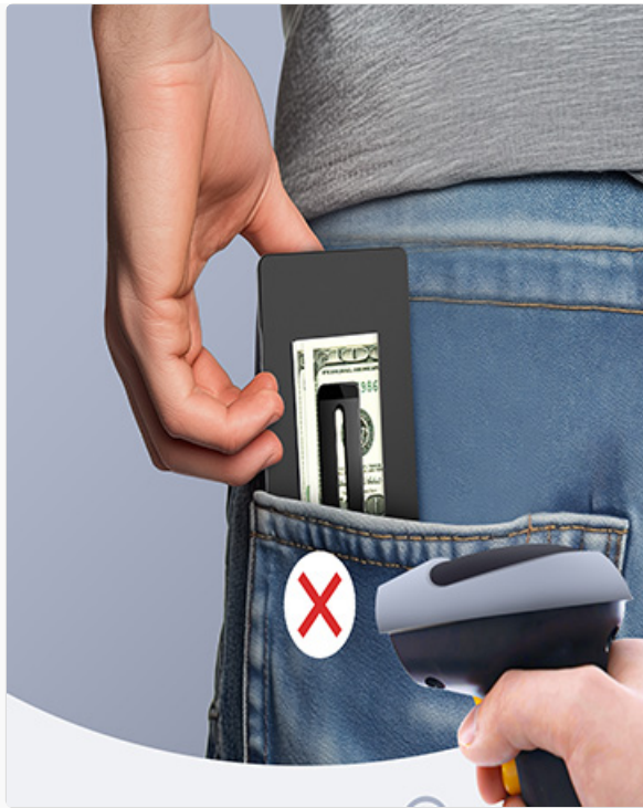
Image: A close-up view of the wallet's money clip, holding folded currency.