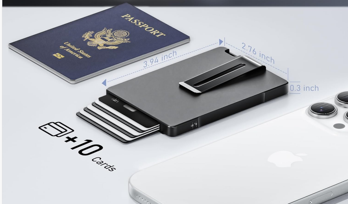
Image: The umoven Minimalist Wallet displayed with its dimensions and card capacity, alongside a passport and smartphone for scale.