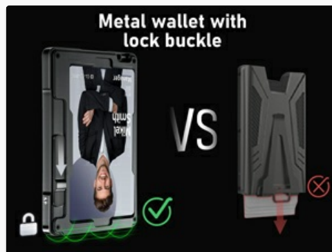
Image: A visual comparison highlighting the wallet's locking buckle feature, showing how it secures cards.

After inserting cards, ensure they are securely locked. Push the side buckle upward until you hear a 'da' sound. This engages the locking clasp, preventing cards from accidentally sliding out. To unlock, press the buckle down until you hear a 'click'.