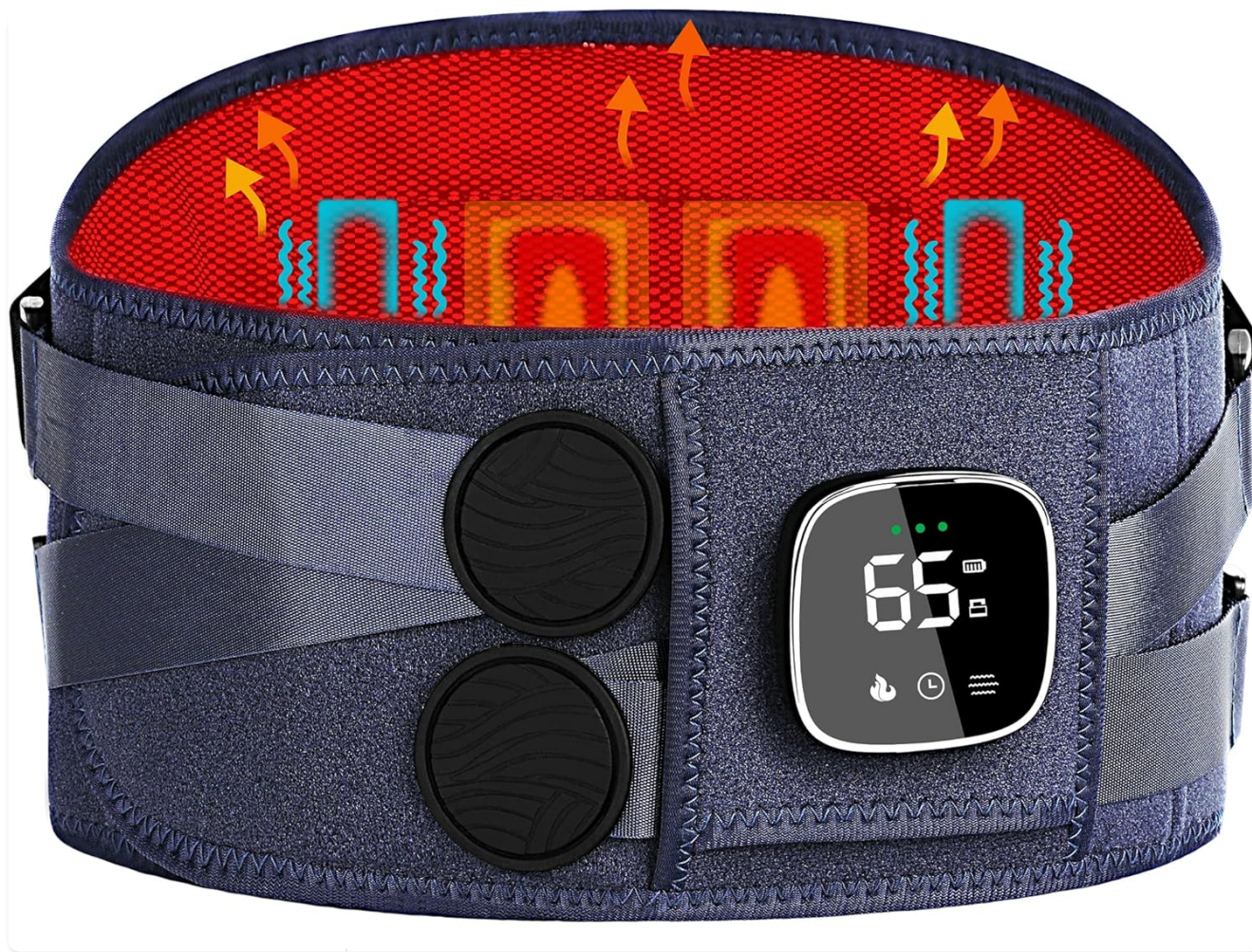
Image: The main product, a blue cordless heating pad with a digital display and adjustable straps.