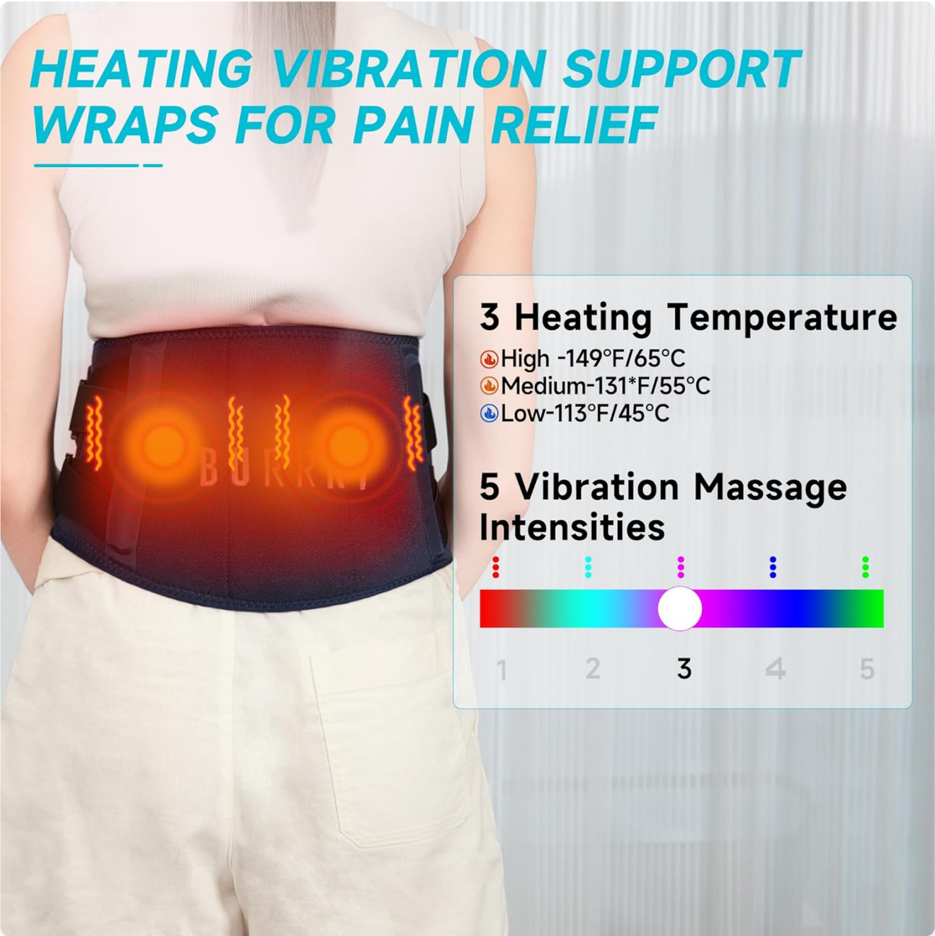
Image: A person wearing the heating pad, with an overlay showing the three heating temperature levels and five vibration massage

Press the heat button on the control panel to cycle through the heat settings. The current setting will be displayed on the LCD screen.