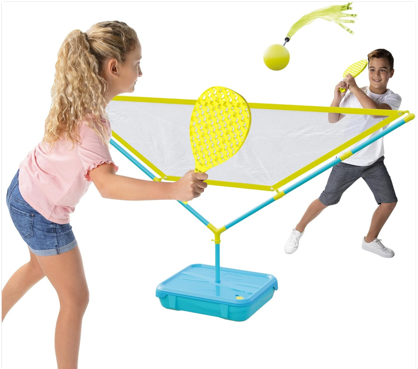
Figure 5: Children engaged in a game of Tailball, demonstrating the net setup.