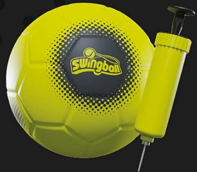
Figure 2: All components included in the Swingball 5-in-1 Set.