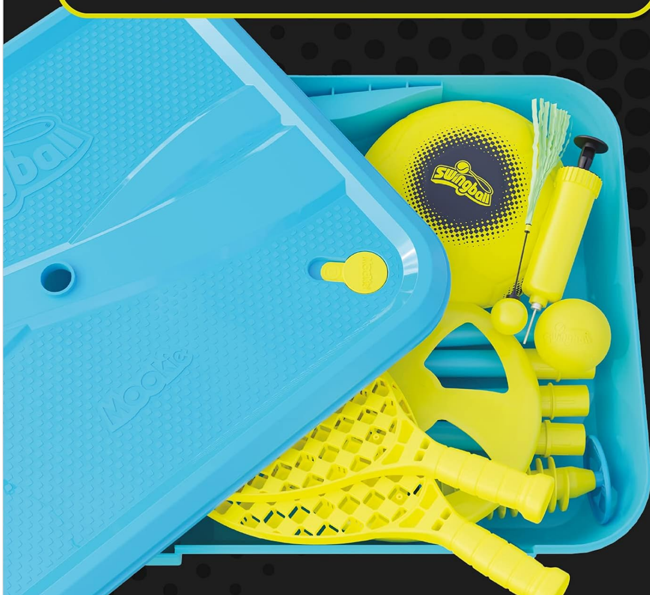
Figure 7: All components pack neatly into the base for compact storage.