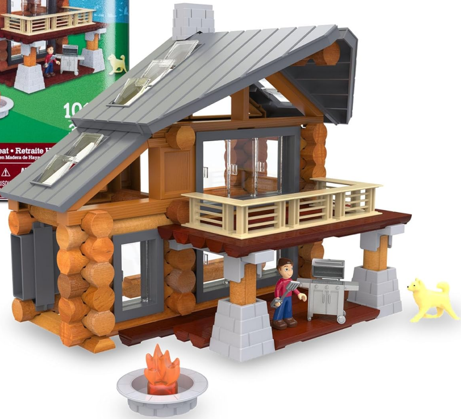
Figure 1: Fully assembled Lincoln Logs Beechwood Retreat, showcasing the cabin, balcony, grill, fire pit, and figures.