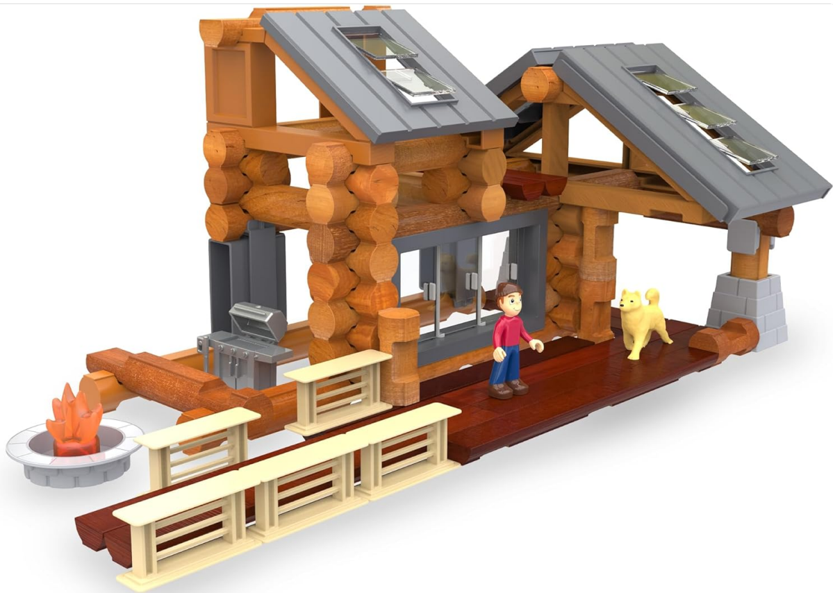
Figure 2: An alternative open-back configuration of the Beechwood Retreat, highlighting the interior play space.