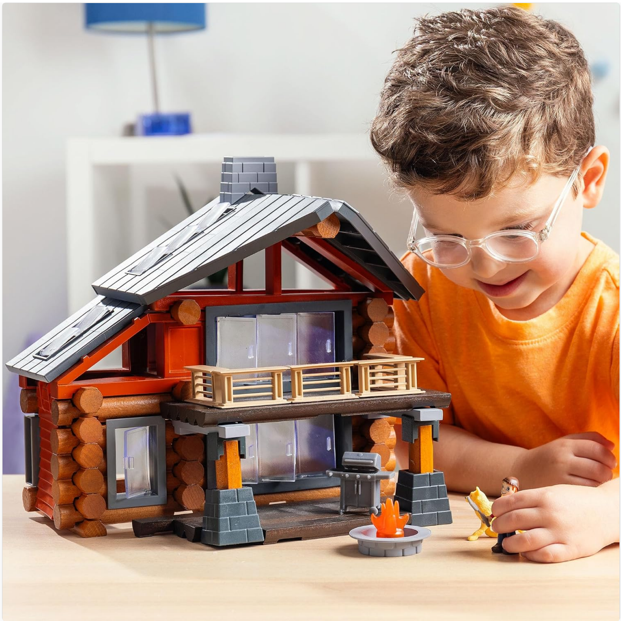
Figure 3: A child engaging in imaginative play, positioning a figure on the cabin's balcony.