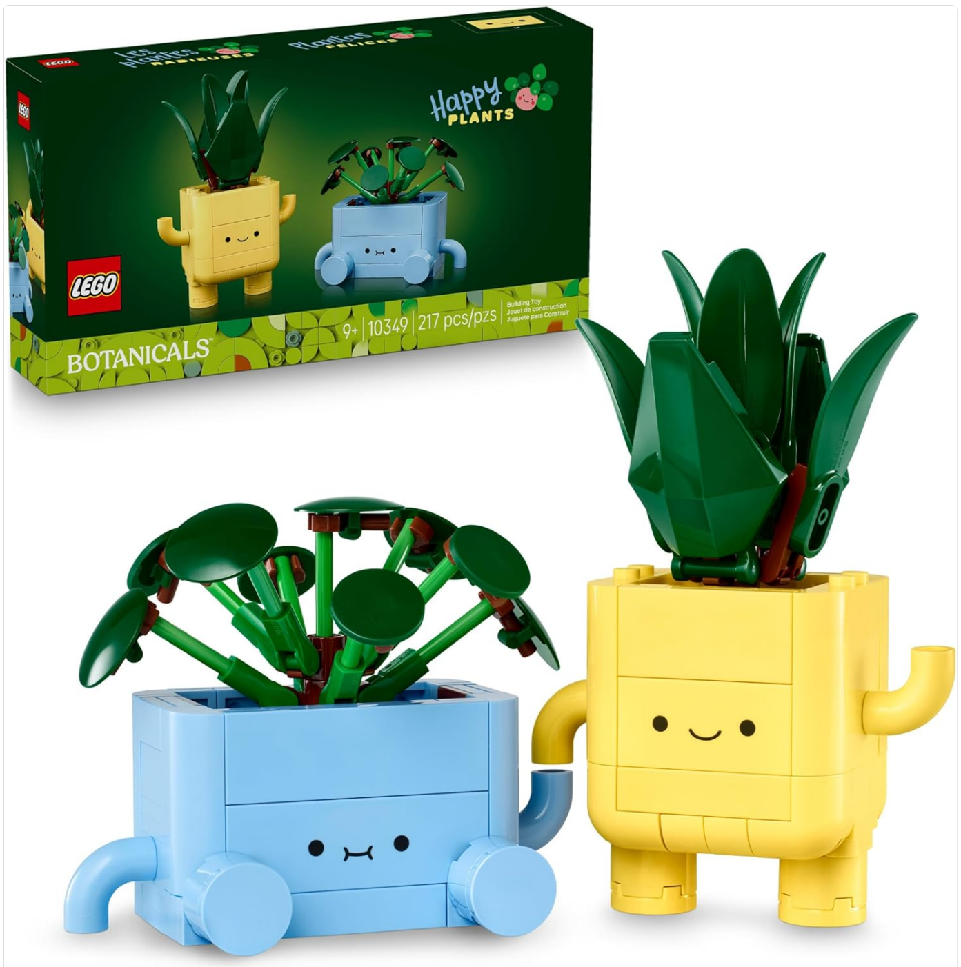
Image: The LEGO Botanicals Happy Plants set, showing the product box and the two assembled plant models in their pots.