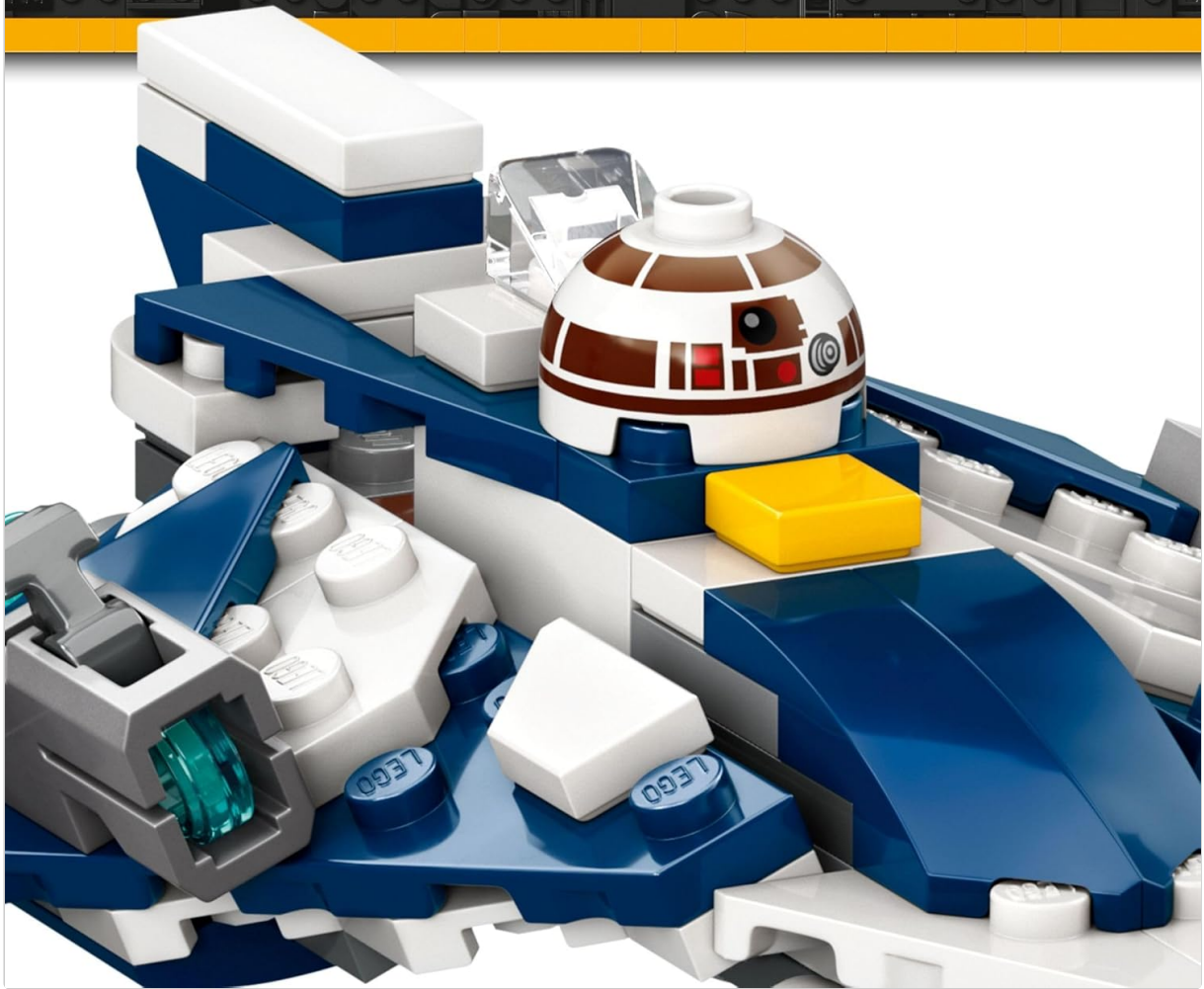
Image: A close-up view of the R7-D4 droid head element attached to the front fuselage of the Jedi Starfighter Microfighter.