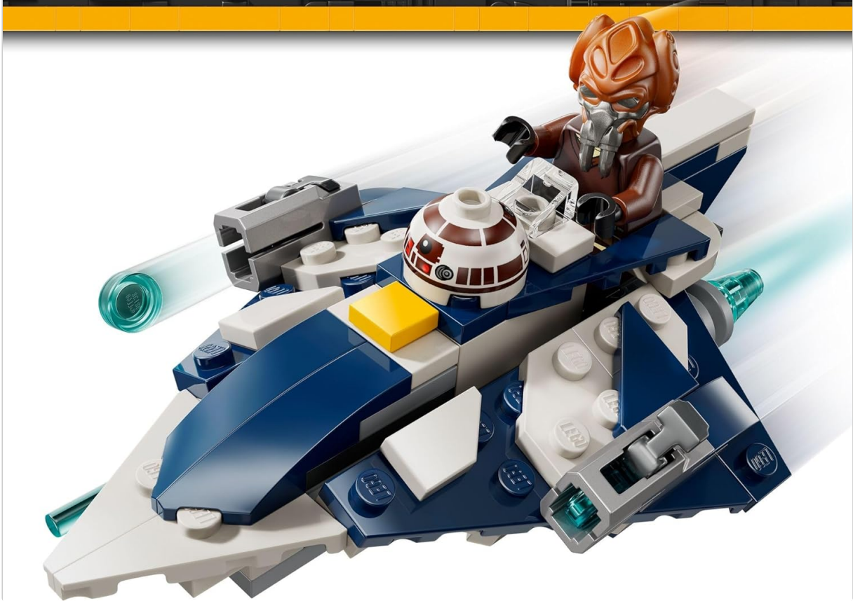
Image: The Jedi Starfighter Microfighter with stud shooters activated, showing green studs firing from the wings.