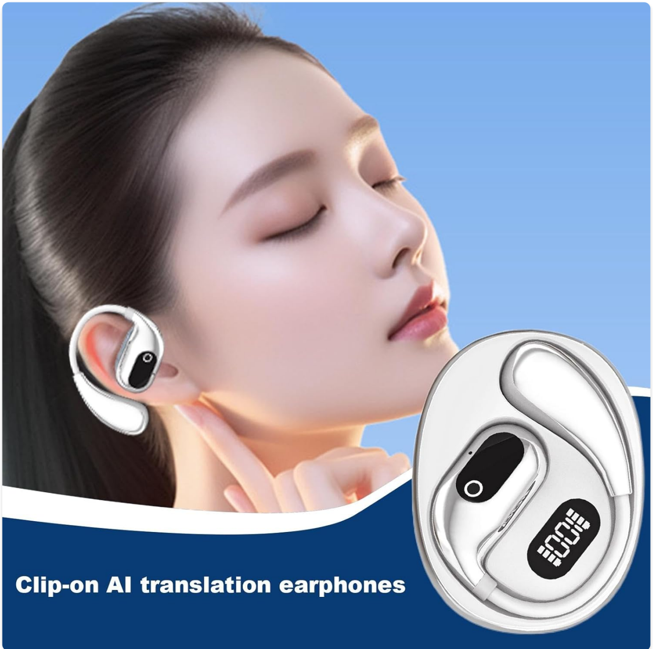
Figure 4.1: The ear-hook design ensures a comfortable and stable fit for extended use.