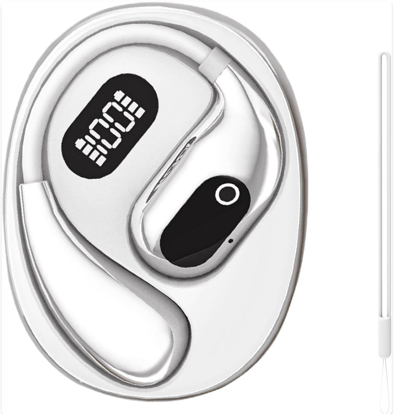
Figure 1.1: The Xg99 Translation Earbud in its compact charging case, highlighting the digital display for battery status.