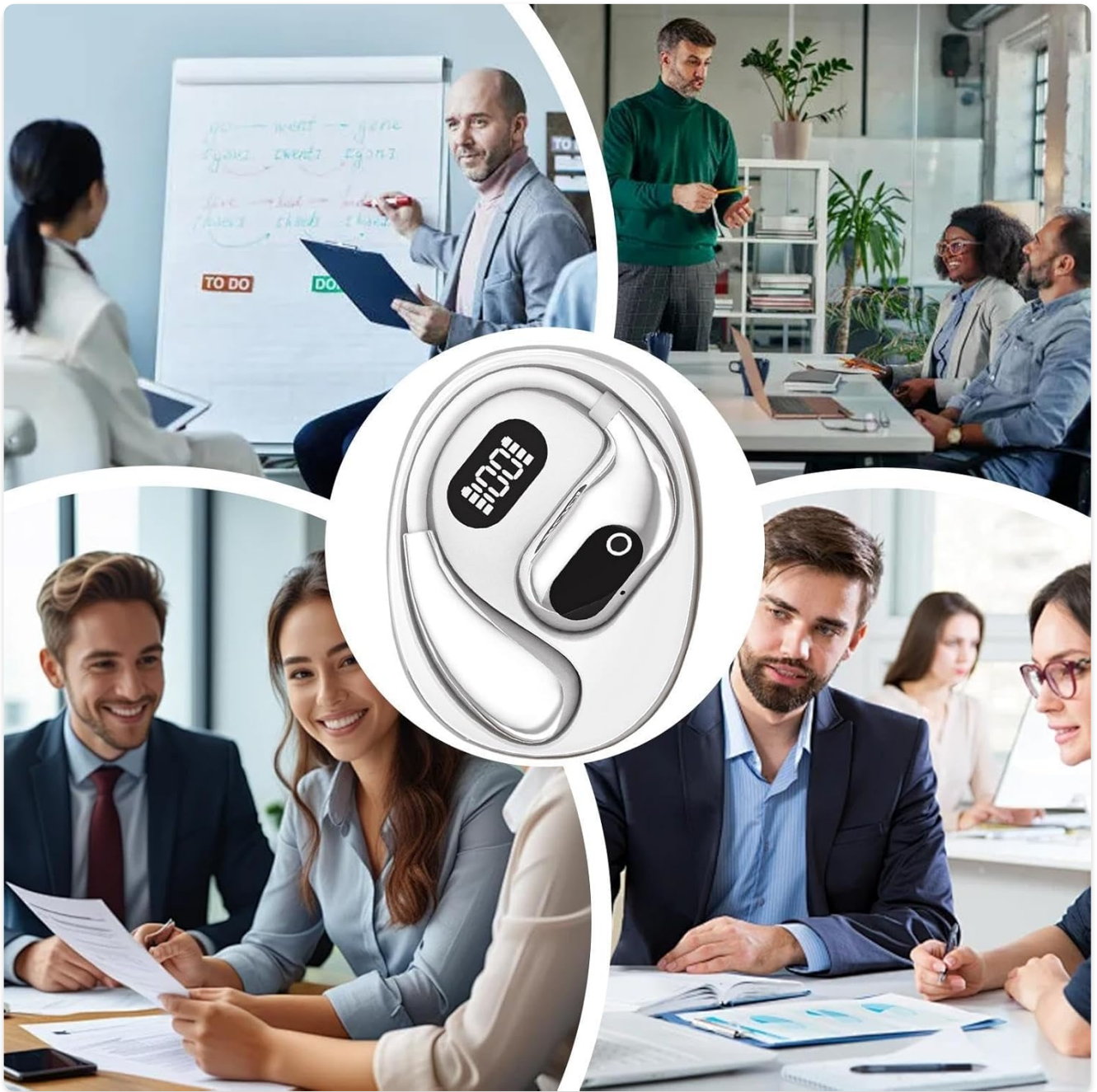
Figure 4.3: The Xg99 earbuds are versatile for various applications, from business travel to daily communication.