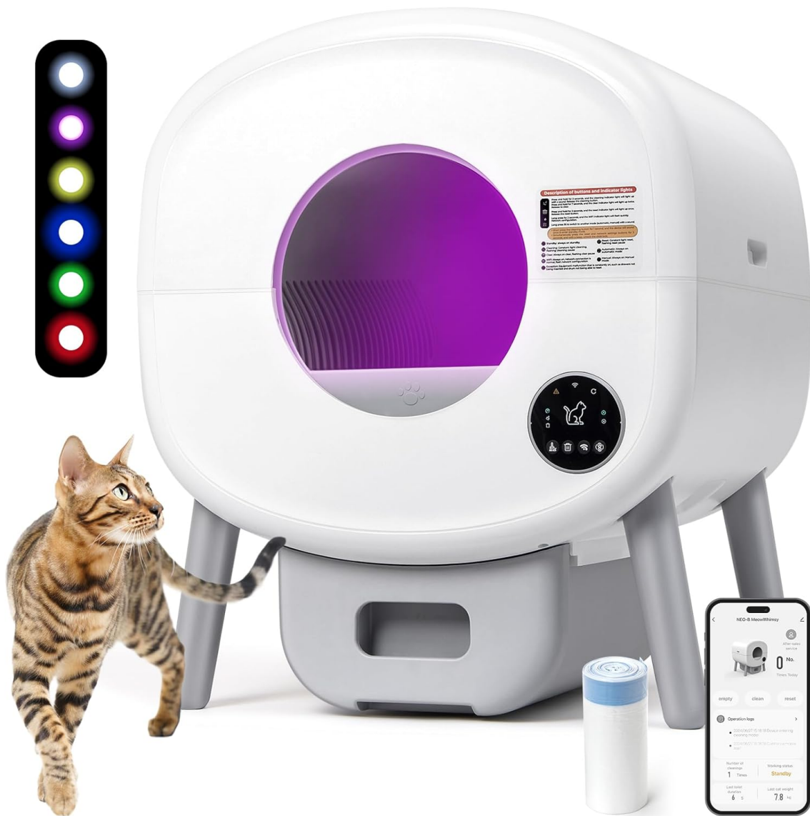
Image: The Fsitego Self-Cleaning Automatic Cat Litter Box, showcasing its sleek design, ambient lighting, and app control interface.