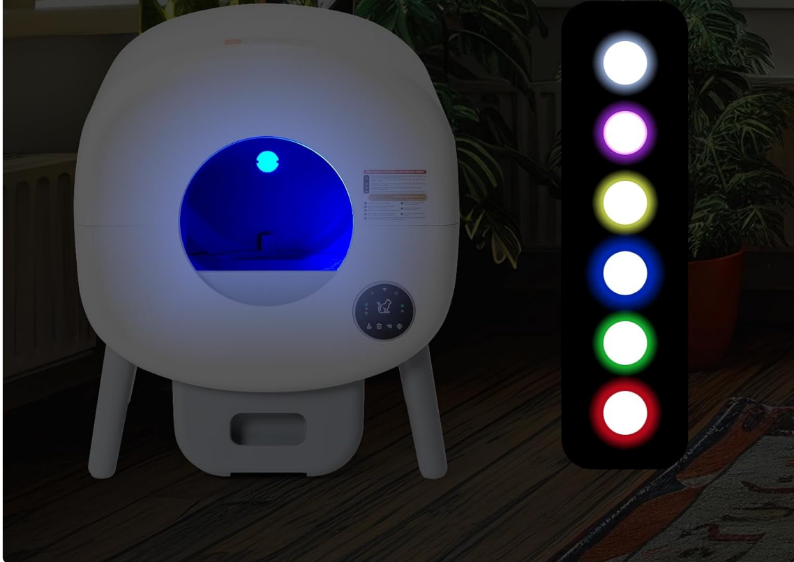
Image: The litter box interior illuminated with different ambient light colors, demonstrating customization options.

Customize the ambient lighting in your cat's litter box with your phone to make your cat's toilet experience even better!