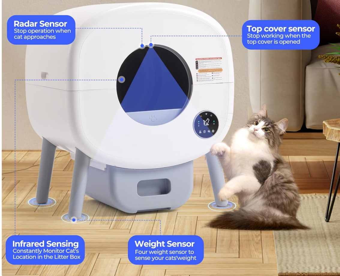
Image: An exploded view diagram highlighting the radar sensor, top cover sensor, infrared sensing, and weight sensors for pet safety.

When the cat is close to the sensor, the machine will pause until the cat is gone