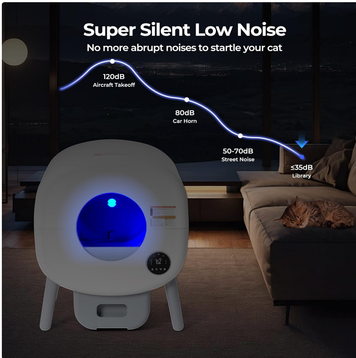
Image: A graphic illustrating the quiet operation of the litter box ( \leq 35\text{dB} ) compared to other noise sources like street noise or a car horn.

Video: Demonstrates the cleaning cycle and waste disposal, highlighting the convenience for multi-cat households.