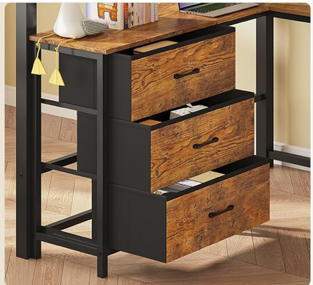
Figure 5: Storage solutions including hanging rod and fabric drawers.