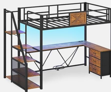
Figure 2: Illustration of the reversible staircase and desk configurations.