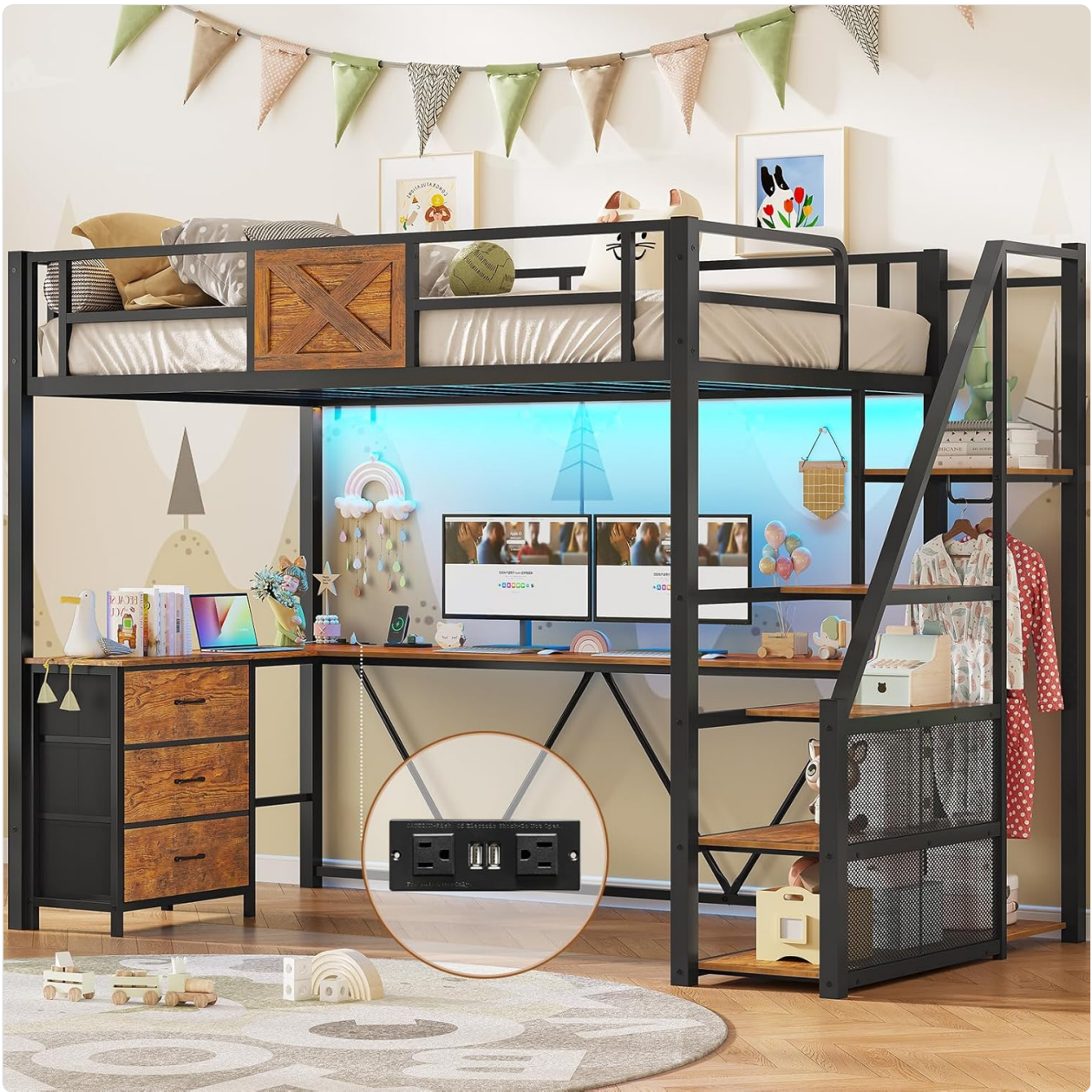
Figure 1: Overall view of the Itaar Twin Size Loft Bed, showcasing the bed, L-shaped desk, and storage stairs.