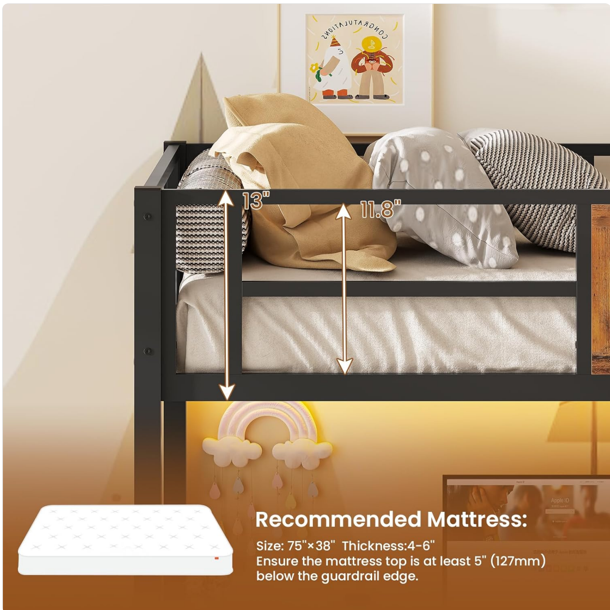
Figure 8: Recommended mattress thickness for safety.