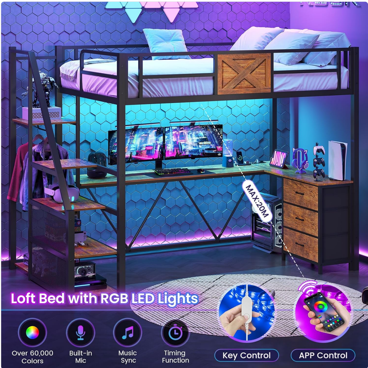
Figure 6: Loft bed with customizable RGB LED lighting.