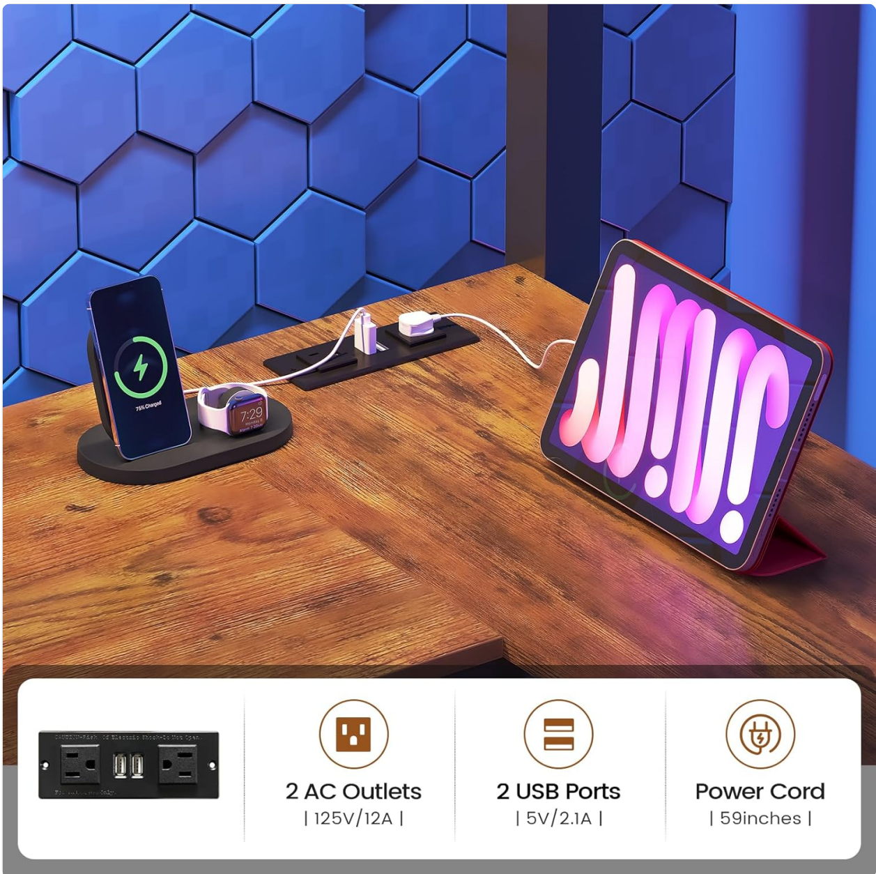
Figure 7: Integrated charging station for electronic devices.