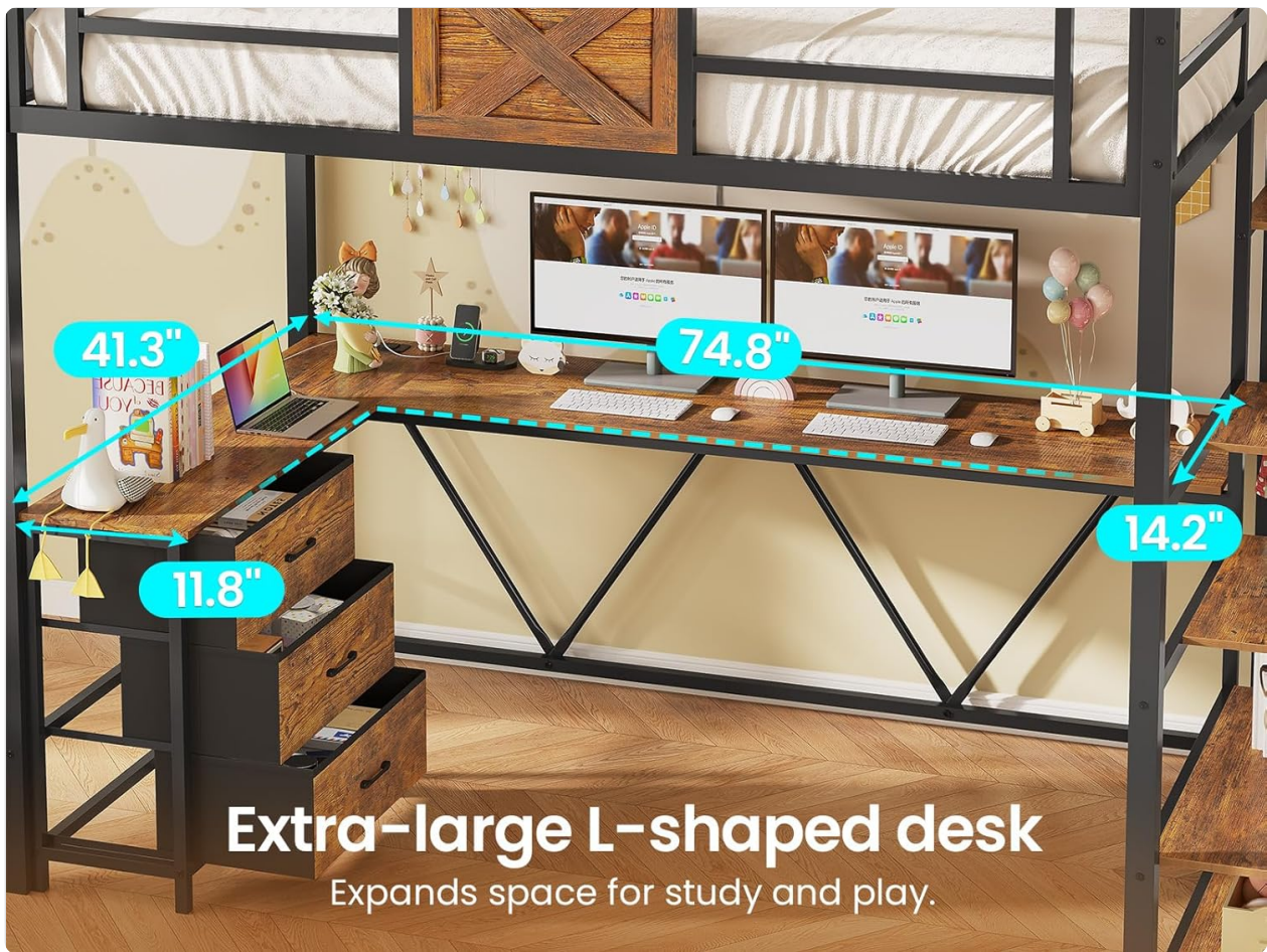
Figure 4: L-shaped desk with detailed dimensions.