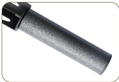
Durable iron bed feet