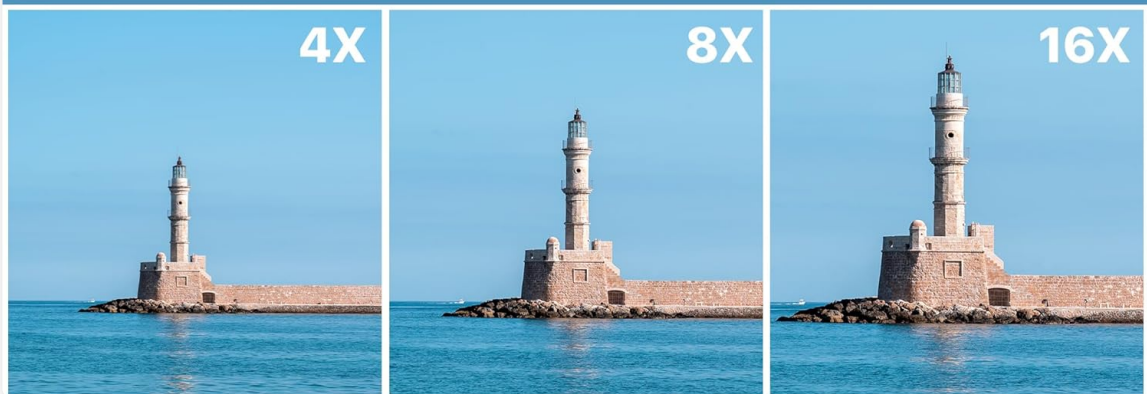
Image: Visual examples of the 16X digital zoom at different magnifications.