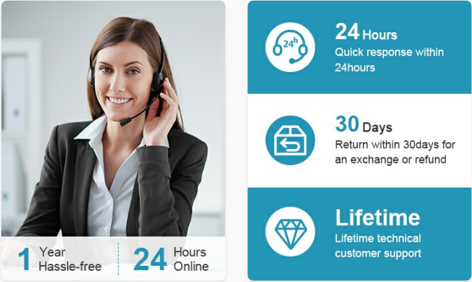
Image: Visual representation of FJFJOPK's commitment to customer support and warranty services.