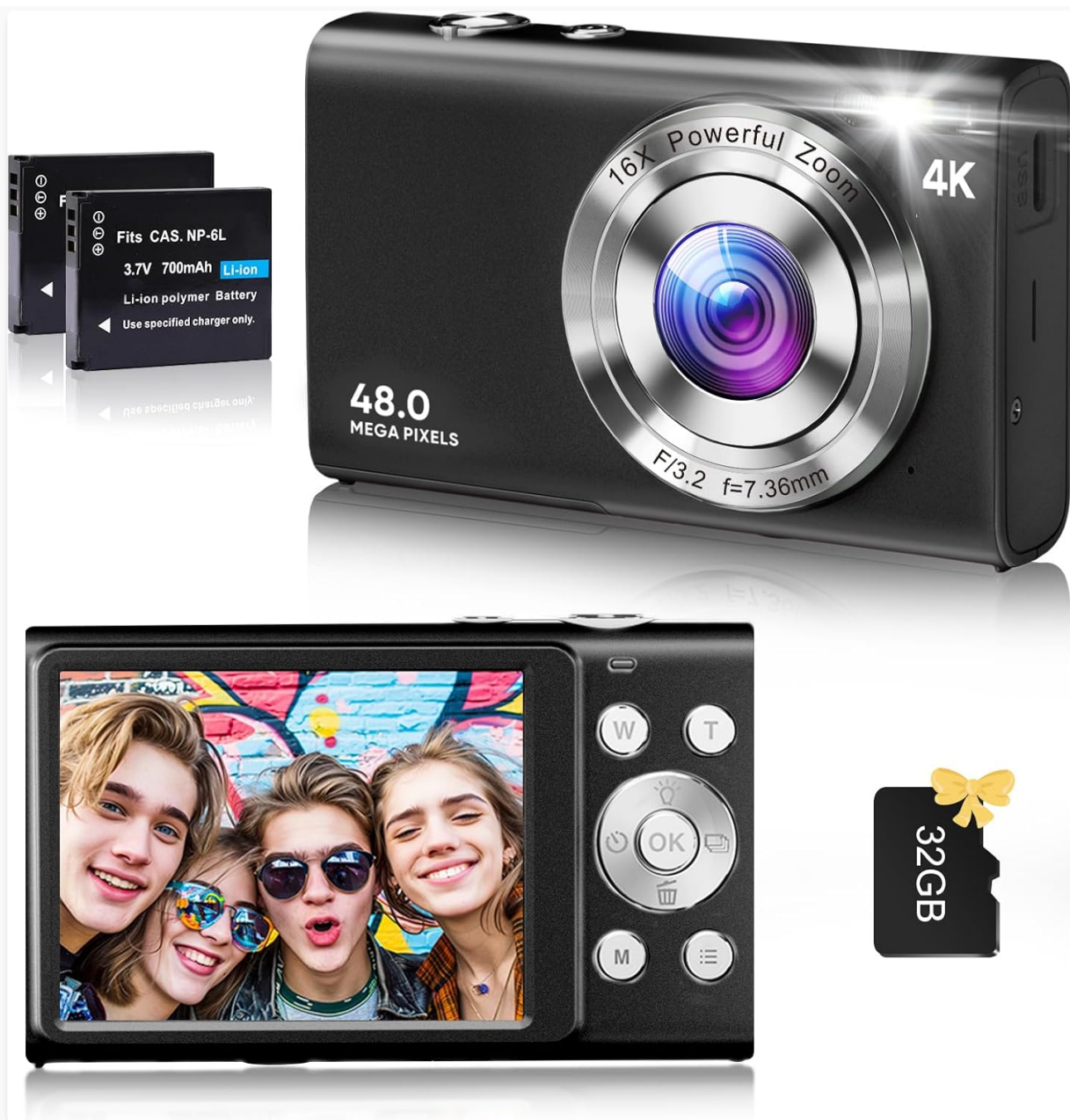
Image: The FJFJOPK DC402 Digital Camera, showcasing its sleek design, included rechargeable batteries, and 32GB memory card.