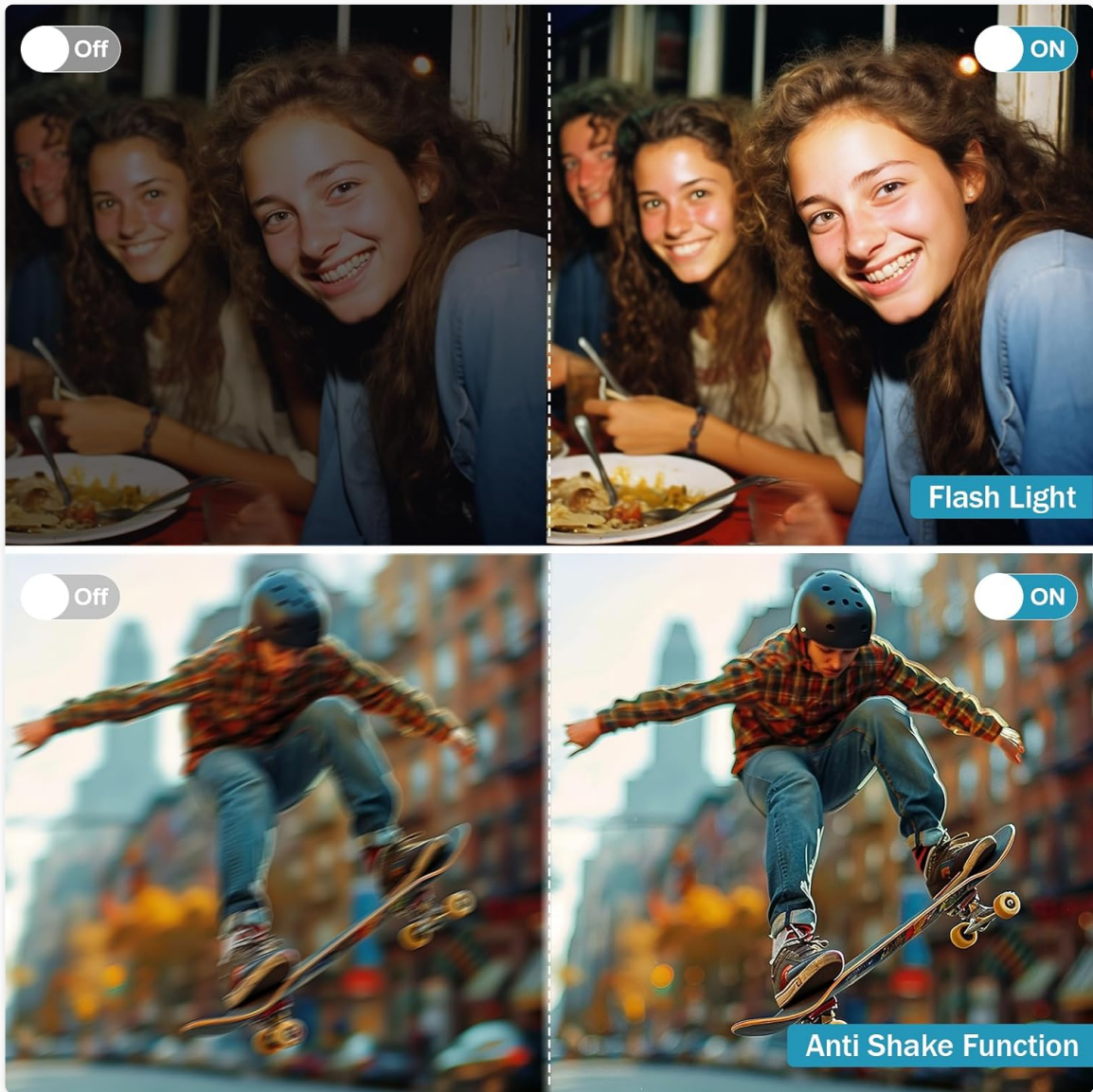
Image: Comparison illustrating the effectiveness of the anti-shake function.