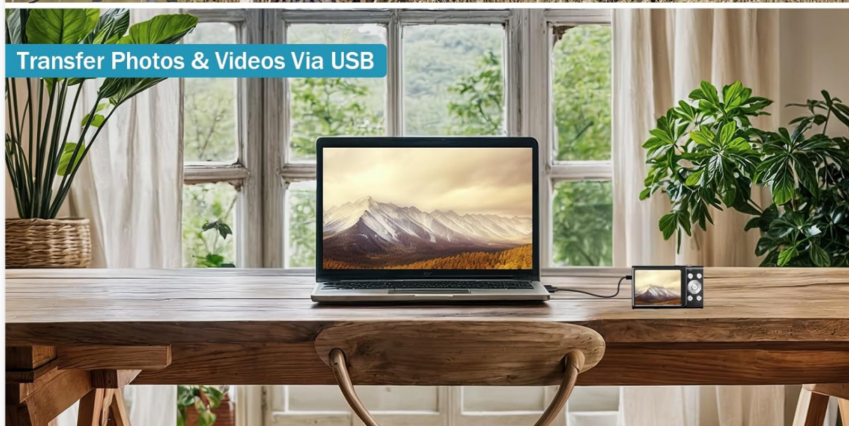
Image: Demonstrating the camera's use for vlogging and its USB transfer capabilities.