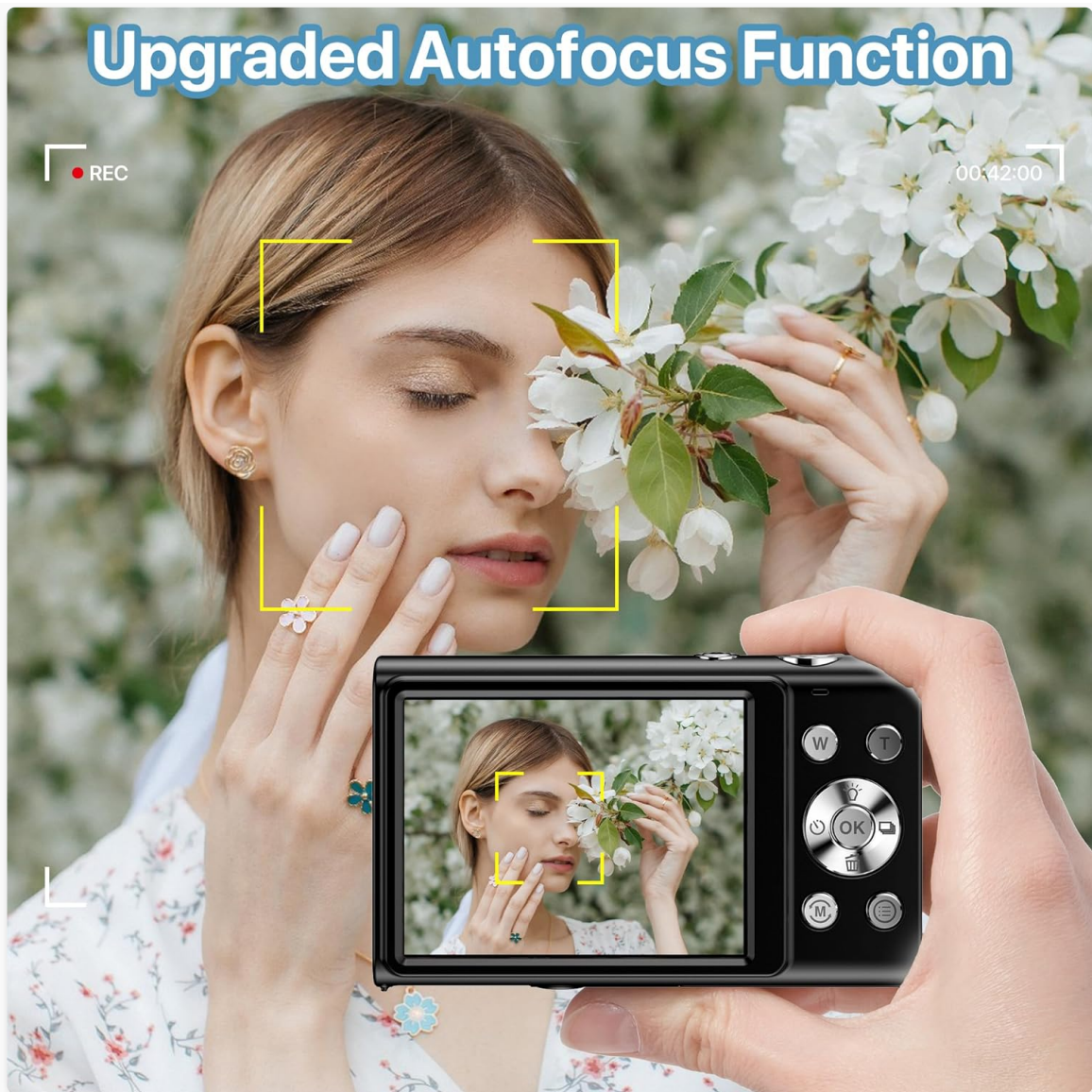
Image: Demonstration of the camera's autofocus function, highlighting its ability to achieve clear images.