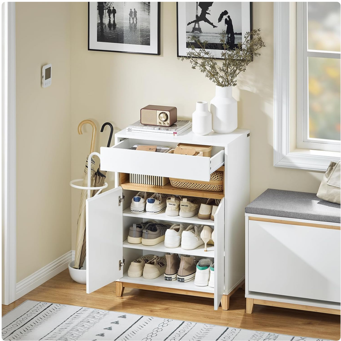
Figure 1.1: The SoBuy FSB97-WN cabinet in an entryway setting, showcasing its design and storage capabilities.