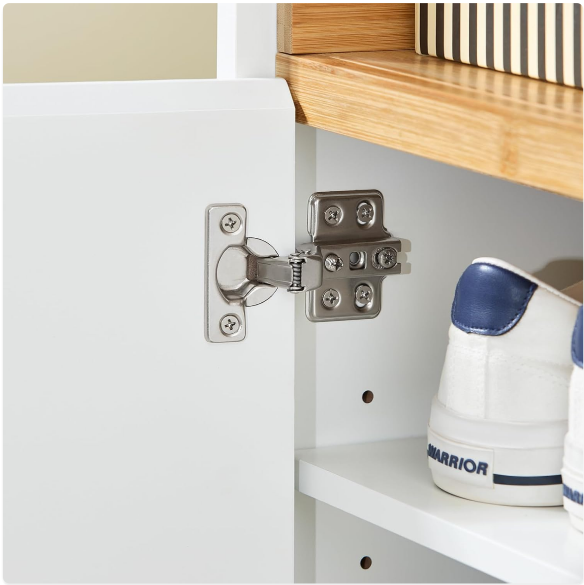
Figure 3.1: Detail of the high-quality door hinge, designed for durability.