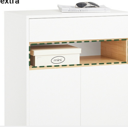
Figure 5.2: The open shelf provides additional storage and display options.