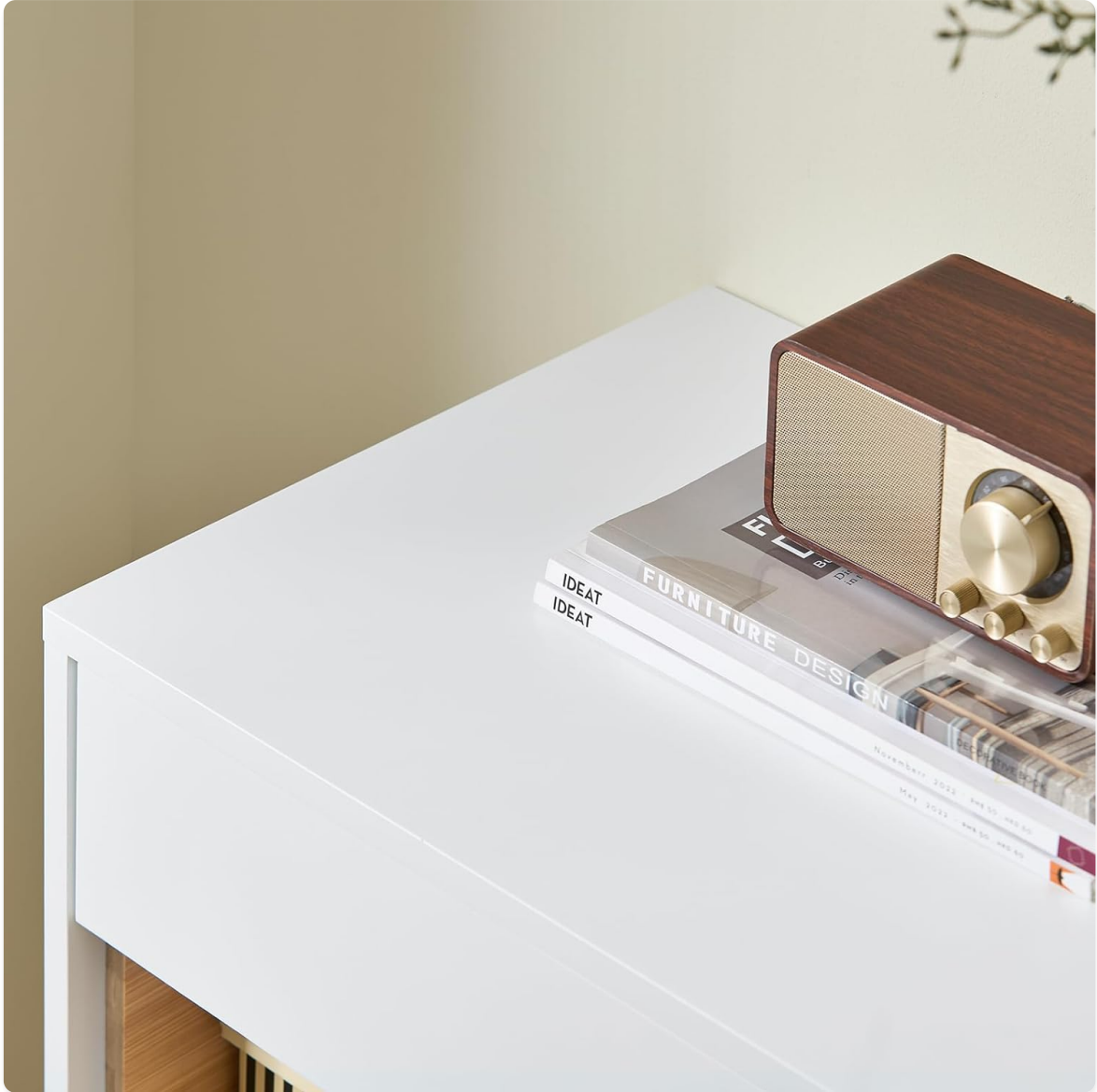
Figure 6.1: The smooth surface is easy to clean and maintain.