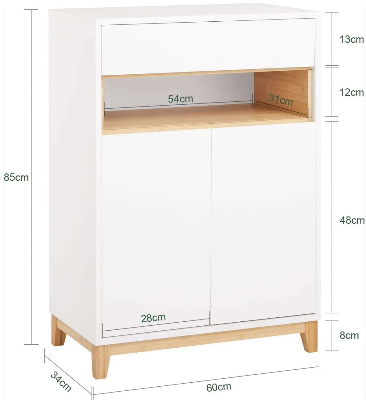
Figure 8.1: Product dimensions for the SoBuy FSB97-WN cabinet.