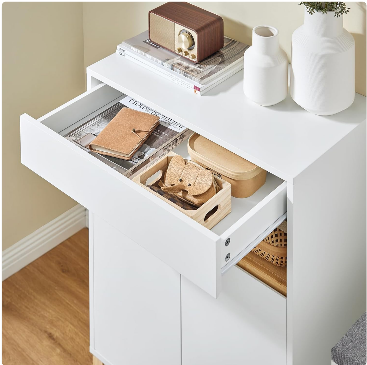
Figure 5.1: The functional top drawer provides convenient storage for small essentials.

The top drawer slides smoothly on its runners. Pull the drawer gently to open and push to close. It is ideal for small items like keys, wallets, or stationery.