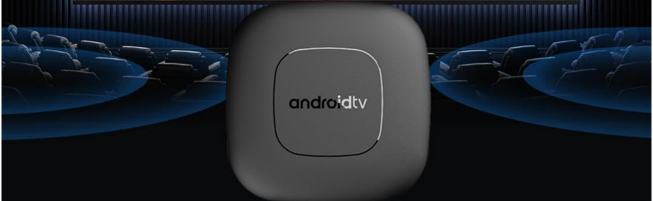
Image: A screen displaying a musical performance, highlighting the Dolby Vision and Dolby Audio capabilities of the device for an immersive experience.