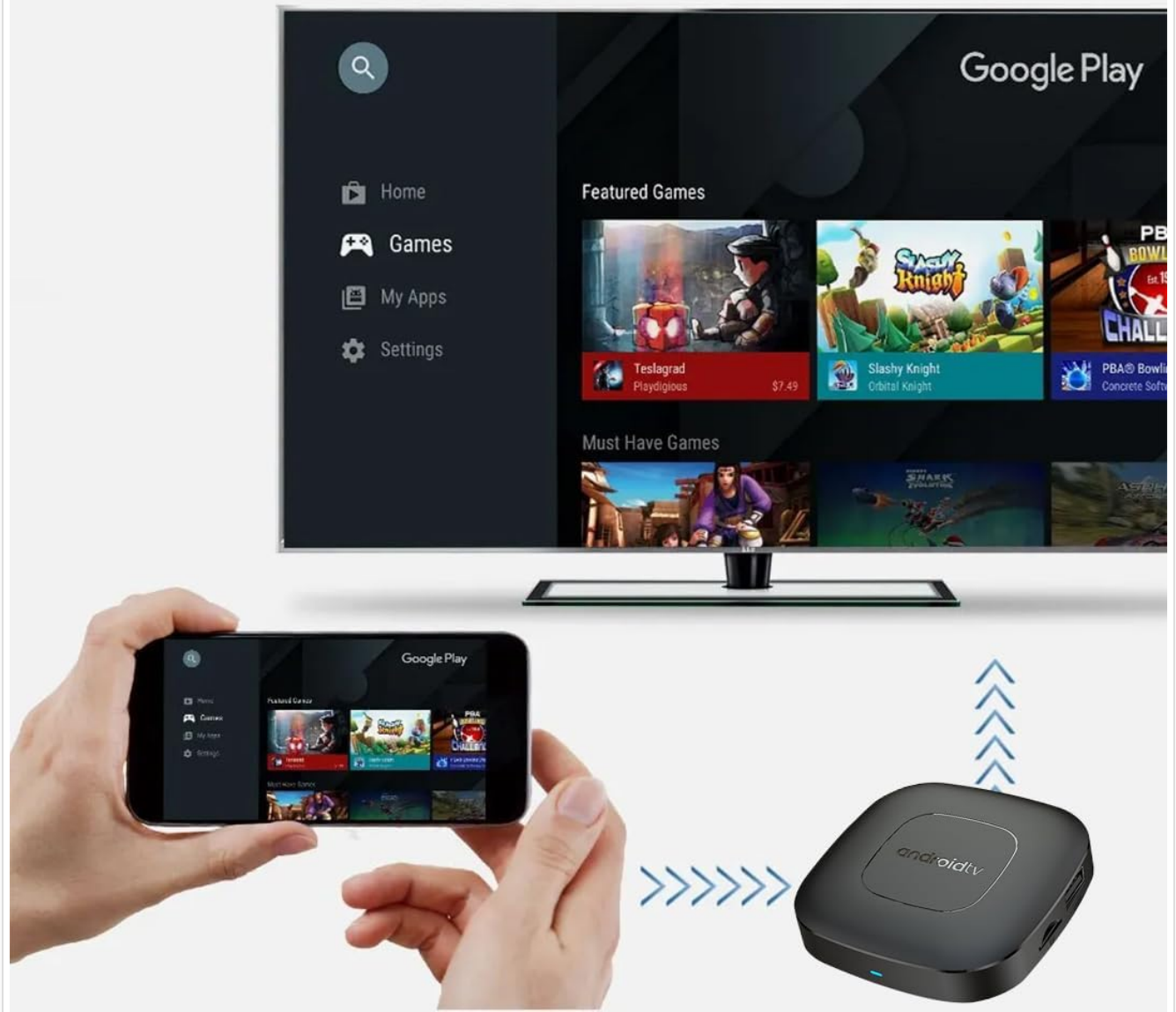
Image: A smartphone screen showing Google Play content being cast wirelessly to a television, with the Mortal T1 box acting as the receiver.