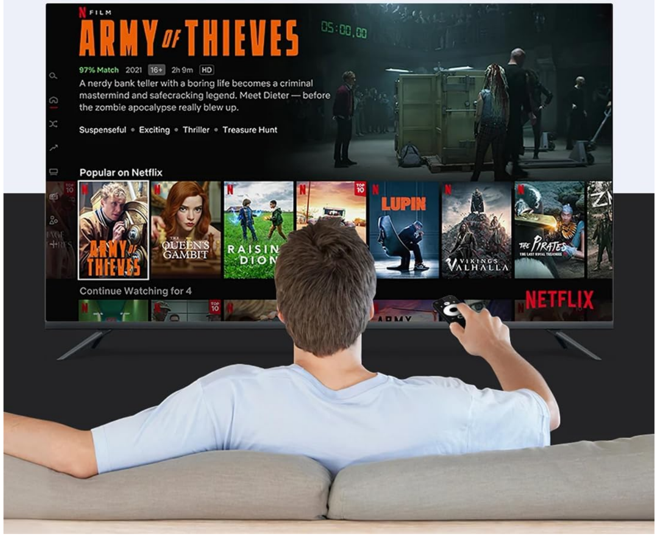
Image: A person watching Netflix content on a large screen, demonstrating the 4K Netflix TVs Version Certified feature of the Mortal T1 ATV Box.

Experience immersive audio and visuals with Dolby Vision and Dolby Audio support, enhancing clarity and color for a fully engaging viewing experience.