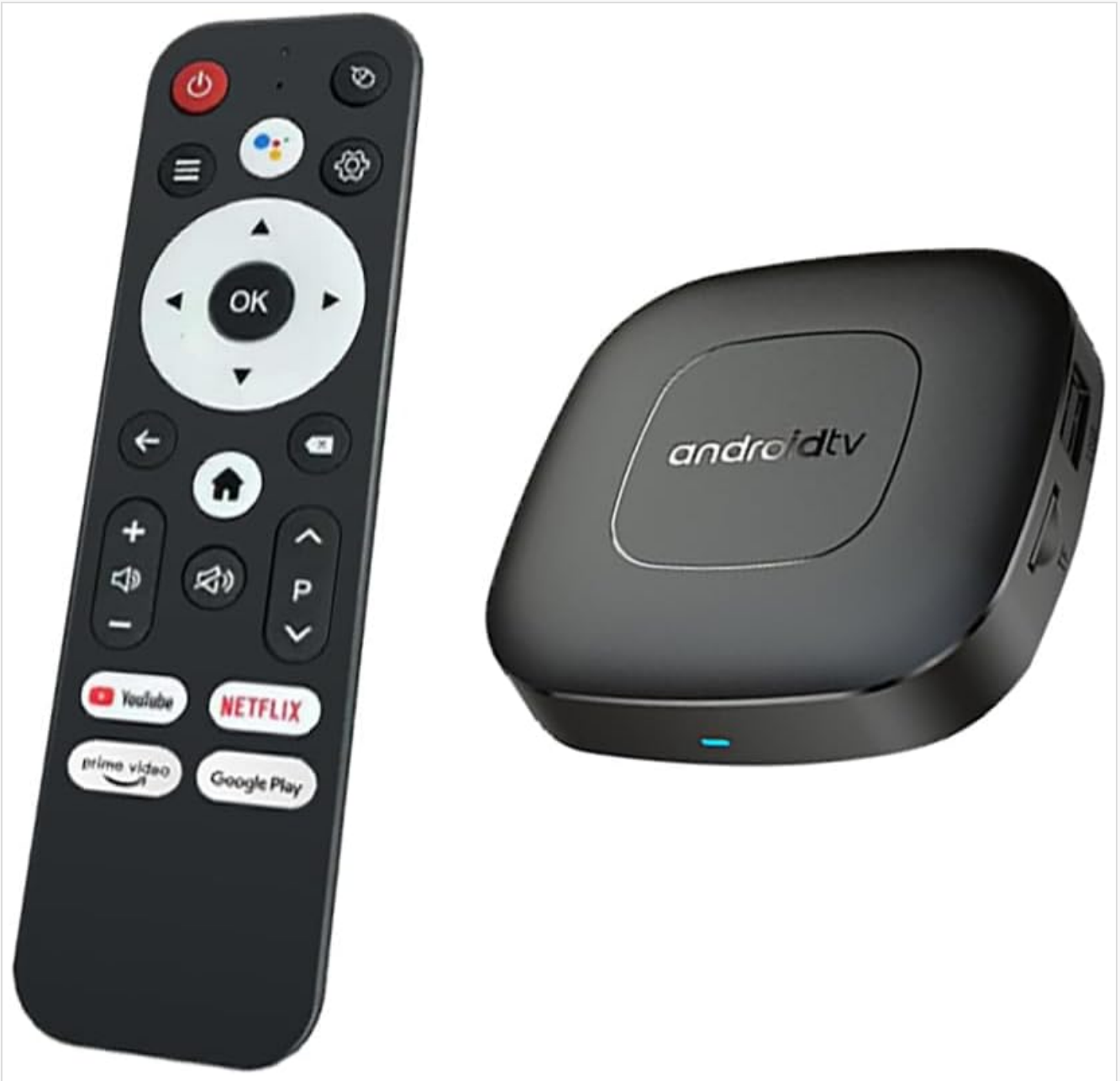
Image: The Mortal T1 ATV Box (right) and its accompanying voice remote control (left). The box is black with "androidtv" branding, and the remote is black with various media control buttons and a central navigation pad.

The Mortal T1 Deluxe Edition ATV Box is a compact and powerful media streaming device. It comes with a voice-enabled remote control for easy navigation and command input.