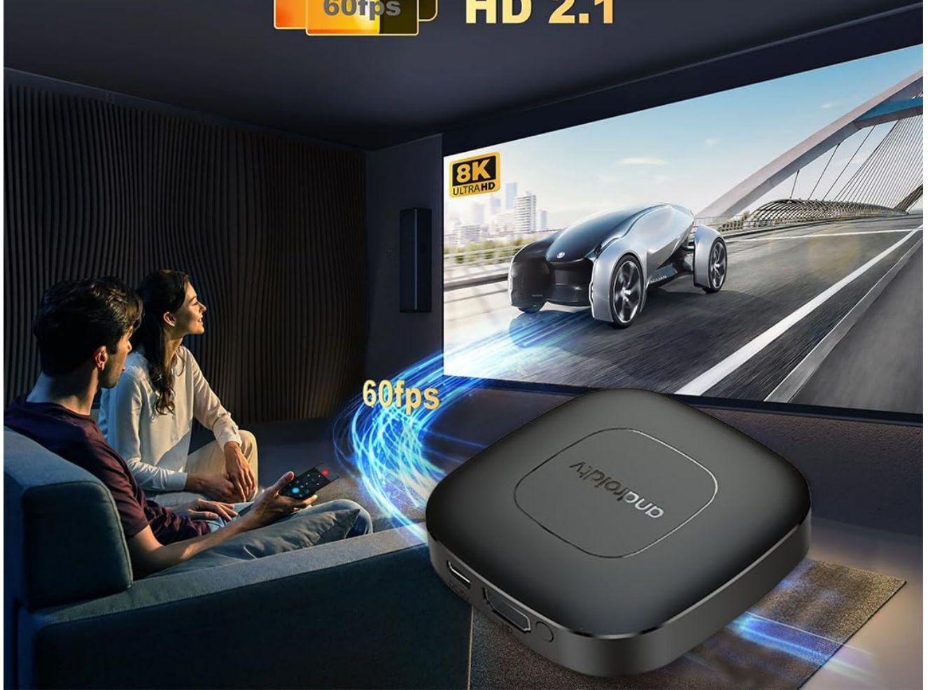
Image: A scene of people watching a car race on a large screen, highlighting the support for HD 2.1a and 8K 60fps video decoding for a smooth viewing experience.