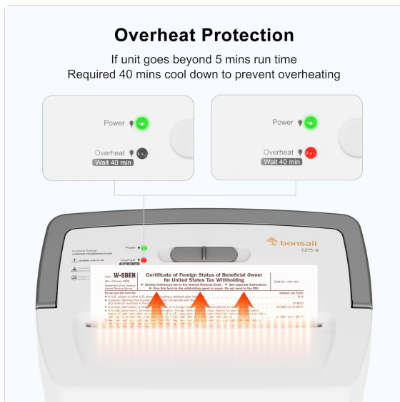
Image illustrating the overheat protection feature. The power indicator turns red and displays "Wait 40 min" when the unit needs to cool down.