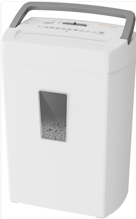
Overall view of the Bonsai C275-B paper shredder, showing its compact design and waste bin.