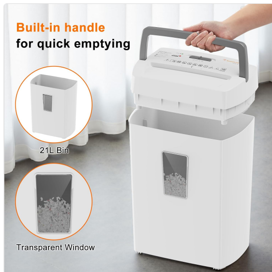
Image showing the built-in handle on the shredder head for easy removal and the 21-liter waste bin with a transparent window to monitor fill level.