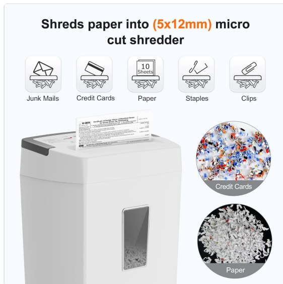
Illustration of the Bonsaii C275-B shredding various materials like junk mail, credit cards, paper, staples, and clips into 5x12mm micro-cut particles.