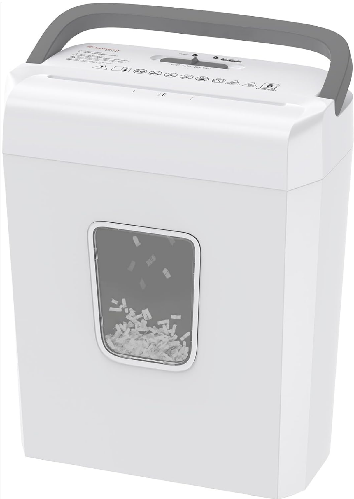
Figure 1: Bonsai C277-C Cross-Cut Paper Shredder. This image shows the overall design of the shredder, featuring a white body, a grey handle, and a transparent window on the waste bin to monitor shredded paper levels.

The Bonsai C277-C is a compact and efficient cross-cut shredder designed for personal and small office use. Key features include: