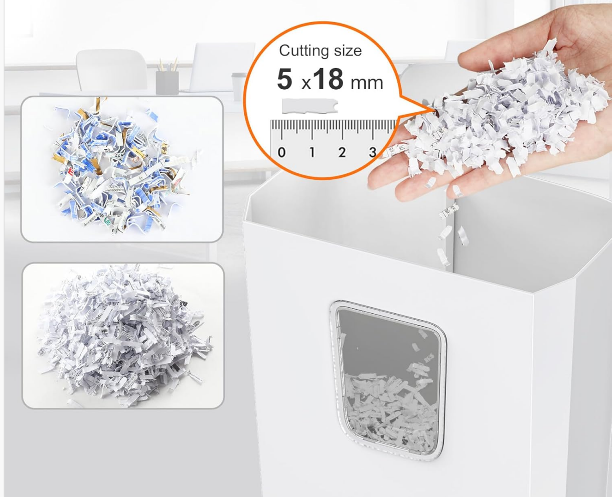
Figure 3: High Security P-4 Level. This image demonstrates the 5x18mm cross-cut size, indicating the high security level of the shredded particles. It also shows that the shredder can process credit cards, staples, and paper clips.

Also shreds credit cards, staples, and paper clips