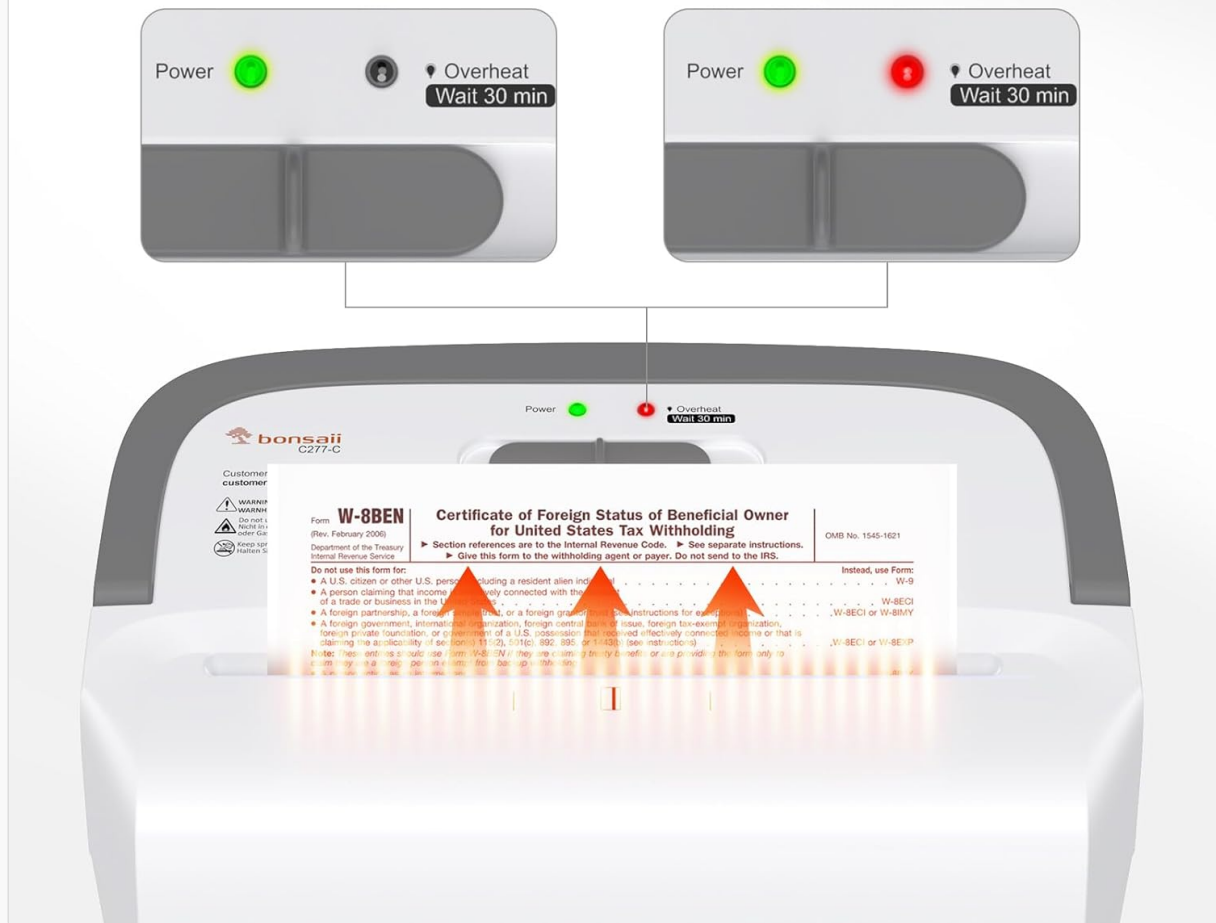
Figure 6: Overheat Protection. This image shows the shredder's indicator lights, demonstrating that the shredder automatically stops after 4 minutes of continuous operation to prevent overheating. It indicates a 30-minute cooldown period.

Stops automatically after 4 minutes, preventing overheating and extending lifespan.