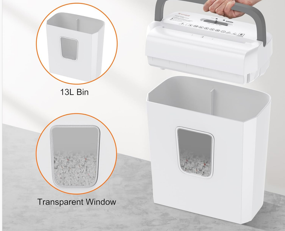
Figure 4: Built-in Handle for Quick Emptying. This image highlights the 13L waste bin with a transparent window and a convenient built-in handle on the shredder head for easy removal and emptying.

The 13L waste bin has a transparent window, allowing you to monitor the shredded paper level. Empty the bin regularly to prevent paper jams and ensure optimal performance.