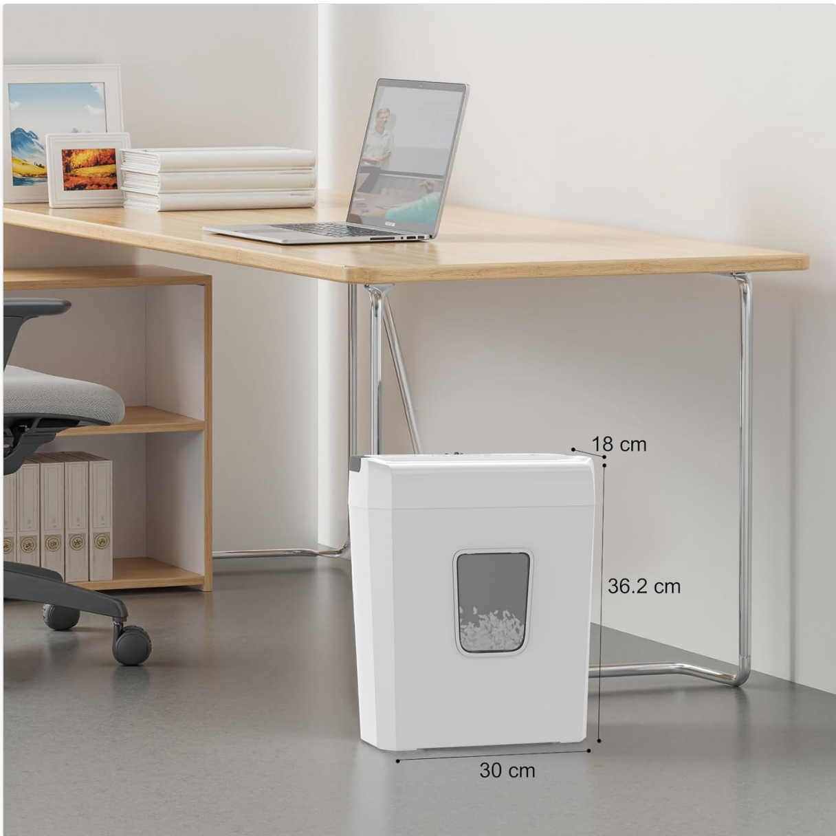
Figure 7: Bonsai C277-C Dimensions. This image provides the physical dimensions of the shredder: 18 cm (depth) x 30 cm (width) x 36.2 cm (height).