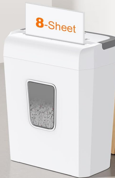
Figure 2: Powerful Shredding Performance. This image illustrates the shredder's capability to shred up to 8 sheets of A4 (80g) paper at once, with a continuous run time of 4 minutes.