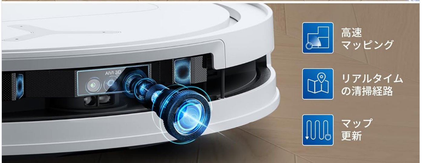
Image: The ECOVACS T50 OMNI robot vacuum cleaner demonstrating its intelligent navigation and mapping capabilities, showing a floor plan being generated.