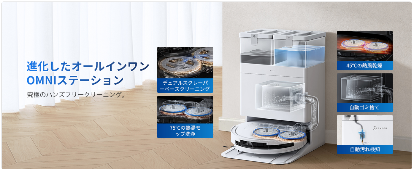
Image: The evolved all-in-one OMNI Station, highlighting its various automated functions including hot air drying, automatic dust collection, and hot water mop washing.