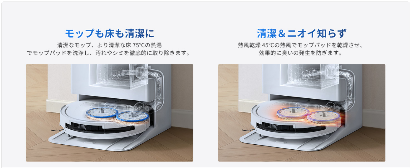
Image: A visual representation of the OMNI Station's mop washing process with 75°C hot water and the subsequent 45°C hot air drying to ensure cleanliness and prevent odors.