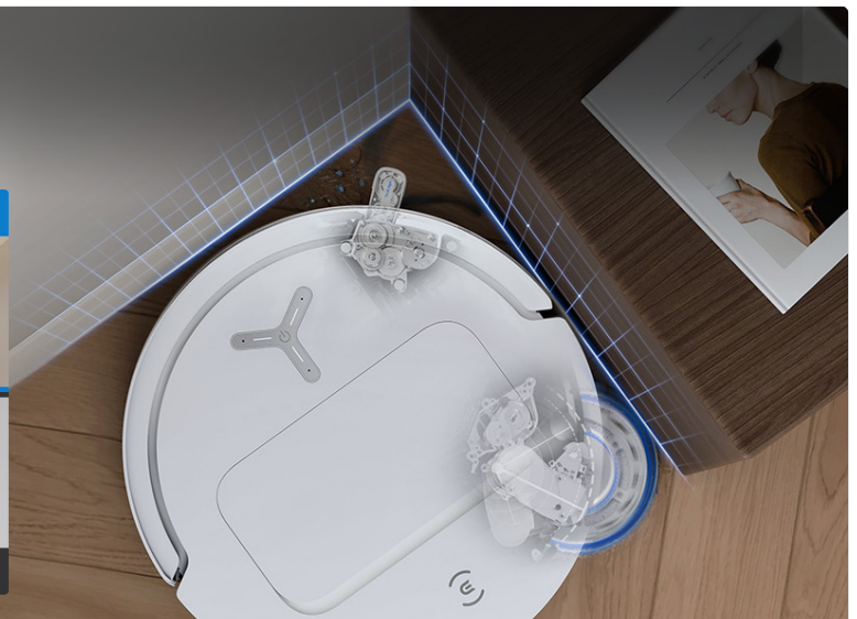
Image: A detailed view of the TruEdge 2.0 system, showing how the mop plates extend to clean close to edges and corners, achieving 100% coverage.