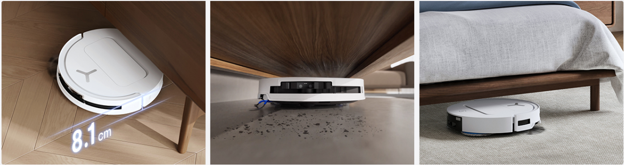
Image: The ECOVACS T50 OMNI robot vacuum cleaner demonstrating its ultra-thin design, allowing it to clean effectively under low furniture and beds.