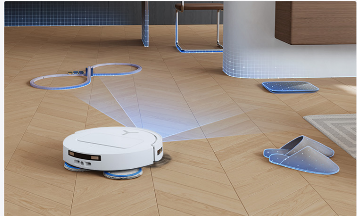
Image: The ECOVACS T50 OMNI robot vacuum cleaner using AIVI 3D technology to detect and avoid obstacles like cables and slippers on the floor, ensuring safe and efficient cleaning.

AI物体認識に特化したDEEBOTが、障害物を認識して回避し、安全で効率的な清掃を実現します。