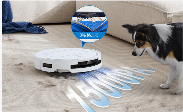
Image: The ZeroTangle 2.0 brush system, illustrating its design to prevent hair tangling, shown with a dog nearby to emphasize pet hair management.