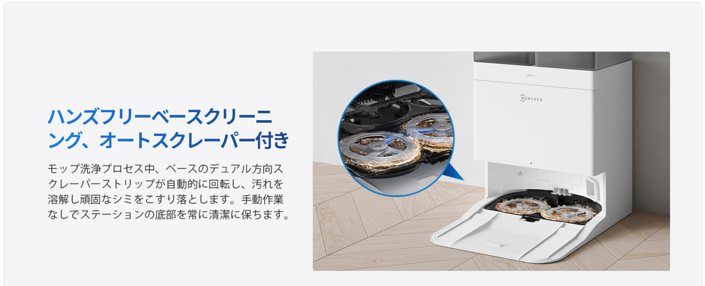
Image: The OMNI Station's hands-free base cleaning mechanism, showing the dual-direction scraper automatically rotating to clean the base and dissolve stubborn stains.