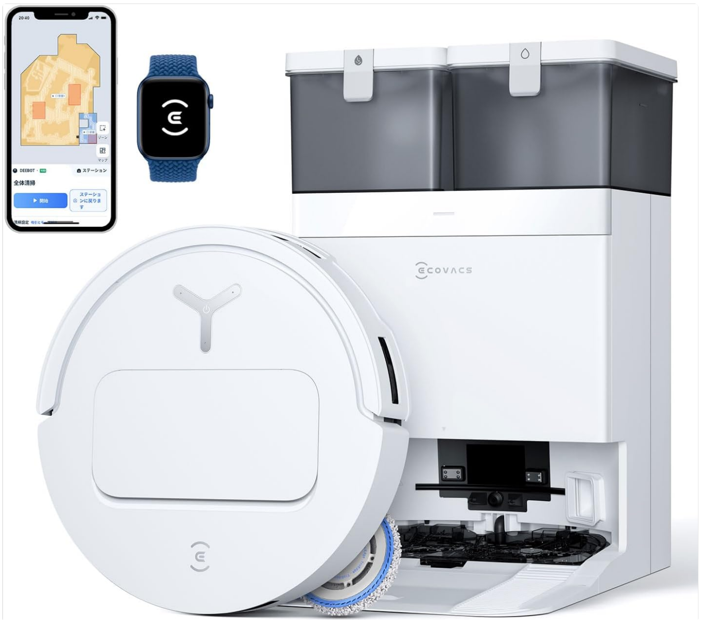
Image: The ECOVACS T50 OMNI robot vacuum cleaner, its OMNI station, and a smartphone displaying the control app, along with a smartwatch.