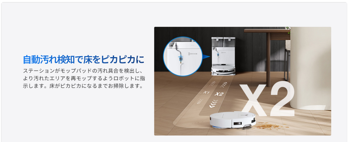
Image: The robot vacuum cleaner demonstrating its automatic dirt detection feature, where the OMNI Station identifies dirty mop pads and directs the robot to re-clean soiled areas for a spotless floor.