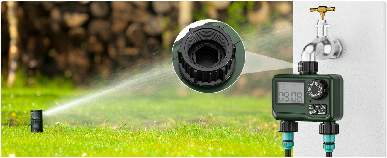
Figure 3: Timer installed on an outdoor faucet, demonstrating hose connections.