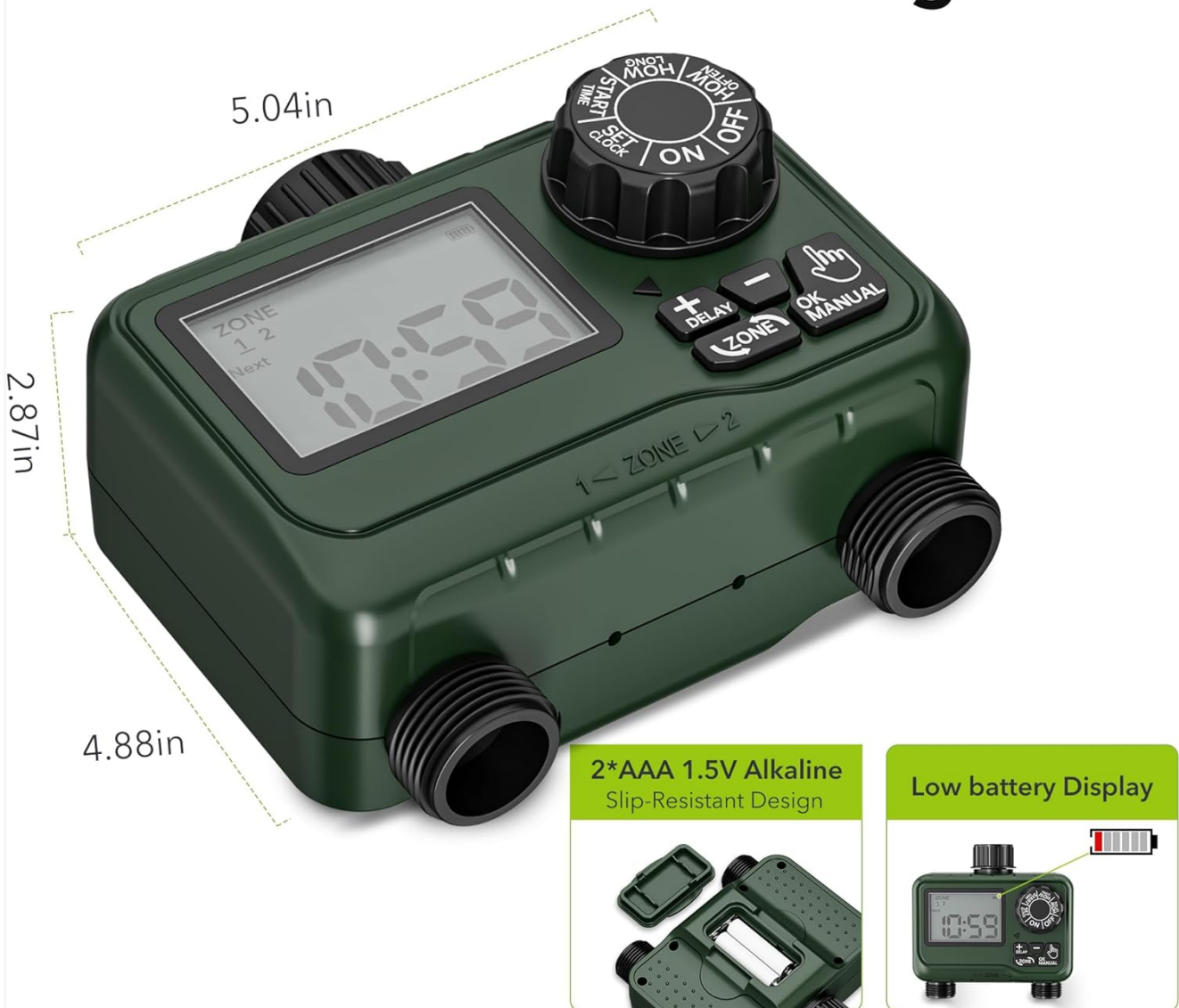
Figure 2: Rear view of the timer showing the battery compartment and overall dimensions.