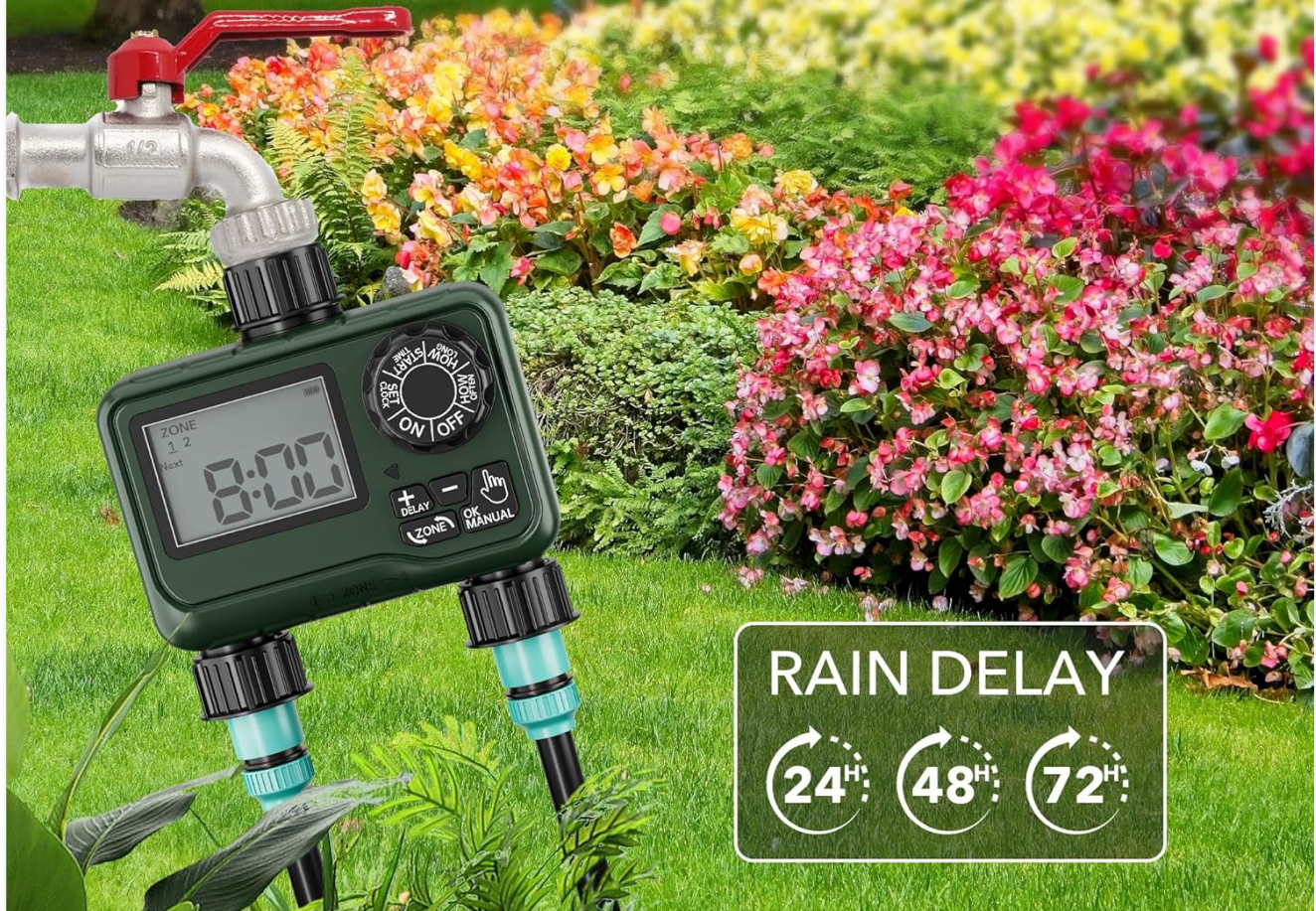
Figure 7: Timer display indicating the rain delay feature and duration options.

Independently set the Delay duration of Zone 1/2 Activate rain delay mode to Save Water