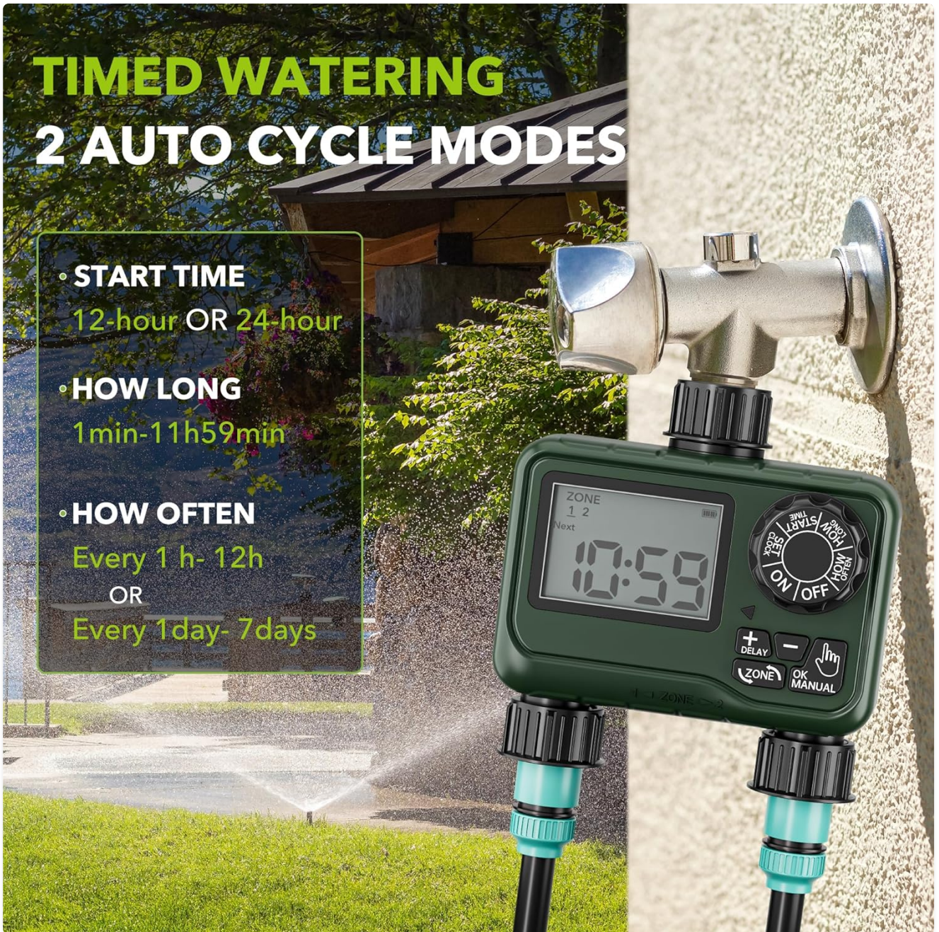
Figure 4: Display illustrating options for setting start time, duration, and frequency.