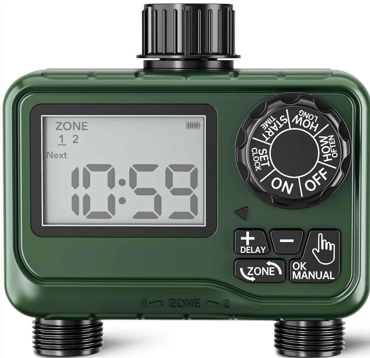
Figure 1: BN-LINK 2-Zone Sprinkler Timer, front view showing the large LCD display and control dial.