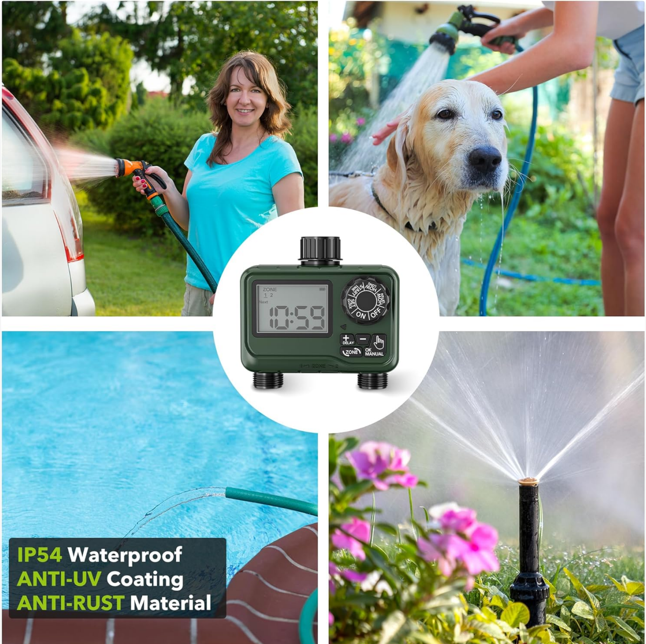
Figure 8: Illustration of the timer's robust construction for outdoor use.