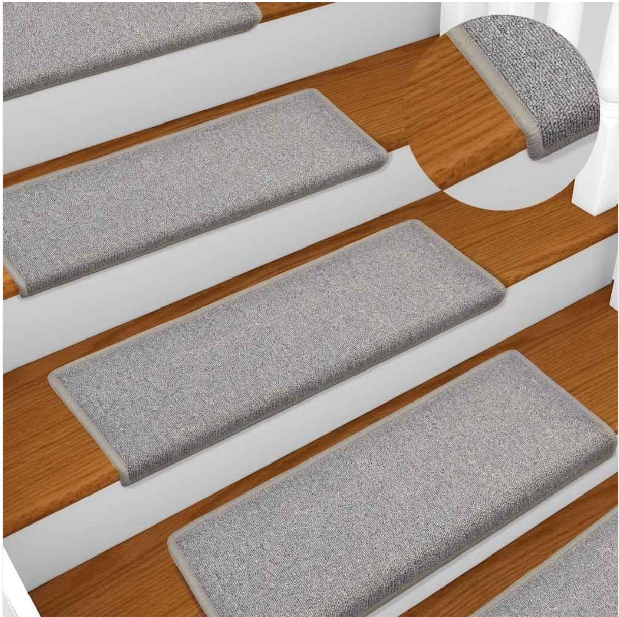
Figure 4.1: Example of vidaXL stair mats correctly installed on a wooden staircase, providing coverage and protection.

Important: For best results, avoid repositioning the mats multiple times after initial application, as this may reduce the effectiveness of the adhesive.