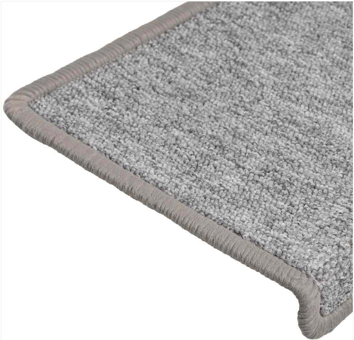
Figure 2.2: Close-up view of the stair mat's rectangular edge, showing the finished binding.