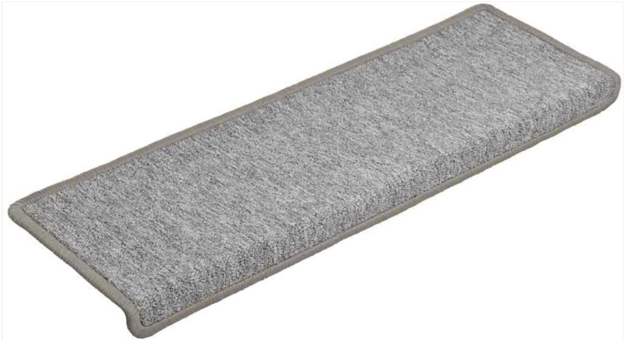
Figure 2.1: Top-down view of a single vidaXL stair mat, showcasing its light grey color and rectangular shape.